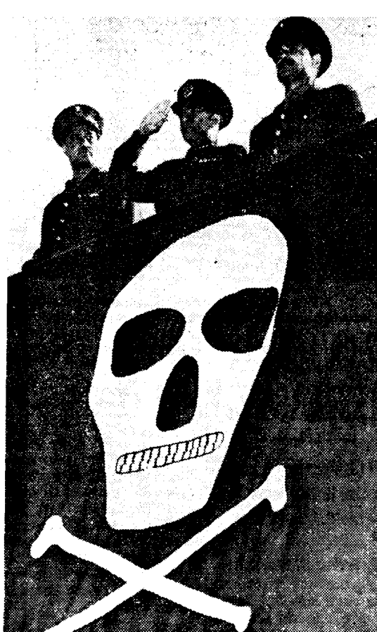
NY Times, 24 July 1972 Nasser (left) stands above symbol of "progressive" Egypt's National Guard.

Soviet support to these reactionary bonapartist regimes is always rationalized under the guise of support for "national liberation." But precisely because these regimes are intensely nationalist, they are almost invariably built through the suppression of other nations. (The creation of the state of Israel is itself a prime example.) By underwriting nationalism in Egypt the Soviets paved the way for their own expulsion. Numeiry too is a "progressive nationalist" who in the name of Arab nationalism, and using his Russian-equipped army, massacred half a million South Sudanese blacks and then wiped out the Sudan Communist Party. And it is under the banner of pan-African nationalism that Nigeria's Gowan massacred the Ibos and 100,000 Hutu tribesmen in Birundi are wiped out.