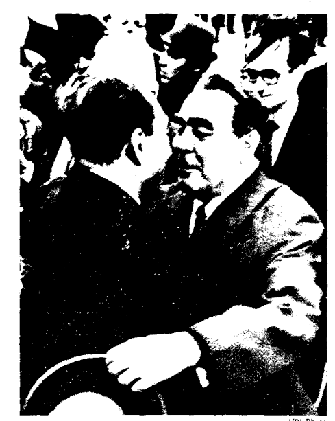
Brezhnev greets Sadat in Moscow—friendly reception failed to prevent break-up of unholy alliance.

Like the Soviets, Sadat learned his lesson from the Six Day's War. Any mass army must reflect the society of which it is the product. The Egyptian army is no exception; it reflects the