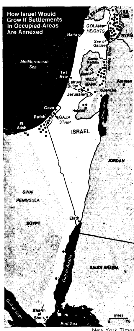
Israel's expansion if it annexes settlements in occupied areas.

Thus Israel's "settlements policy" is entirely determined by Zionist considerations of military security. Since the 1967 war, 68 settlements have been established with official Israeli sanction: 25 in the Golan Heights, 17 along the Jordan Valley, five in the Hebron vicinity (in Judea), four around Jerusalem and 14 in the Gaza strip, and three along the Gulf of Aqaba. None of these is economically viable, but the debtridden Israeli government has already invested $500 million in their develop-