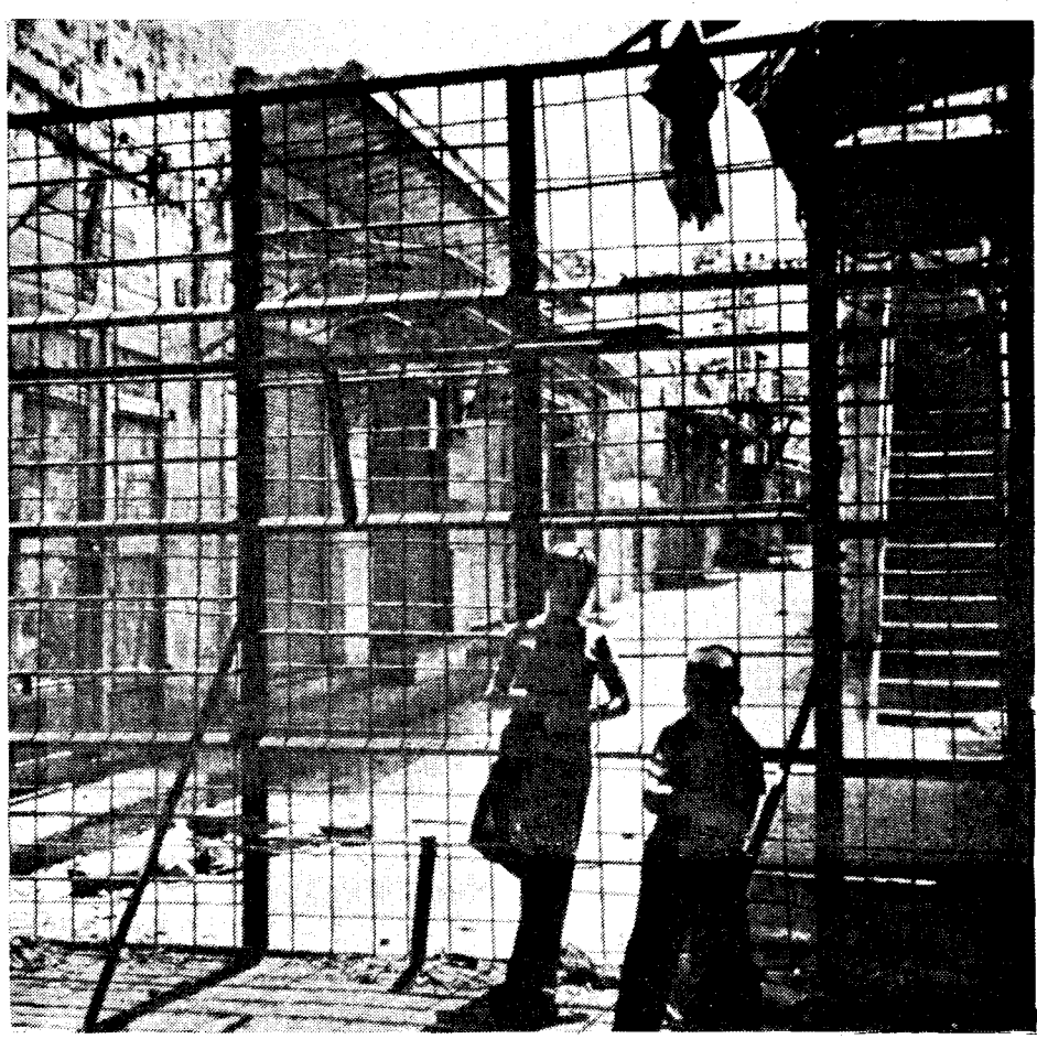
Israelis erected steel gates in Nablus to enforce curfew.

However Gush Emunim—supported by the "Labour" Party's governmental coalition partner, the National Religious Party (NRP) of orthodox rabbis and religious fanatics, and by the rightwing opposition bloc, Likud, led by Manachim Begin, perpetrator of the infamous Deir Yassin massacre wants settlements in Samaria precisely in order to thwart any possibility that