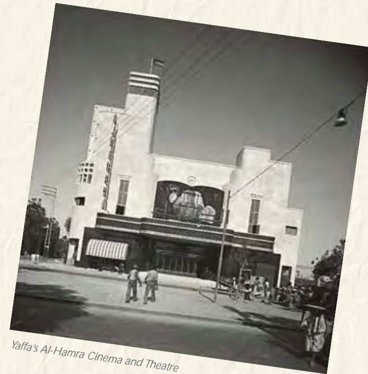
Yaffa's Al-Hamra Cinema and Theatre