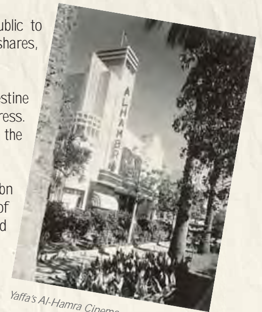
Yaffa's Al-Hamra Cinema and Theatre