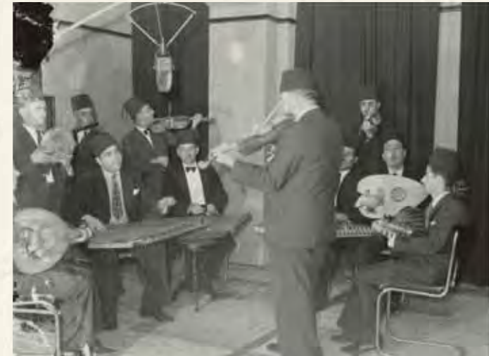
Music Band of Palestine Broadcasting Service, Jerusalem