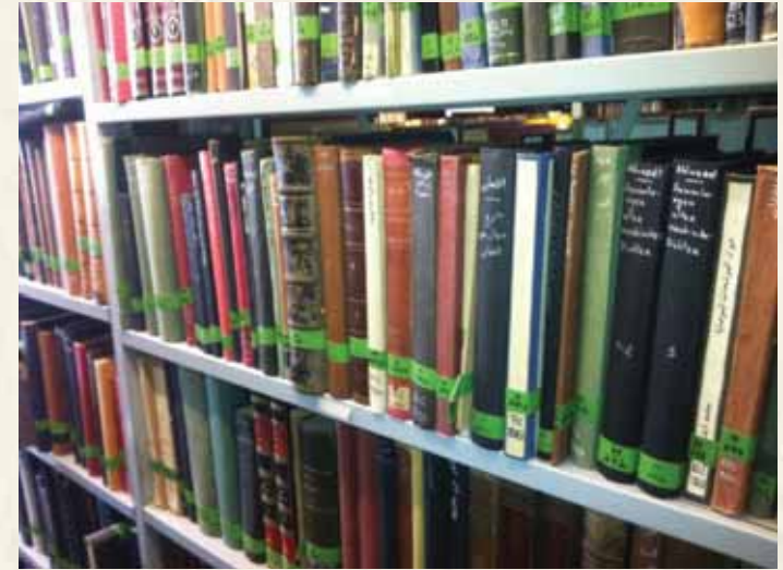
Israeli National Library

A recent project entitled 'The Great Book Robbery' ( http://thegreatbookrobbery.org/ ), sets out to build a virtual library of these books and find their legal heirs. One of the project's main features is a documentary, which tells this tragic story of the loss of these precious belongings, through interviews with the owners and their descendants. The books, as documented by 'The Great Book Robbery', span from the mid-nineteenth to the mid-twentieth century, and cover a great variety of genres such as history, literature, poetry, language, religion, foreign books, technology, medicine, and even a governmental report of the school curriculum in 1947.