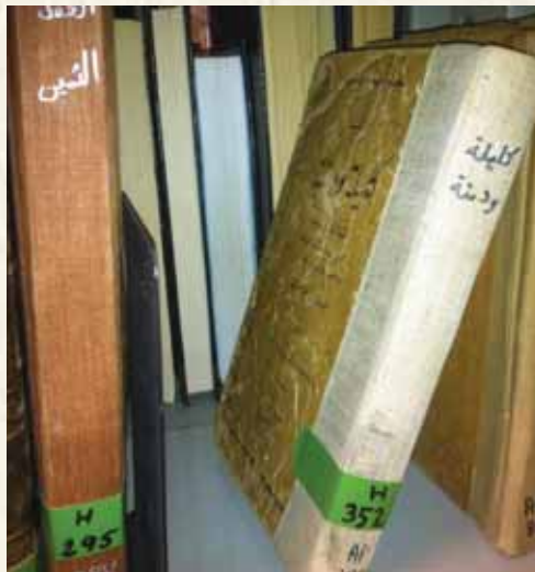
Books bearing AP mark, Israeli National Library

The majority of the books that are in the possession of the National Library of Israel are now kept in closed stacks and must be requested in order to view them. Some can be found amongst regular books on the shelves, displaying new record numbers but still bearing the tell-tale mark 'AP' on their spines. Many have pencil marks inside them denoting the original owner, such as SAK for Khalil Sakakini and NIMR for Muhammad Nimer al-Khatib.