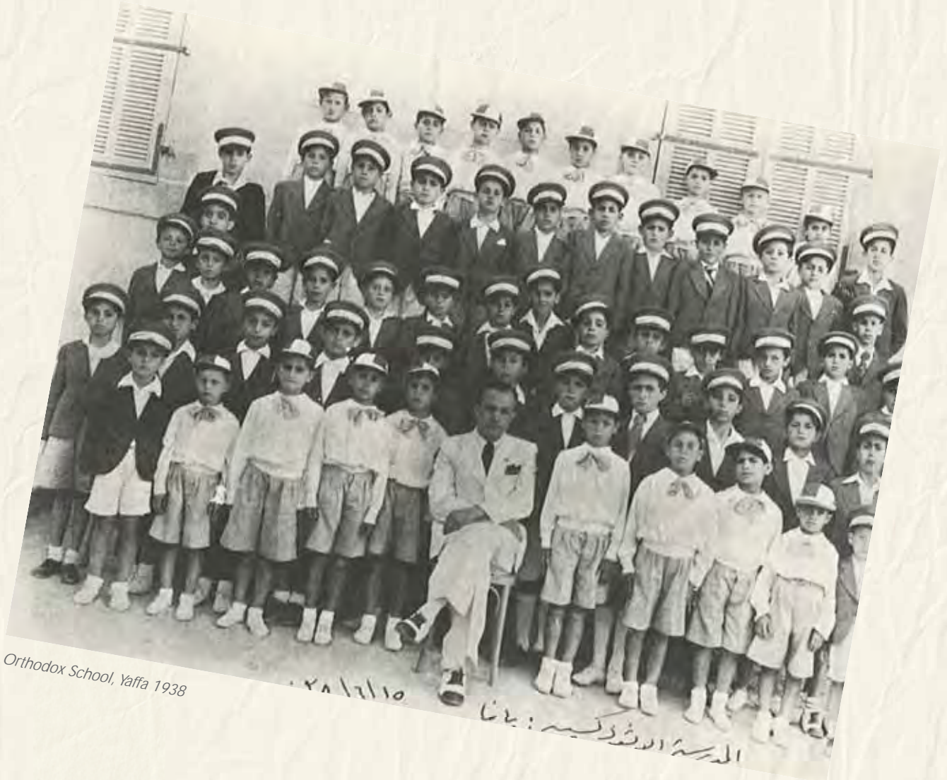
Orthodox School, Yaffa 1938