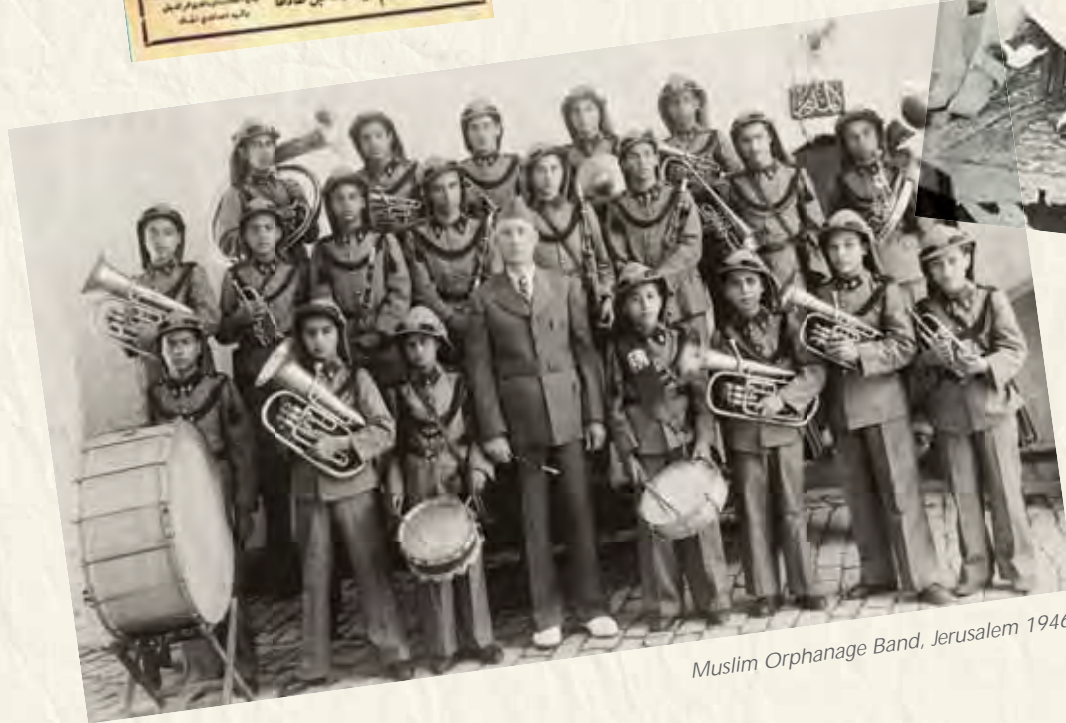
Muslim Orphanage Band, Jerusalem 1946