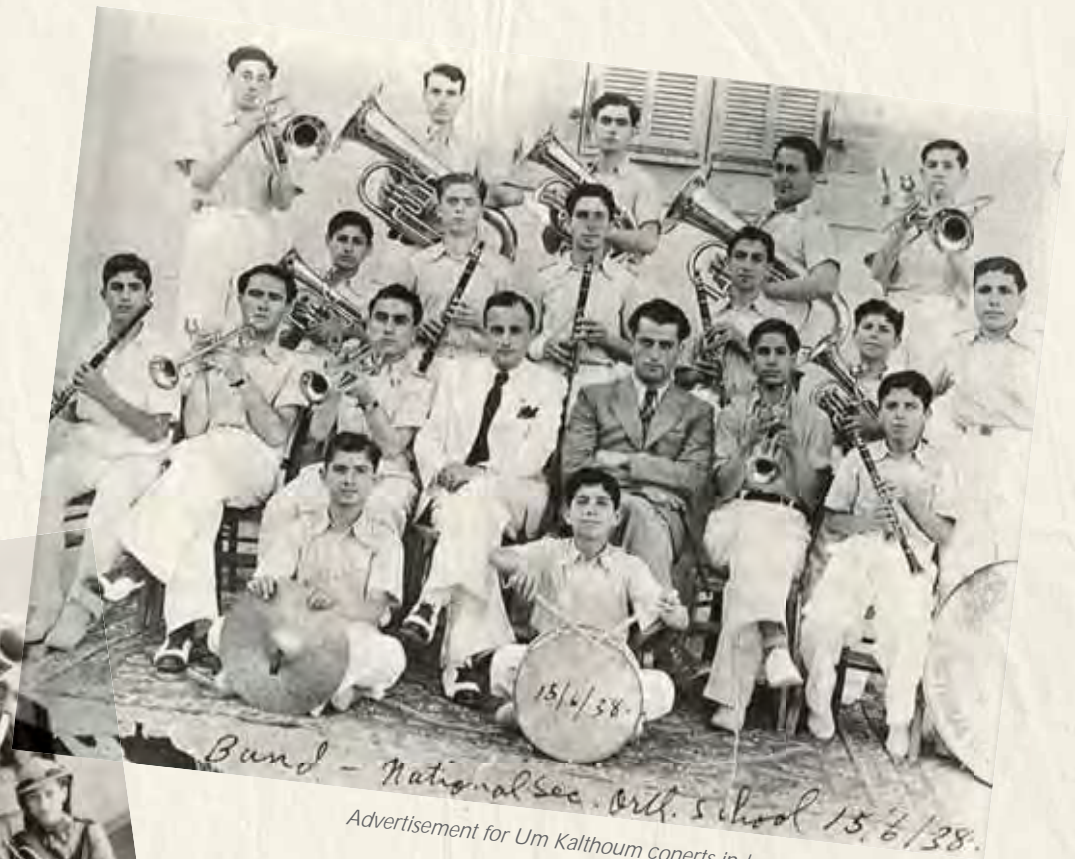
Band - National sec. orth. school 15.4/38.