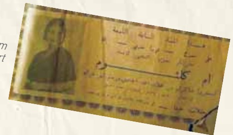
Ticket for Um Kalthoum concert