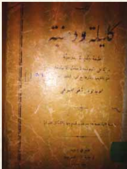
Storybook Kalila and Dimna, now among books marked 'AP' in Israeli National Library

"Years later the Israeli Custodian removed the veil of secrecy: 'The inspectors found most of the houses broken into, and rarely was there any furniture left,' he wrote in his memoirs. 'Clothes, household effects, jewelry, bedding-other than mattresses-never reached the warehouses of the Custodial authority.' ...More than 50,000 [Palestinian] homes had been abandoned, but only 509 carpets reached the Custodian's warehouses" - Tom Segev 51