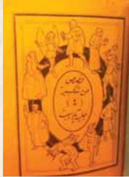
Left: [Lamb, Charles Stories from Shakespeare, 1930: a translation of some of Shakespeare's popular stories into Arabic. The one depicted here is "Much Ado about Nothing". The letters SAK in the top right corner denote that the book belonged to Khalil Sakakini]

Between 1911 and 1948, there were at least 161 newspapers, magazines, and other regular publications covering current news, literary news, arts, humor, sports, and medicine. These publications included the Arab Palestinian Medical Magazine (Jerusalem), the quarterly Arab Agriculture Magazine (Jerusalem), the Arab Economics Magazine (Jerusalem), the weekly Cinema and Film Magazine (Jerusalem), and the weekly Sports Life (Yaffa), the weekly literary magazine Al-Nahda (Haifa), and the Yaffa Chamber of Commerce's quarterly magazine. 11