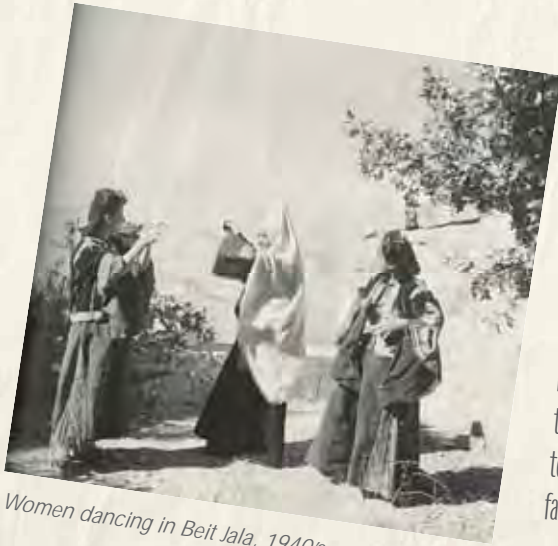
Women dancing in Beit Jala, 1940s

"The guest-house or coffee house (diwan) was the popular informal gathering place in the village. It was the locus for "the discussion of public events, and for story-telling . . . playing games, and, especially during ramadan and at other festivals, is often enlivened with music. The coffee house is the substitute for the public-house, theatres, concert-halls, and all else" (Goodrich-Freer 1924:153). Visitors could stay in the villages guest-house and entertain them- selves freely." 1