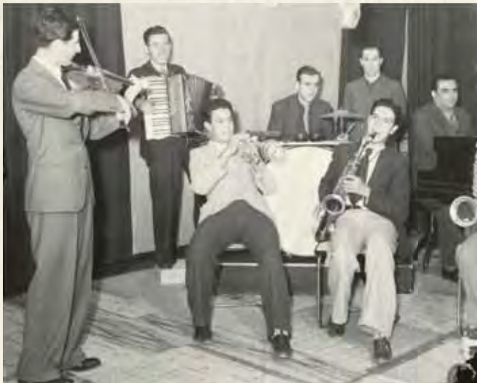
Music Band of Palestine Broadcasting Service, Jerusalem