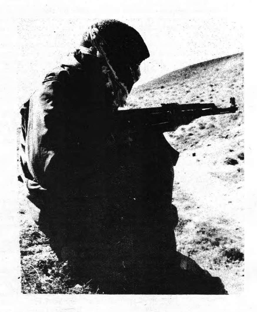
Comrade Nayef Hawatmeh Secretary-General of the DPFLP Political Bureau