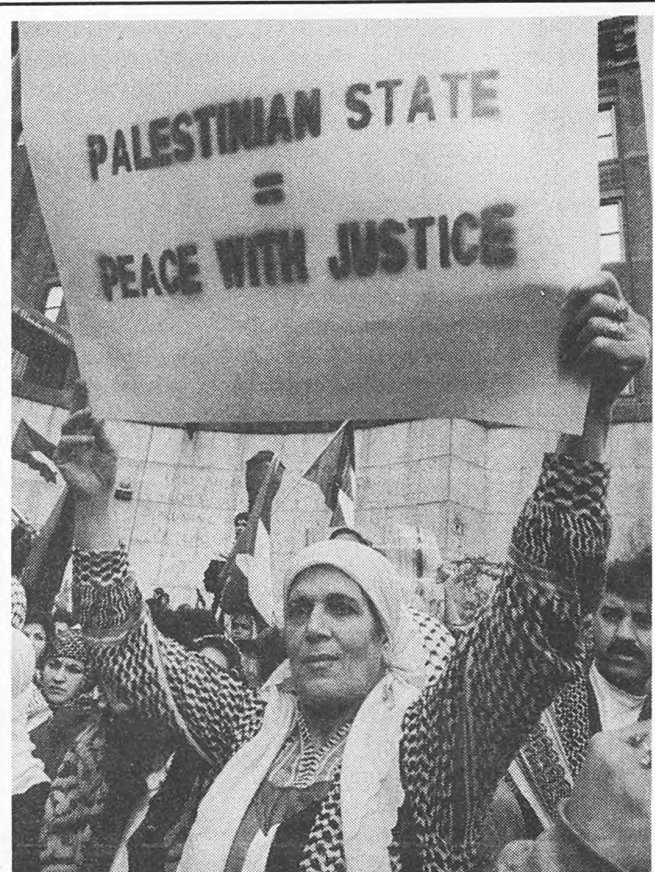
Palestinian woman demonstrates Dec. 1st in front of the United Nations in New York.

For further information, contact the Women's Organization for Women Political Prisoners, P. O. Box 31811, Tel Aviv 61318, Israel. Donations to support their work may be sent to Bank Hapoalim, Branch 532, Account No. 260643, 30 Even G'virol Street, Tel Aviv 64078, Israel. □