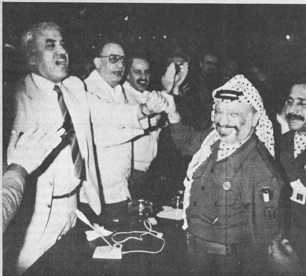
PLO Chairman Yasir Arafat and Palestinian leader Dr. George Habash celebrate the newly declared independent Palestinian state.