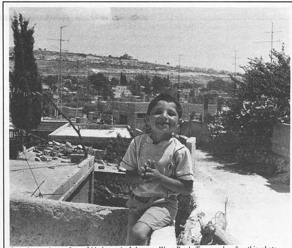
Boy sits on the rooftop of his home in Jalazoun, West Bank. Two weeks after this photograph was taken, his house was blown up by the Israeli military because his brothers participated in the intifada. On the hill in the distant background, on the right, a Jewish settlement overlooks Jalazoun.

Many of the popular medical committees have stepped in and picked up much of the slack, but they must operate with far greater caution than the UNRWA clinics, since the popular committees are, after all, outlawed. These committees also suffer from a shortage of resources and a more fragile delivery system. Nevertheless, these committees are beginning to build the medical infrastructure that will be