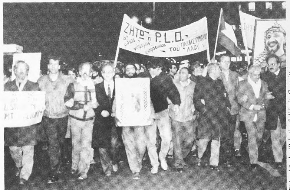
Emergency demonstration to support PLO in Athens in February.

The original plan had the ship departing Athens on February 10, stopping in Cyprus and Egypt to pick up more expellees, and then sailing toward Haifa. However, an intense Israeli campaign of pressure and threats caused a number of shipowners to cancel leasing agreements. These threats, according to reports in the international media, were against the lives of owners and their families, as well as their economic interests.