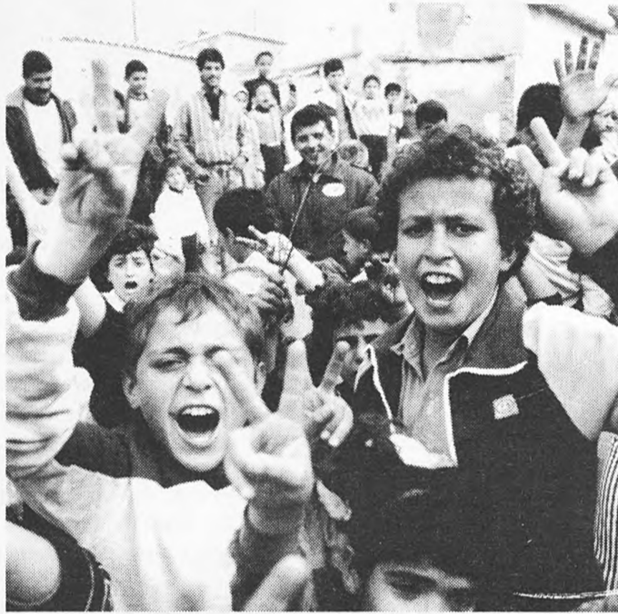
Palestinian youth play an important role in the West Bank and Gaza.

The strikes have been called in clandestine leaflets, a