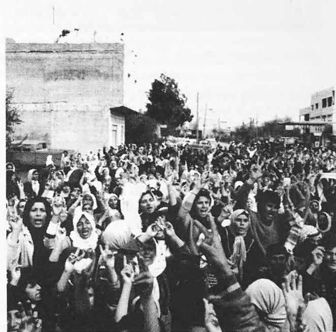
Funeral/demonstration in Idna in West Bank.

Every day brings scores of new arrests, with no particular charge other than demonstrating. At Moscobiyya, the