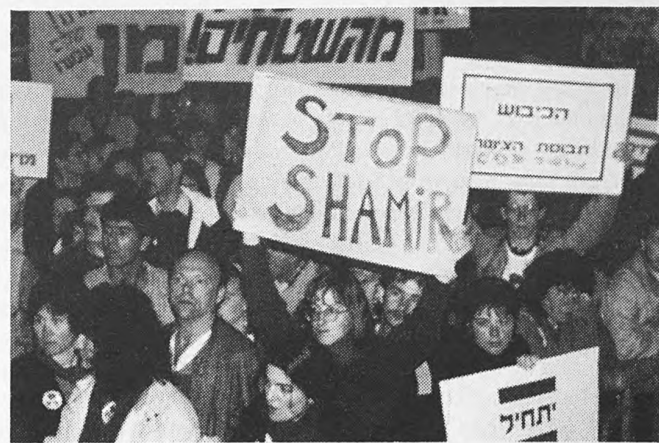
Israeli peace group protests Shamir's policy.

Only then did the tone of the Israeli leaders change; even the defense minister has had to admit that the authorities erred in their evaluation of the nature and length of this popular outbreak. He has actually turned 180 degrees. For Rabin, the PLO is no longer behind these demonstrations. On the contrary, they are spontaneous and show, asserts Rabin, how weak is PLO influence in these occupied territories. Prime Minister Shamir adds in turn that after things go back to normal they will start to apply the autonomy status promised by Israel during the Camp David negotiations. Of course Shamir speaks of autonomy and of dialog with the local people so as to