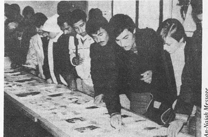
Students at Palestinian book exhibit at An-Najah University

The Israeli army has not been the sole cause of death and injury on the Palestinian campus. Factions of the Israeli settler movement have frequently entered the campuses with weapons. The most serious of these incidents occurred on July 26, 1983 when three members of a settler