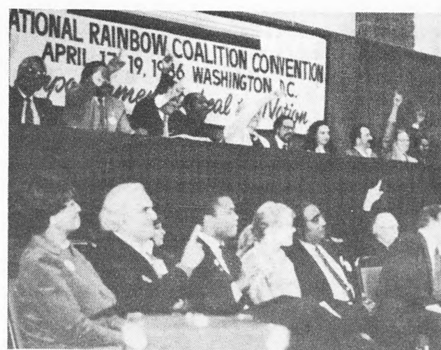
April 1986 National Rainbow Coalition Convention.

One outstanding example took place in 1981 when the Reagan administration reported that a "Libyan hit squad"