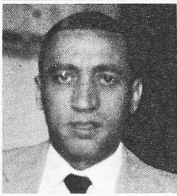
Hilton Obenzinger/Palestine Focus