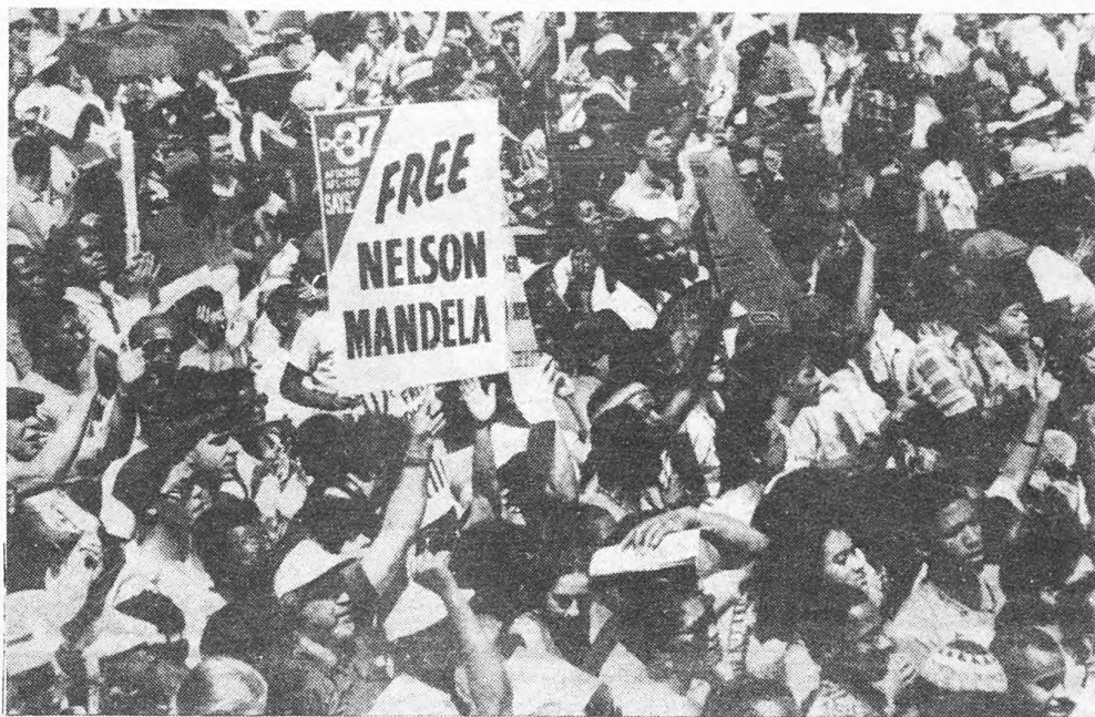
June 14, 1986 anti-Apartheid demonstration in New York's Central Park.

important issue of Palestinian rights under the rhetoric of "terrorism." Reagan avoids the real issues; the peace movement cannot afford to do so.