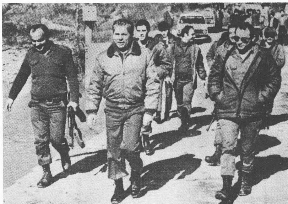
South Lebanon Army General Lahad with Israeli troops in south Lebanon.

tion of their traditionally underrepresented communities; and rejection of Israeli intervention in Lebanese politics and continued occupation of the south.