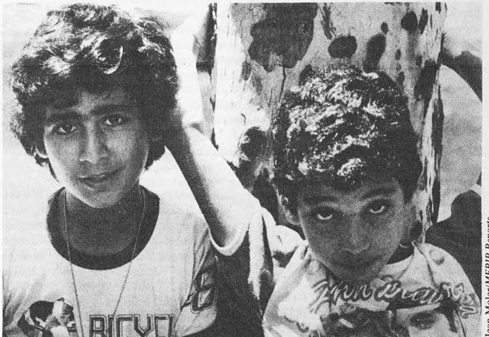
Israeli children of Beit Sha'an development town.

It is not allowed to have racism among Oriental Jews. We will not forget the glorious history when we lived in friendship and