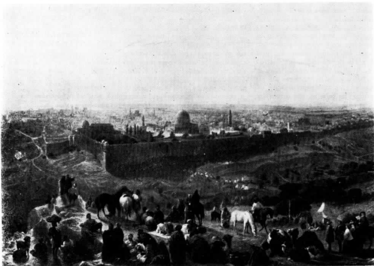
OUR NEW YEAR'S GREETINGS