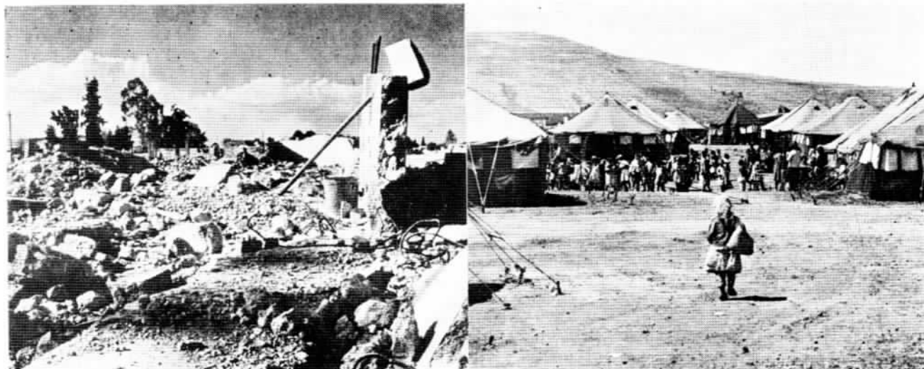
« We welcome the departure of any Arab who does not approve of our policy of suppressing demonstrations and strikes » (Moshe Dayan, 29 October 1968, AP, AFP)