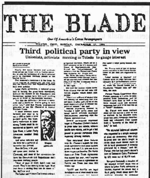
Lead article in the Sunday, December 11 Toledo Blade - "Third political party in view - Unionists, activists meeting in Toledo to gauge interest"

Toledo conference for a labor party — a big step forward page 3