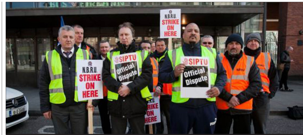
Rail workers picke

cut in subvention between 2008 and 2015. If the company funding