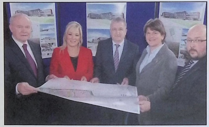
Out with the old and in with the new

And the Sinn Fein leadership's initial reaction was to turn a blind eye.