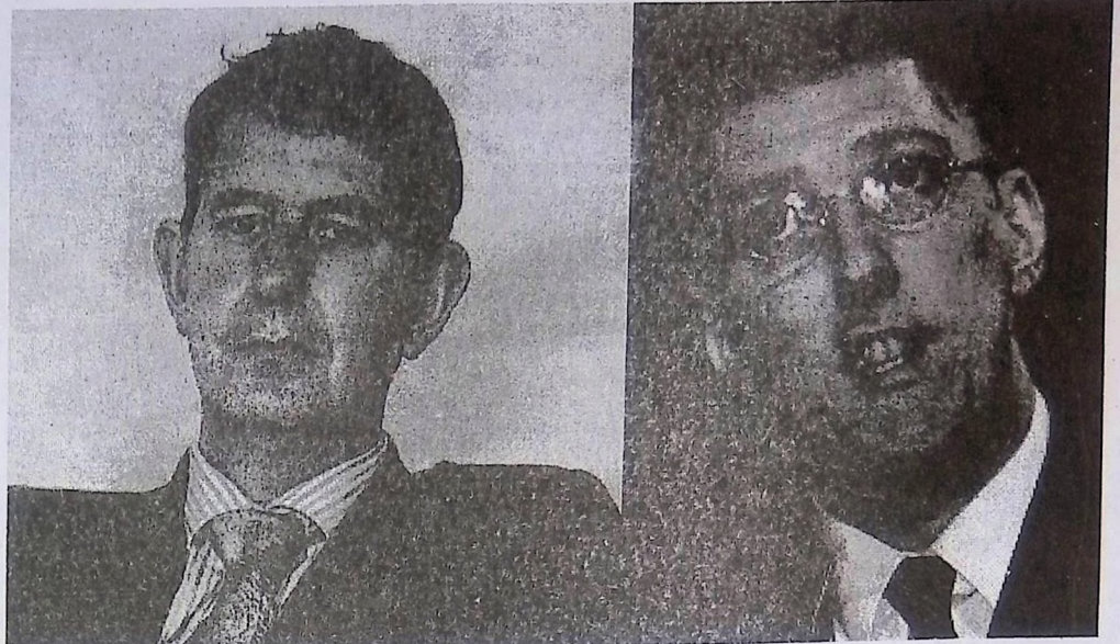
Wanted - Engaged in Criminal Activity

promised jobs and investment. That's become cutbacks and misery. But the wave of revolt coming on November 30 and beyond give us the chance to roll this agenda back.