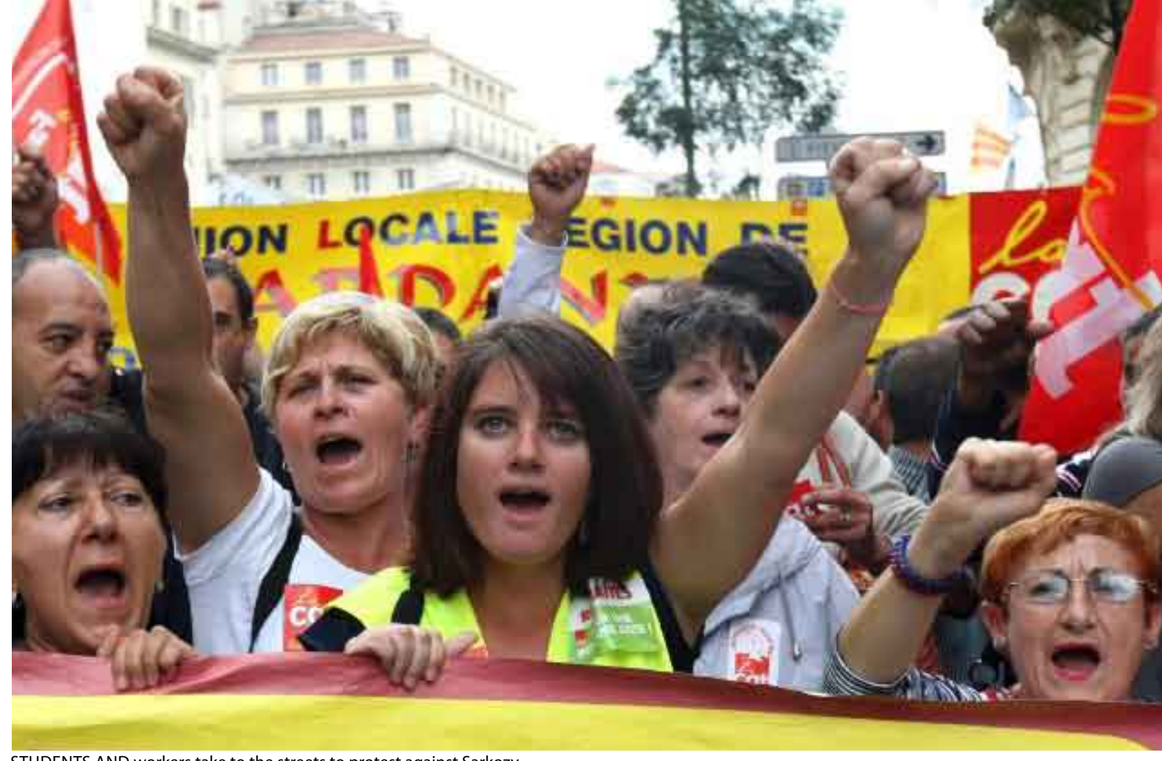
'Should it be €5 billion we cut or STUDENTS AND workers take to the streets to protest against Sarkozy

that would provide us with credit when necessary.