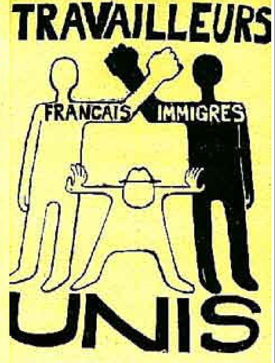
Posters from France 1968 calling for factory occupations and black and white unity against racism.

area a liberated police-free zone, building barricades throughout the area.