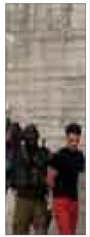
Palestinian arrested in Israeli swoop

This means that 60-70,000 Palestinians with papers naming their birthplace as the Gaza Strip who are living or working, with Israeli "permission",