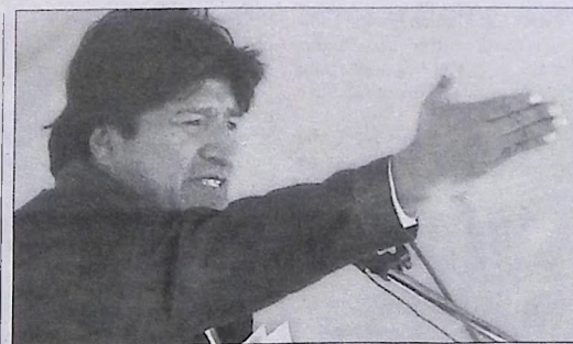
Evo Morales: elected President in late 2005,

Delegates from the wealthy eastern provinces walked out in late 2006, after unsuccessfully insisting that every individual article of the new constitution be approved