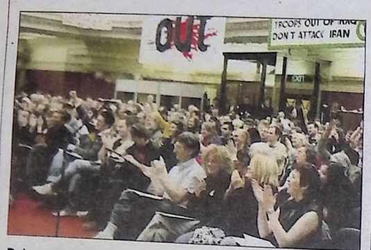
Delegates in London last month

On December 1st, at a conference organised by Stop The War Coalition in London, over 1100 delegates representing over 26 countries voted on the declaration below.