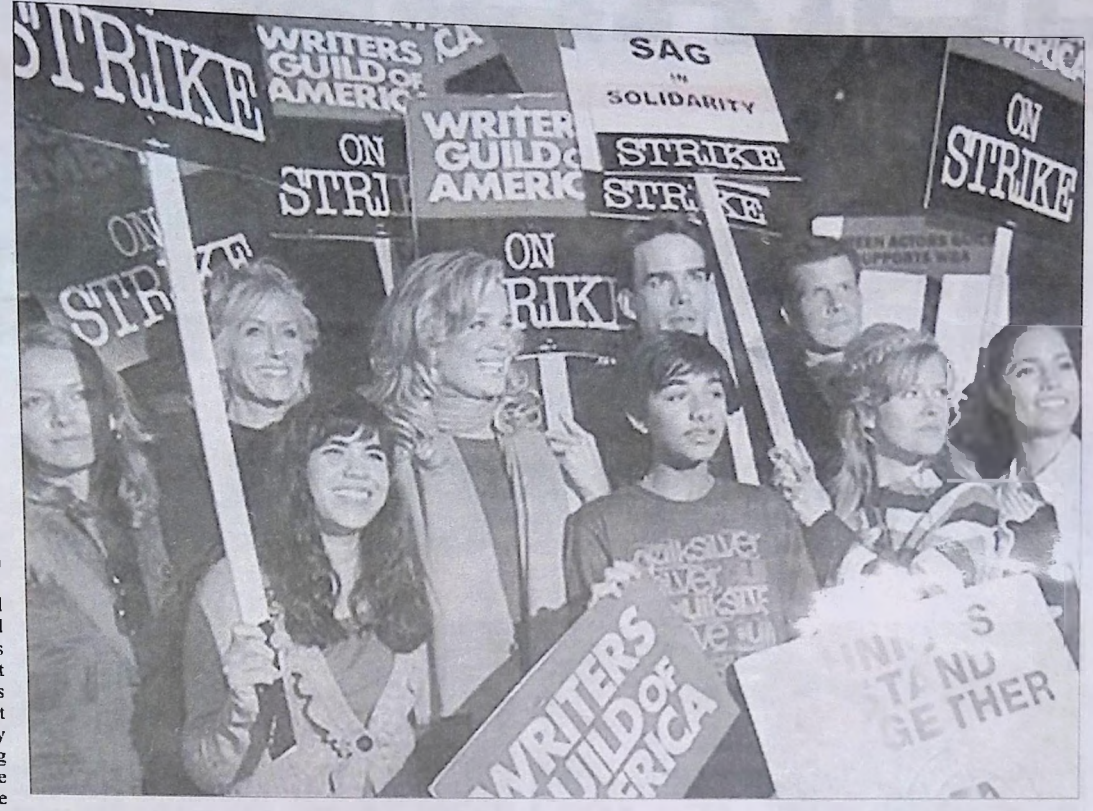
Actors from the set of TV series Ugly Betty join striking writers on the picket line