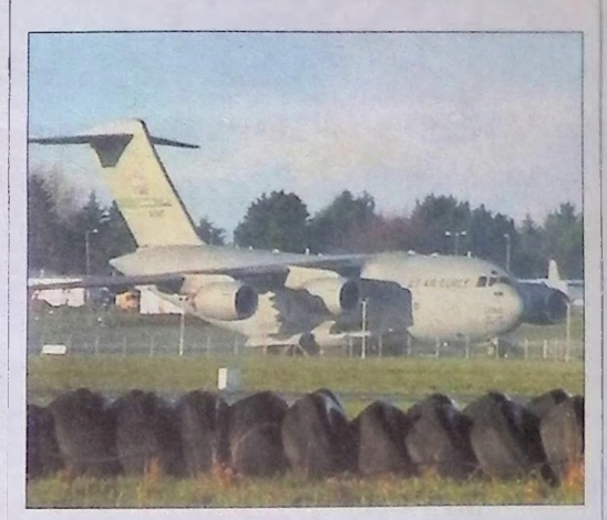
US Air Force plane at Shannon

SHORTLY BEFORE Christmas, the Irish Commission on Human Rights (ICHR) presented its report on the issue of so-called "extraordinary rendition" flights to the joint-Oireachtas committee on foreign affairs, in which it roundly condemned the Irish governments continued