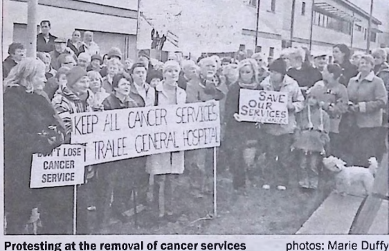
Protesting at the removal of cancer services

markable given that the protest took place on a Sunday two days before Christmas Day. The removal of cancer services means at least a two hour journey to Cork for Kerry people. This is a direct contradiction to the HSE's stated aim of providing for a com-