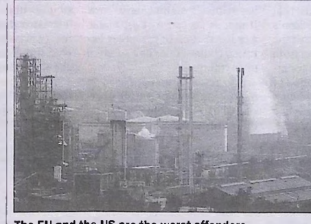
The EU and the US are the worst offenders

economic competitiveness. This is appalling hypocrisy. Developed