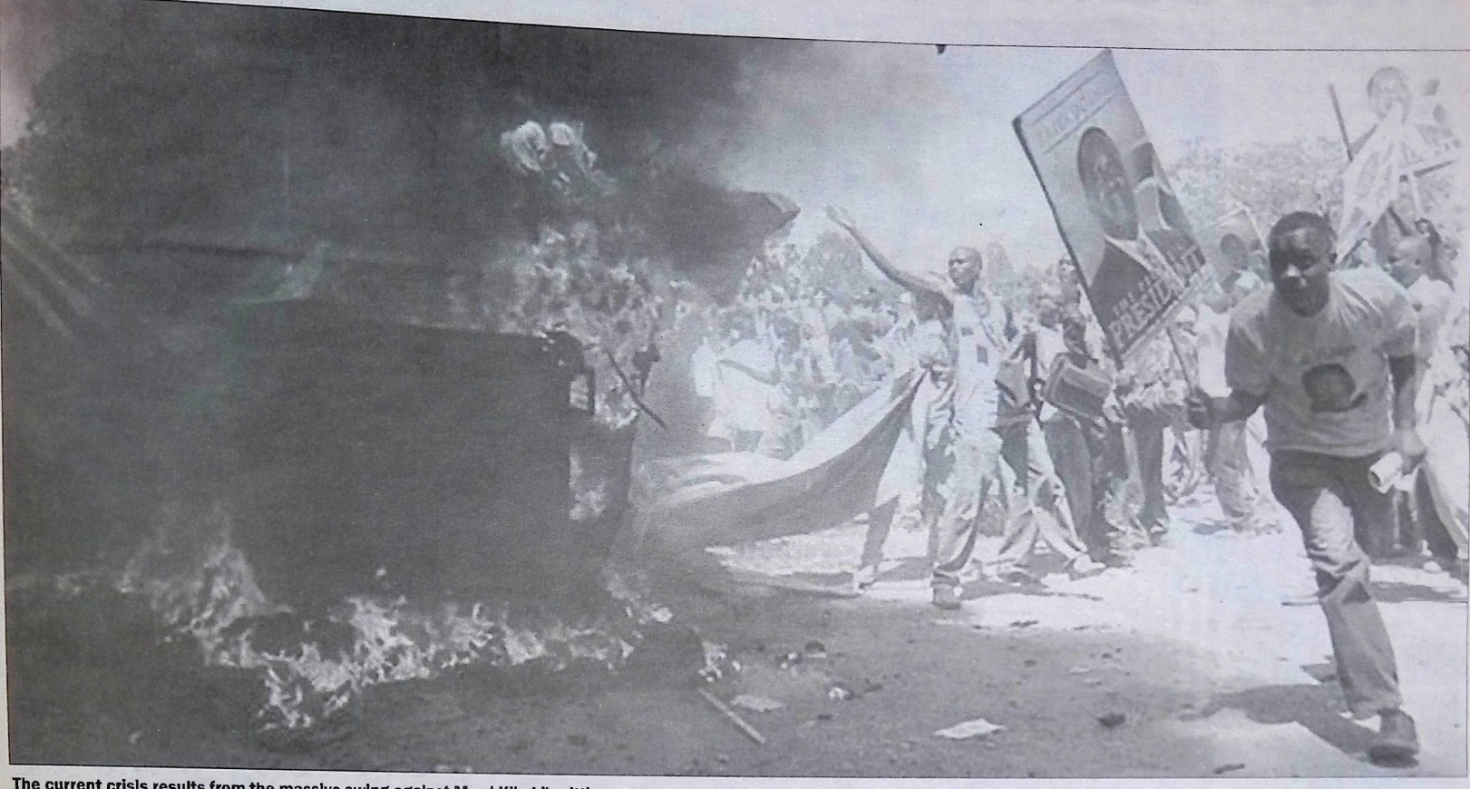
The current crisis results from the massive swing against Mwal Kibaki's sitting government