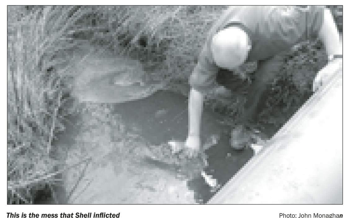
This is the mess that Shell inflicted

This process has transparently and consistently failed in its task, allowing works to proceed with complete disregard to 'conditions', and worse, rubber-stamping the breaches and facilitating the slow and steady degradation of the local