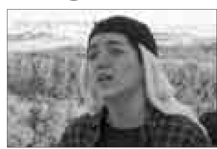
Questioning repressive laws and beliefs around gender and sex

As you are watching this clever film, it is chilling to think that the Bush administration has already pinpointed sites to bomb in Iran