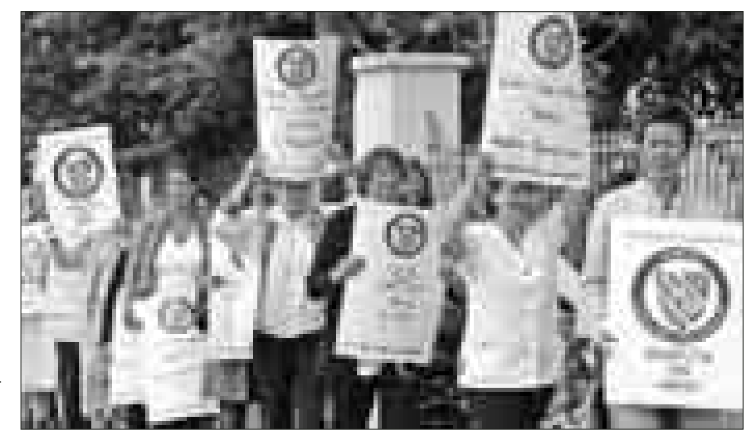
Nurses protest in September last year

There have, however, put a ban on all clerical, administrative