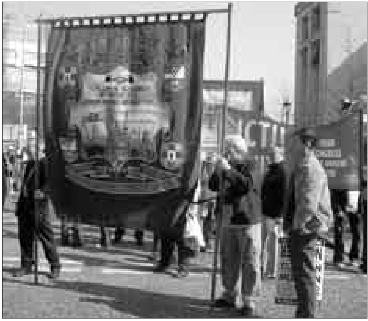
Demonstrating against water charges in Belfast recently