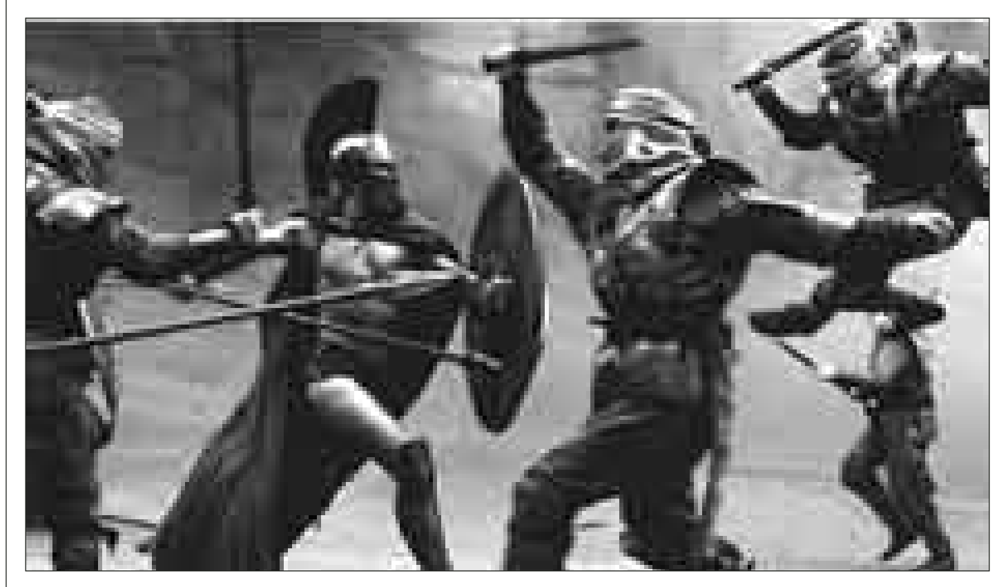
Rumble in Sparta