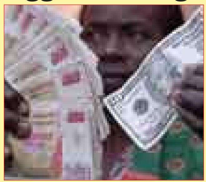
Inflation is running at 1,700 percent