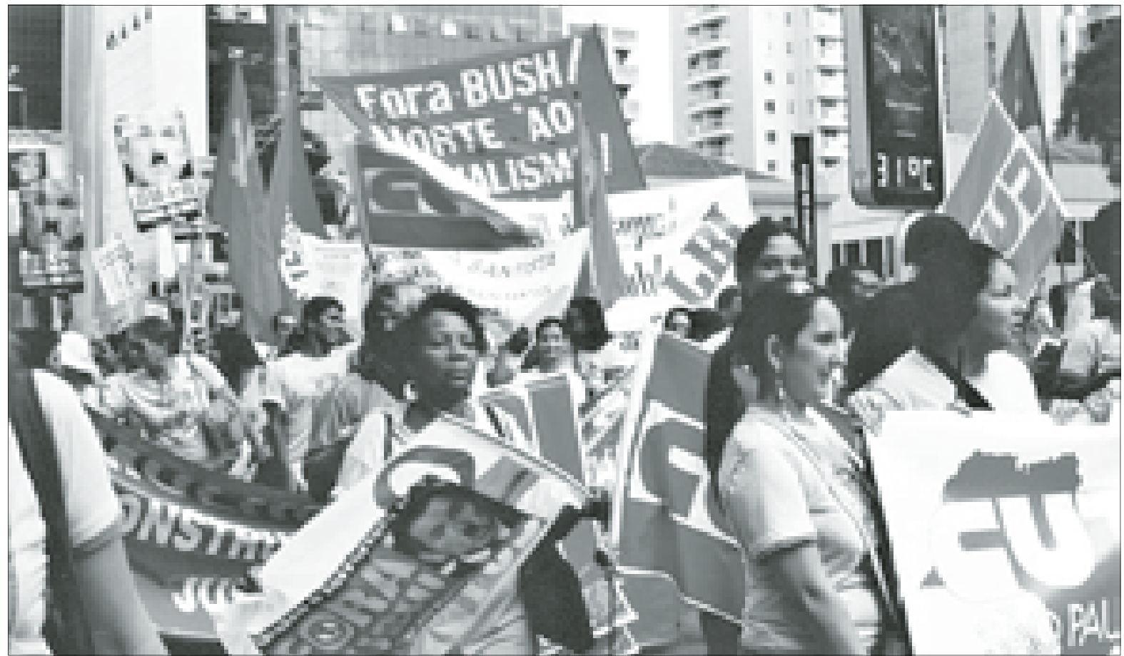
There were large protests against Bush's visit to Latin America in 18 out of 26 states in Brazil