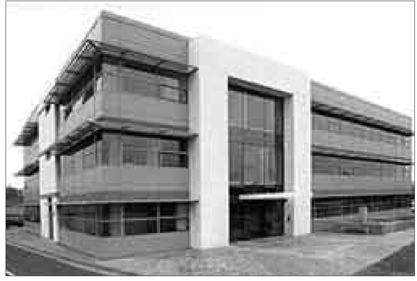
Cork Private Consultants' Clinic in Cork University Hospital