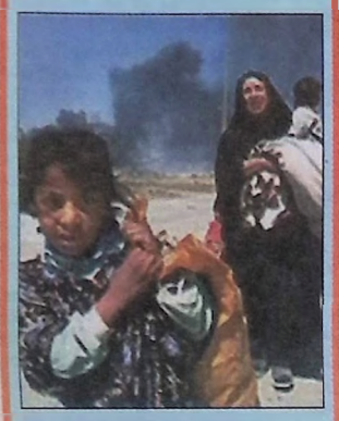
By Roger Cole (PANA) Pages 6&7