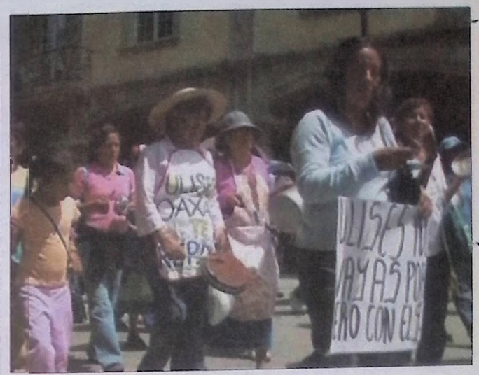
Fighting for their rights in Oaxaca