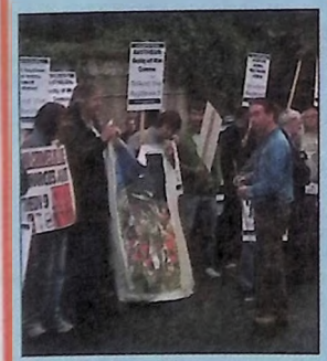
By Colm Bryce (Raytheon 9) Page 4

Plus: Pope joins chorus of Islamophobia, by Eamenn McCann, Page 9