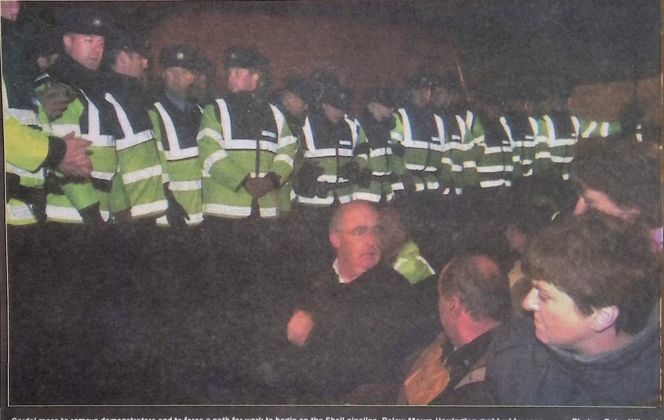
Gardal mass to remove demonstrators and to force a path for work to begin on the Shell pipeline. Be