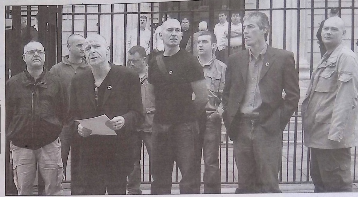
on Nine outside the court in August