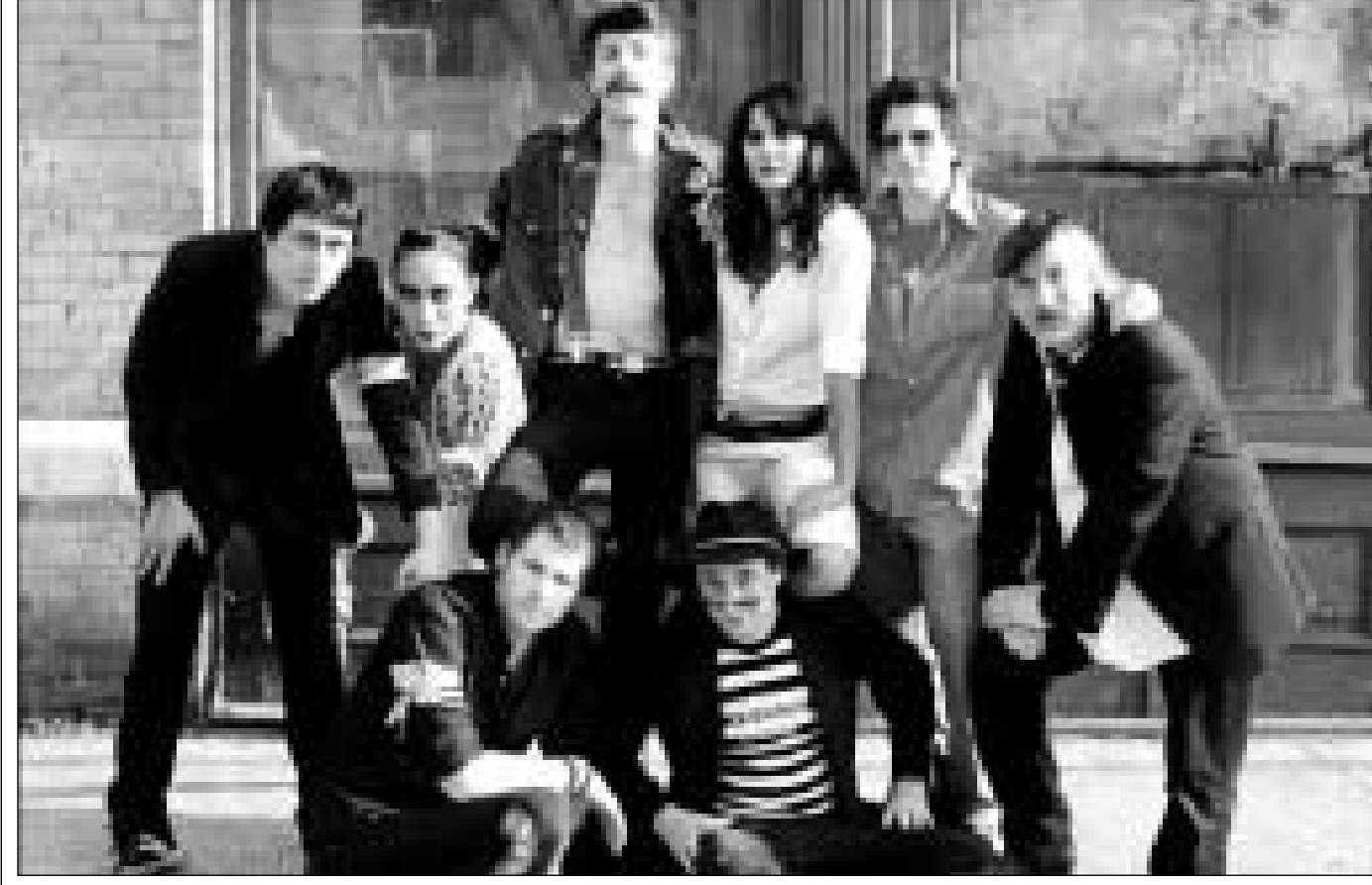
Gogol Bordello: "The Clash having a fight with The Pogues in Eastern Europe"