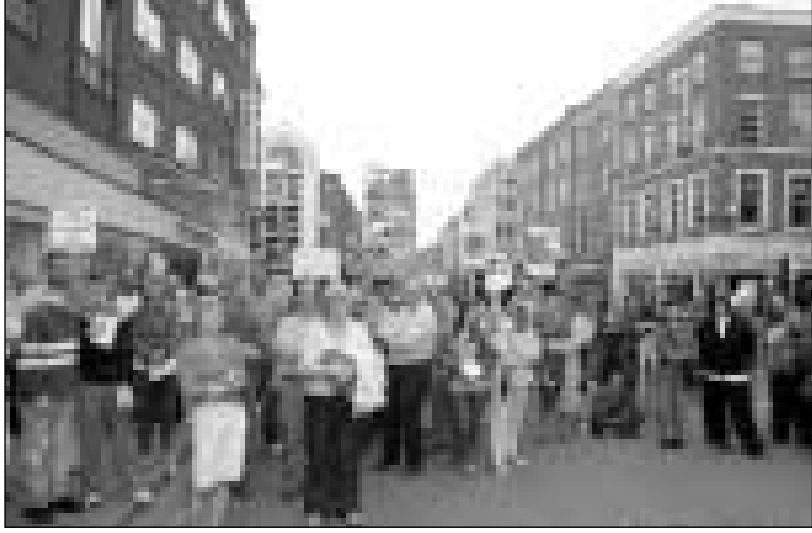
Protesting Israeli assaults on Lebanon in Limerick

The onslaught of Israel/US savagery in Lebanon has seen over 50 peo-