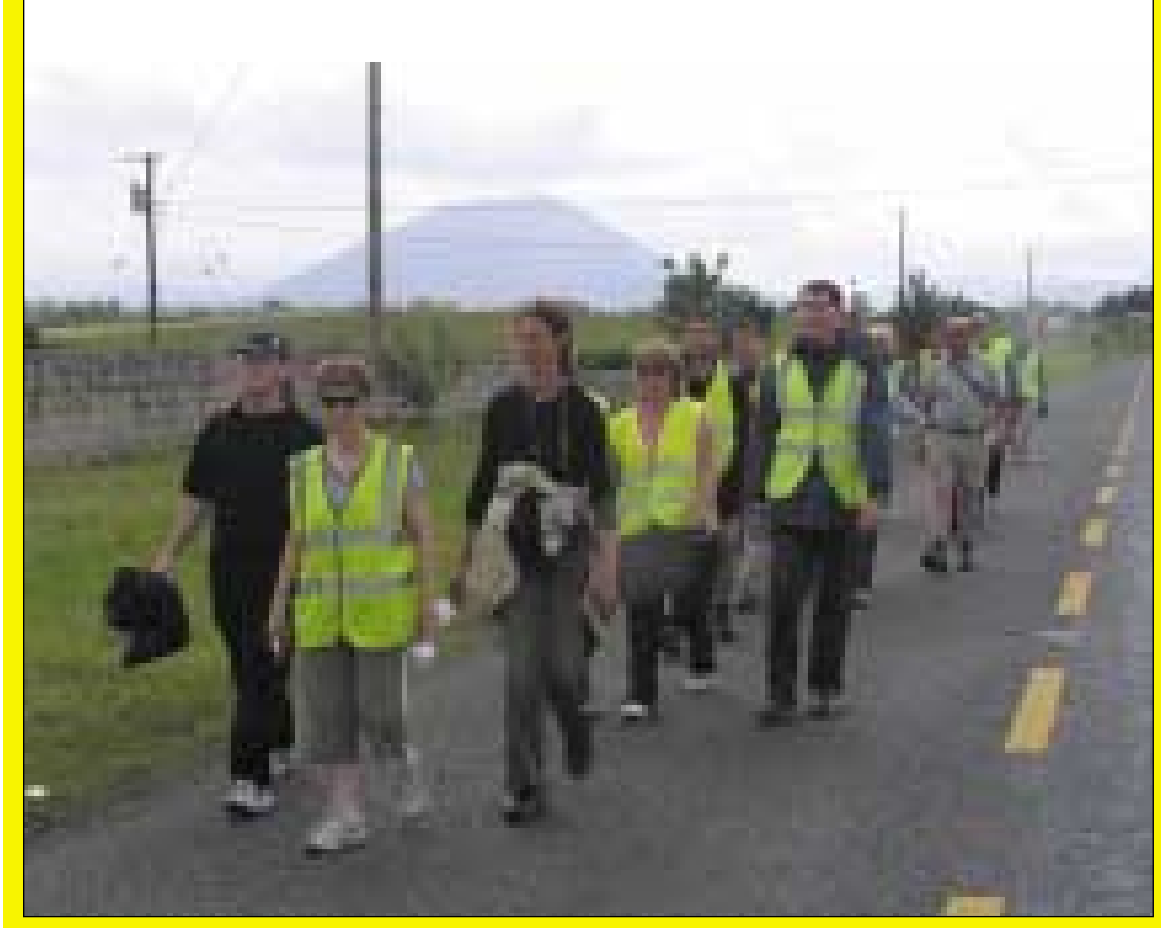
Members of the Shell To Sea Campaign from Mayo take the long walk from Bellinaboy to Dublin. They will arrive in Dublin around midday on Saturday 12th August where they will be joined and welcomed by bundreds of supporters

In the case of our natural resources the government is dictated to by the oil companies. Dá bhrí