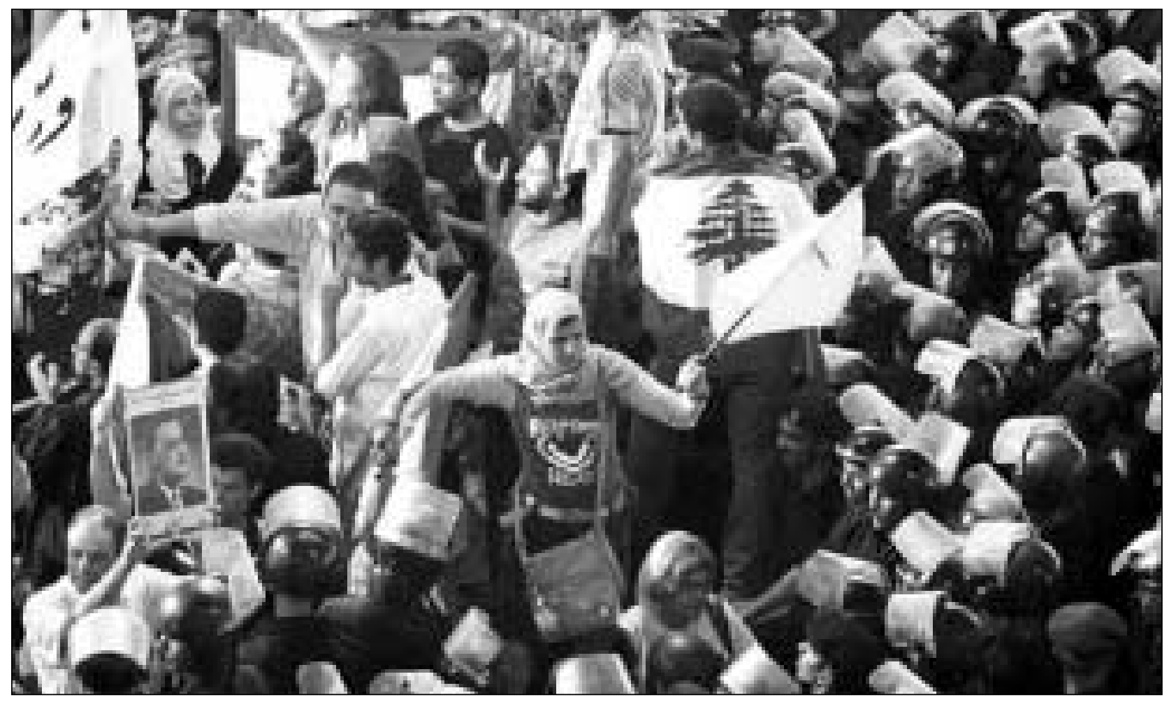
Thousands of protesters took over Talat Harb Square in central Cairo, Egypt, last week to demonstrate against Israel 's assault on Lebanon and the failure of the Arab regimes to oppose it.