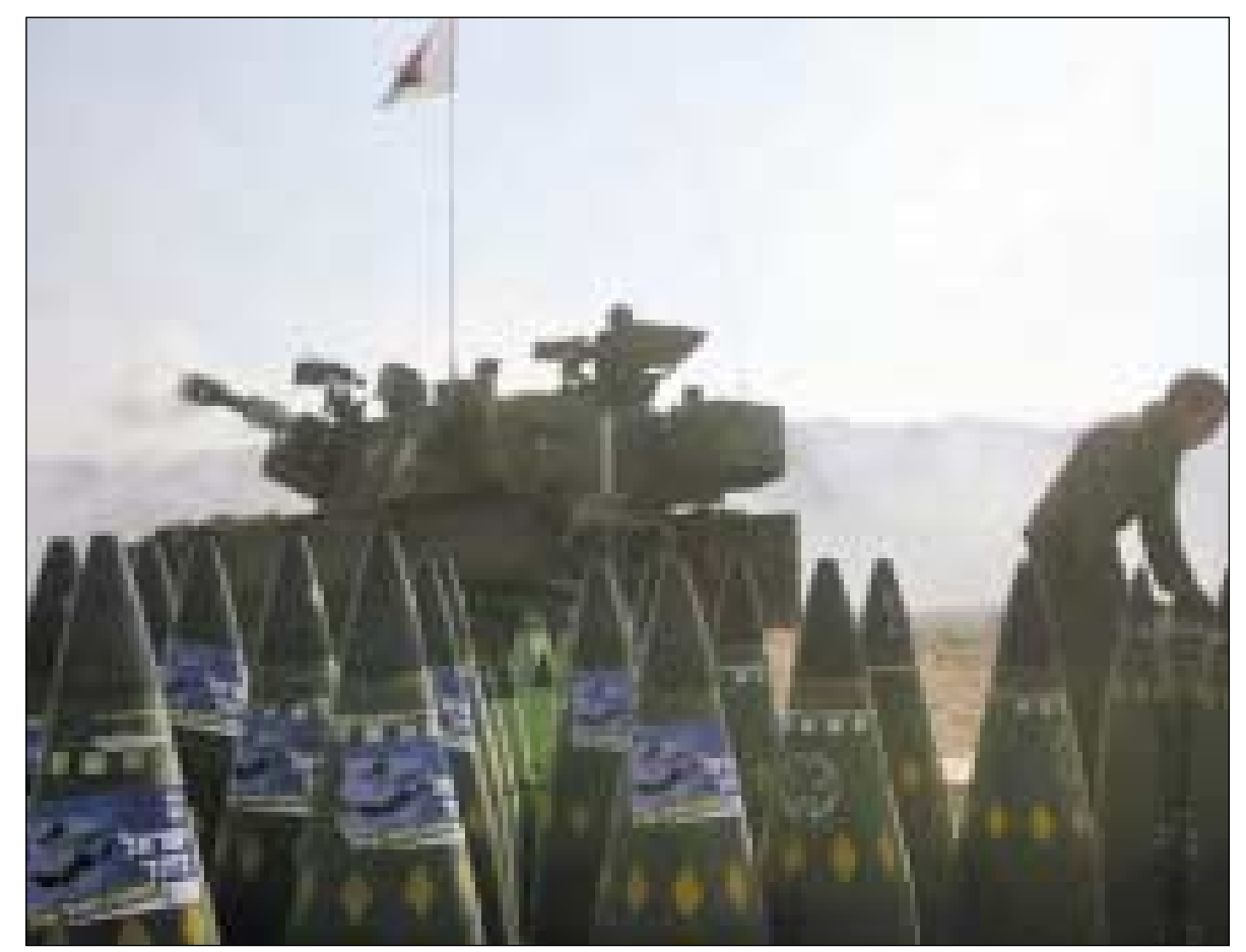
Murderous attacks: Israeli artillery units fire shells towards Lebanon constantly.

Acting alone Israel could not achieve these aims. However, its war coincides with the Bush administra-