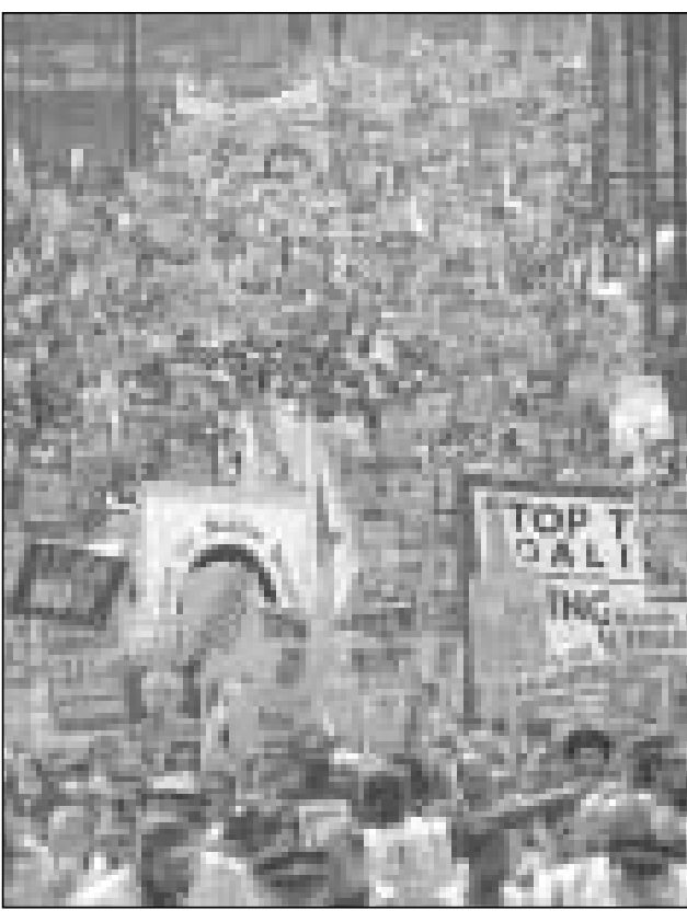
Part of the London demonstration

"Only the peace movement can destroy the power behind these wars. That's why we must demonstrate in Manchester on 23 September outside the Labour Party conference - and demand an end to this government steeped in blood."