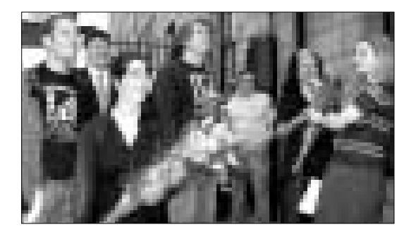
Courage rewarded: Pitstop Ploughshares Not Guilty

The legal process has its biases, not least in the power of the judges, who are drawn overwhelmingly from the most privileged social class. Nevertheless, in Ireland and the UK it has one great strength: the jury system. The right to be tried before twelve randomly selected people means that wealth and power does not always prevail in