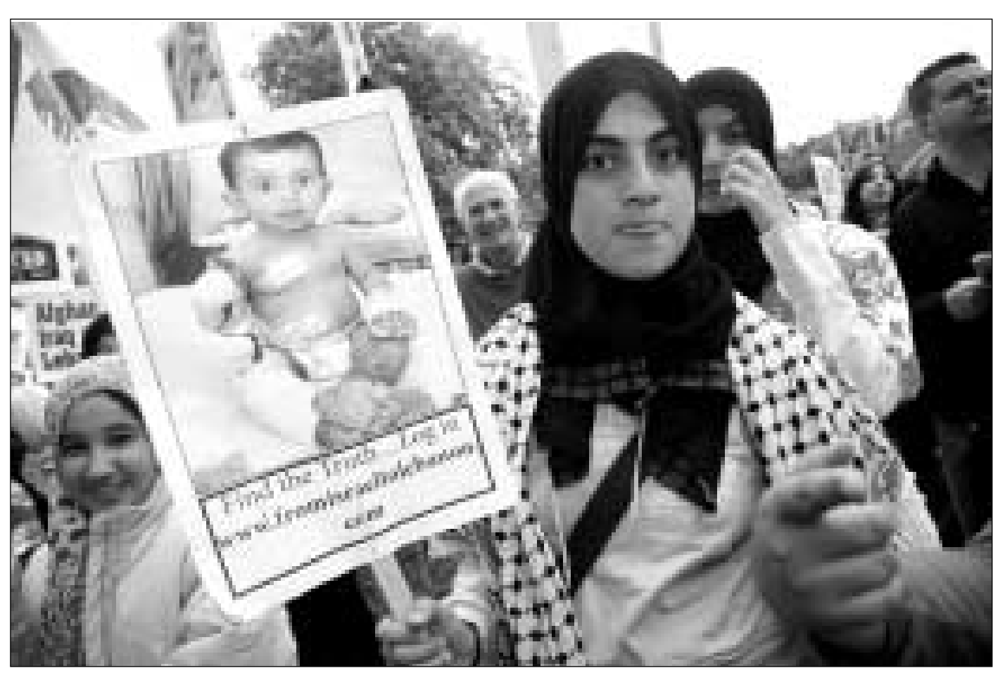
Up to 3,000 people demonstrated in Dublin on 29 July against the assault on Lebanon