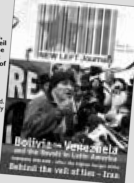
New Left Journal is available at €3 plus postage from Bookmarx, PO Box 1648, Dublin 8

In this way, we hope that New Left Journal may become a genuine forum of the anti-war movement, of anti-racism and the battles against the neoliberal agenda in