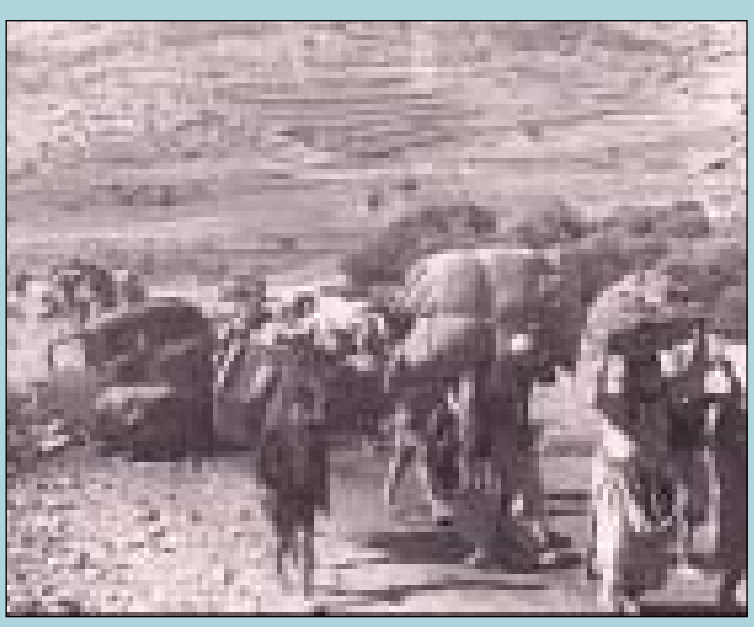
Palestinians fleeing the massacre at Deir Yassin in 1948