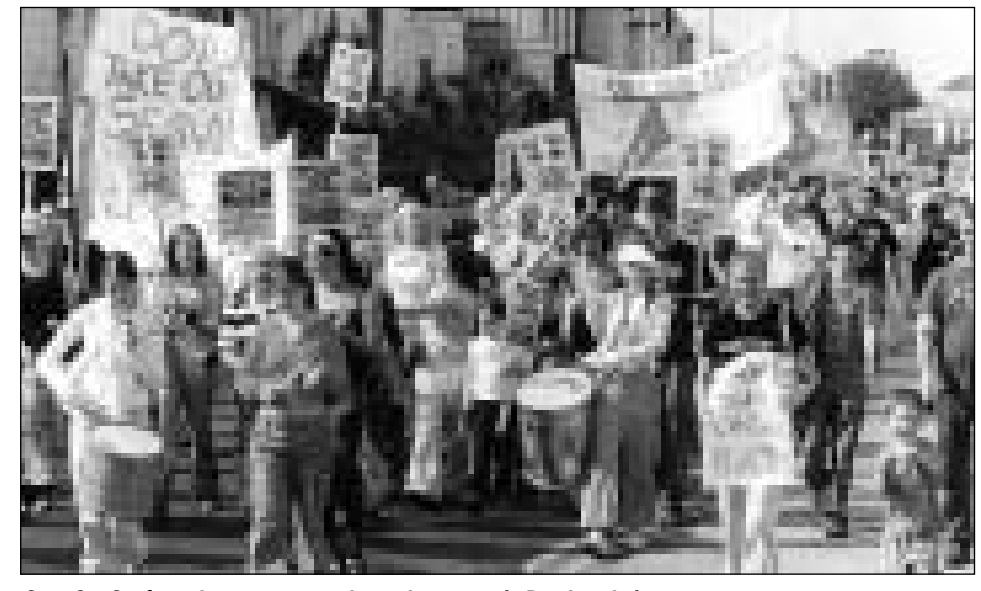
Save Our Seafront demonstrators take to the streets in Dun Laoghaire

It has also been prompted by the plans of the four Dublin County Council's to establish a Dublin Regional Authority to draw up a "master plan" for the development of the Bay.