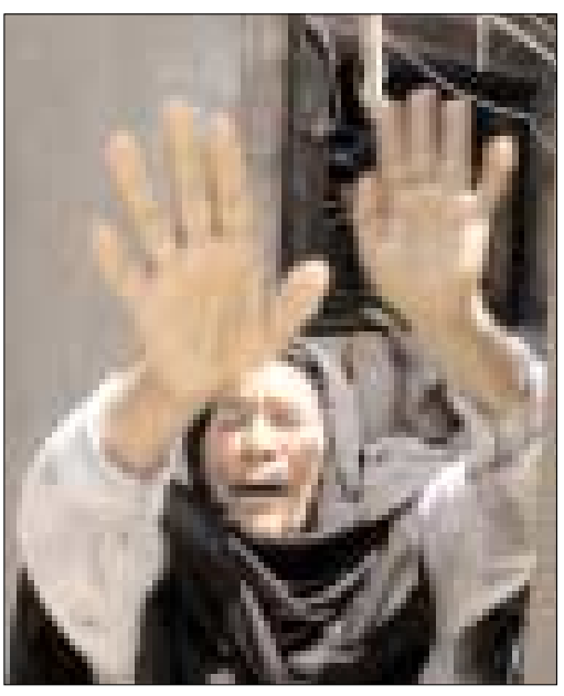
Gaza woman mourns death of child

Israel and western governments have exposed the utter hypocrisy of all their talk about wanting to bring democracy to the Middle East in their treatment of the