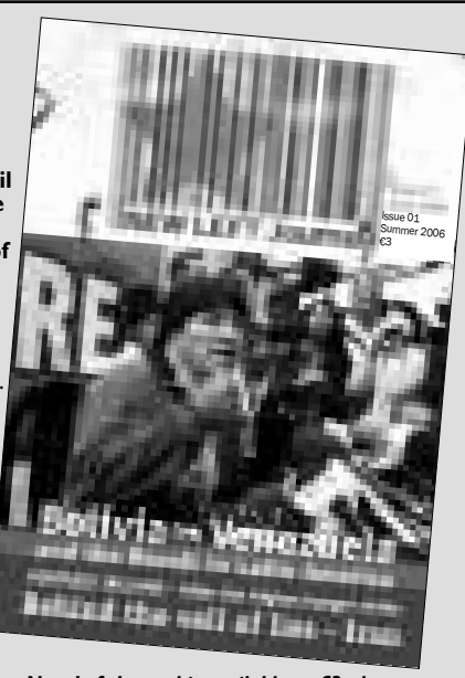
New Left Journal is available at €3 plus postage from Bookmarx, PO Box 1648, Dublin 8

In this way, we hope that New Left Journal may become a genuine forum of the anti-war movement, of anti-racism and the battles against the neoliberal agenda in