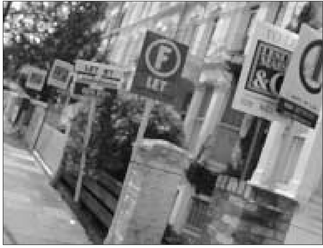
Average house prices have risen €30,000 a year over the past decade

Numerous schemes based on the public-private partnership (PPP) model have been launched since then to provide social and affordable housing such as the Part 5 of the Planning Act 2000 where 40,000 affordable homes were promised, but only 2,000