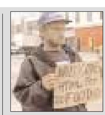
The misery of homelessness

She held her finger out, Calling me home to rest, Death will be my final rest, I fear no death, for I've never ived."