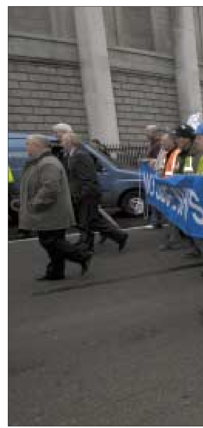
Fighting outsourcing: Irish Ferries workers and their supporters on the street

Almost 30 pages of requirements for different sectors are set out which make it easier to sack public servants and more difficult for them to get promoted. Contracts are to