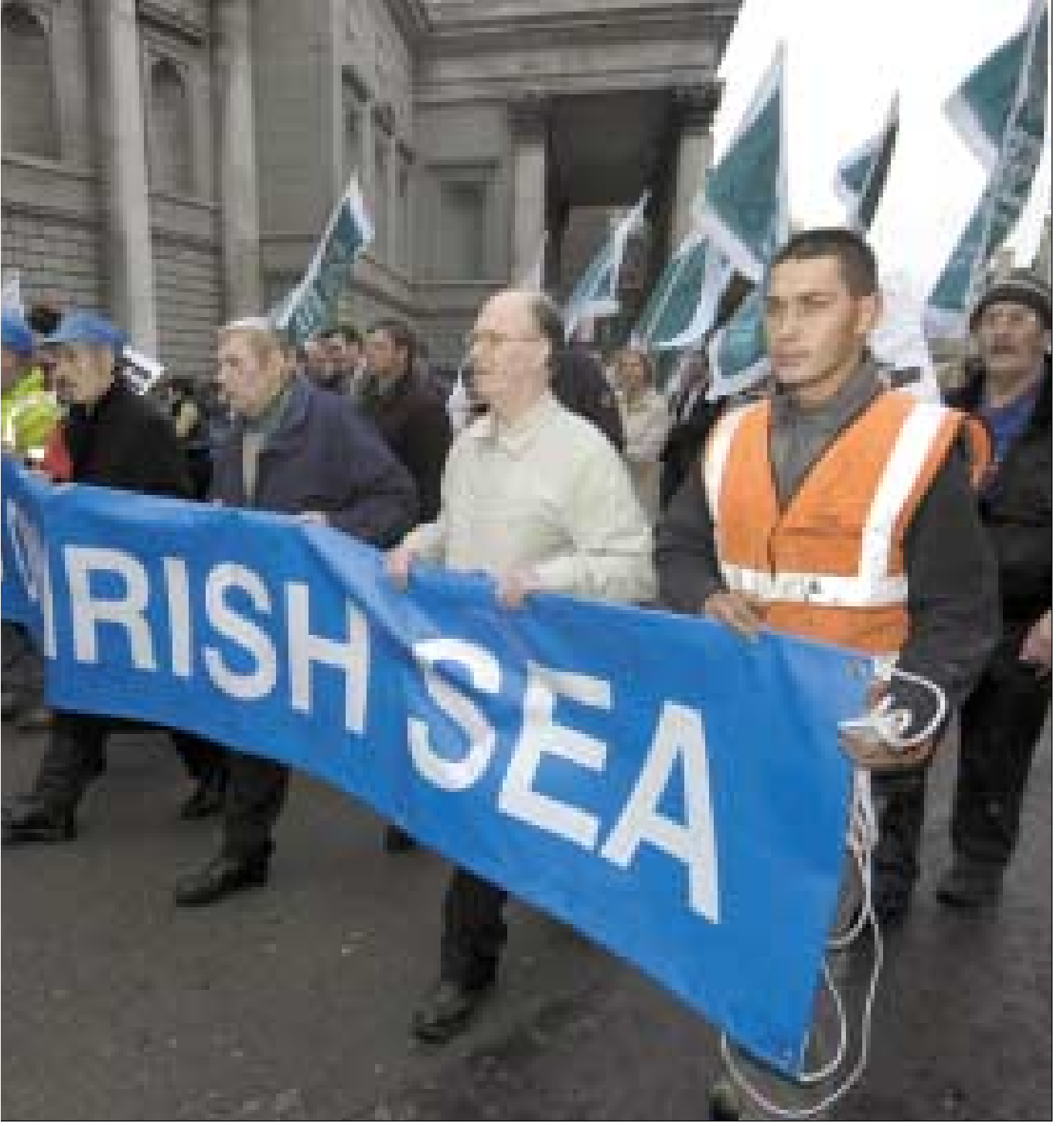
ts last winter