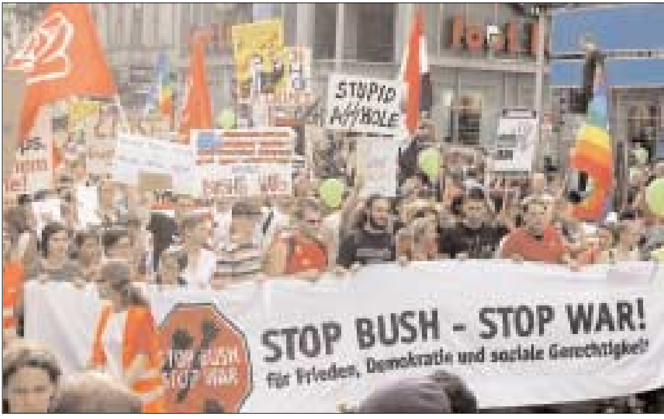
Demonstrating in Vienna