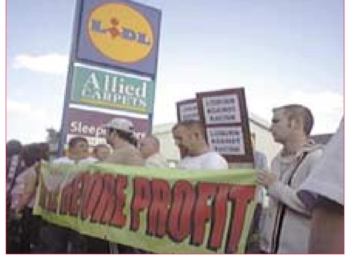
Anti Racist vigil organised in Lisburn in response to racist attacks on immigrants in the area.