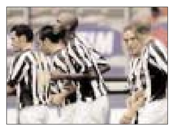
Juventus: Allegations of match fixing

Italian football has been rocked by a major scandal involving the top clubs, football officials and referees. Four of the top football clubs, Juventus, AC Milan, Fiorentina and Lazio have appeared before a sports tribunal charged with fixing matches.