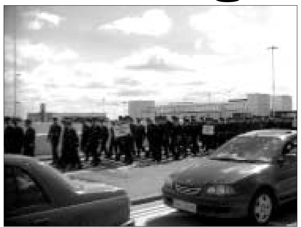
Flashback: Aer Lingus workers take action in 2002

The government's only response to the slow down in the Celtic Tiger is to speed up the race to the bottom. It believes that Ireland needs to emulate the US model in every aspect in order to attract greater investment in services.