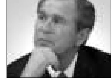
Bush: preparing to back Israel

This is why Condoleezza Rice is pushing $75 million to fund Iranian opposition groups to try to achieve regime change" from within