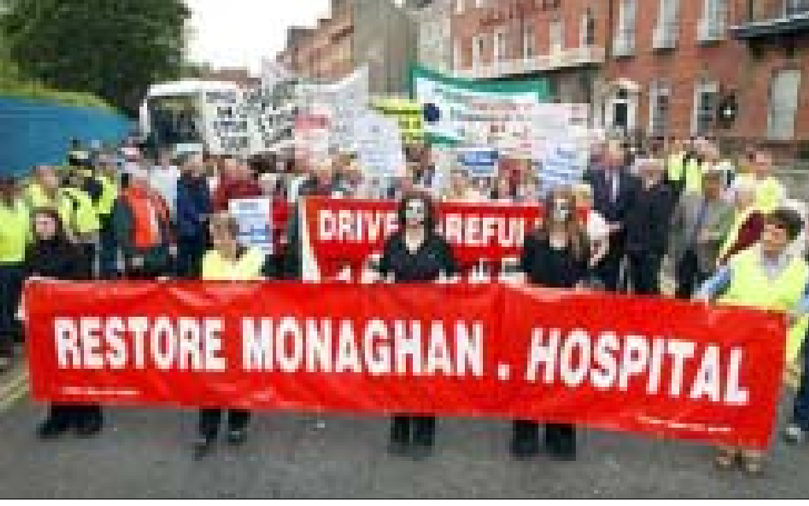
A vigorous campaign has been sustained demanding the restoration of services to Monaghan Hospital

By not replacing staff and failing to invest in the fabric of the building at Monaghan General Hospital and by refusing to provide the necessary resources the Health Board was able to call in outside agencies, who declared services unsustainable. They started by removing paediatrics and as a result mothers lost confidence in the maternity unit there, which reduced annual births from 700-plus to just fewer than 400. They then reduced the number of obstetricians to one and called in the insurance company to deem the unit unsafe. They closed it down "temporarily" but it was never to return. They then removed gynaecology and orthopaedics,