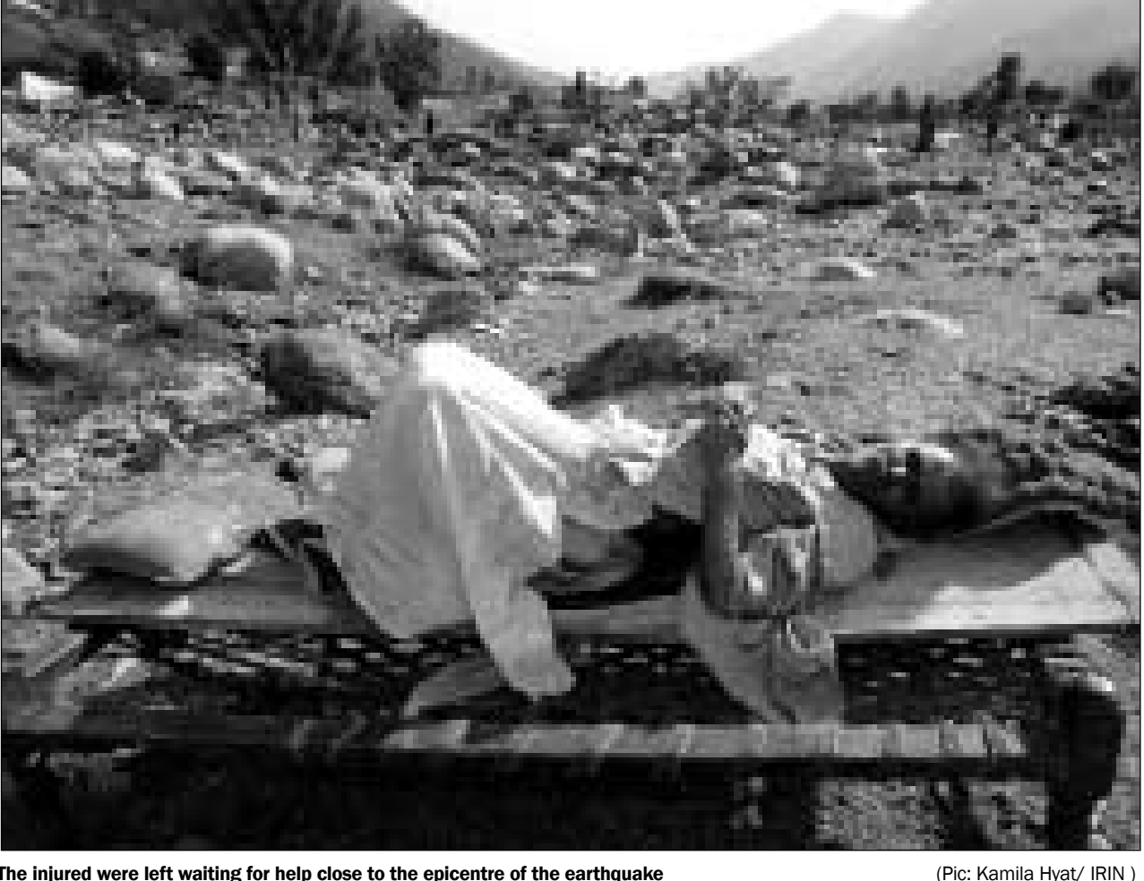
The injured were left waiting for help close to the epicentre of the earthquake