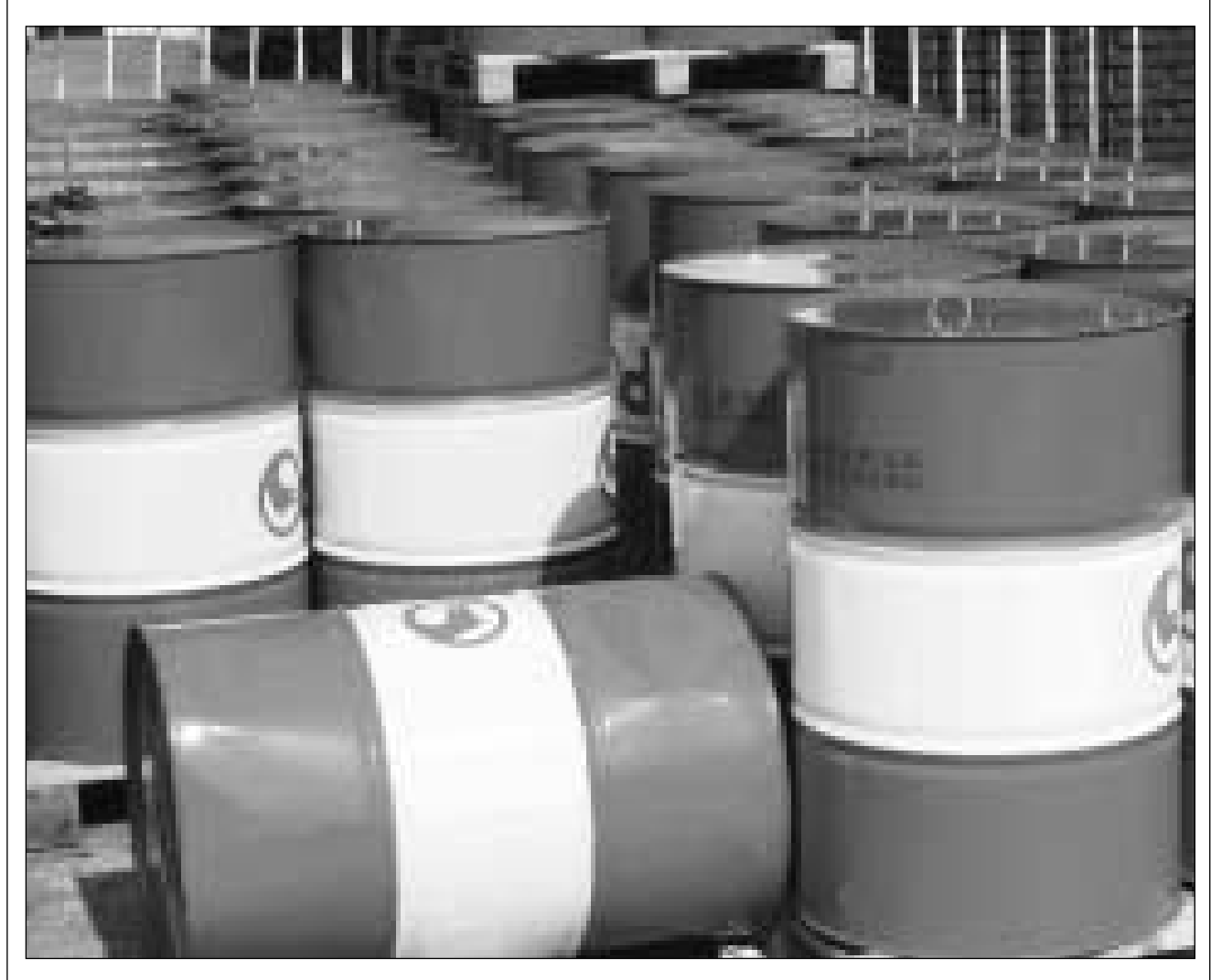
Creaking production and refinery system will be pushed beyond breaking point