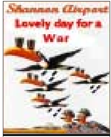
Artists, Poets & Musicians against the use of Shannon Airport by US troops en route to Iraq – present WEDNESDAY 7<sup>TH</sup> SEPTEMBER

Belfast Fundraiser: Art Exhibition and Classical Music Wed 7th Sept.