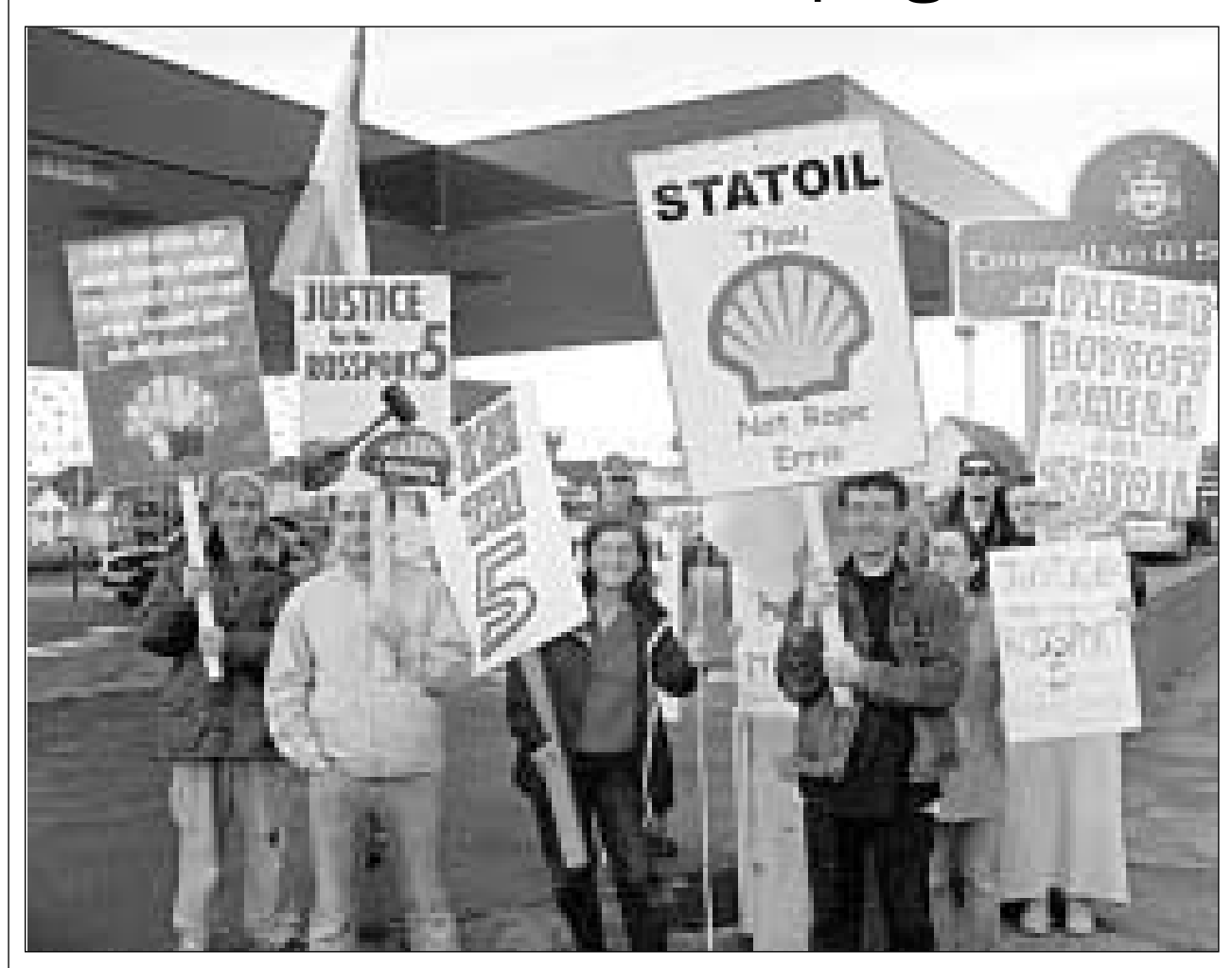
Galway Shell to Sea protestors picket a garage

Although the Rossport 5 are still ruthlessly imprisoned the campaign for their release has certainly not been confined.