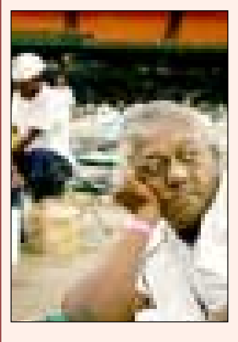
By Kieran Allen

Bush's neoliberalism causes chaos in New Orleans