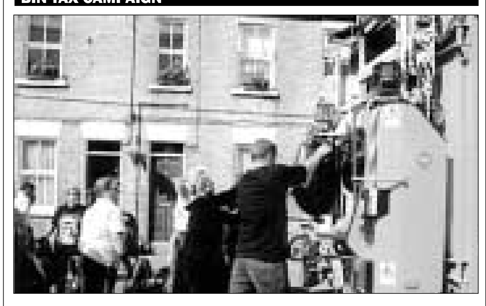
Blackrock residents respond to non-collection by throwing their rubbish in the back of the truck