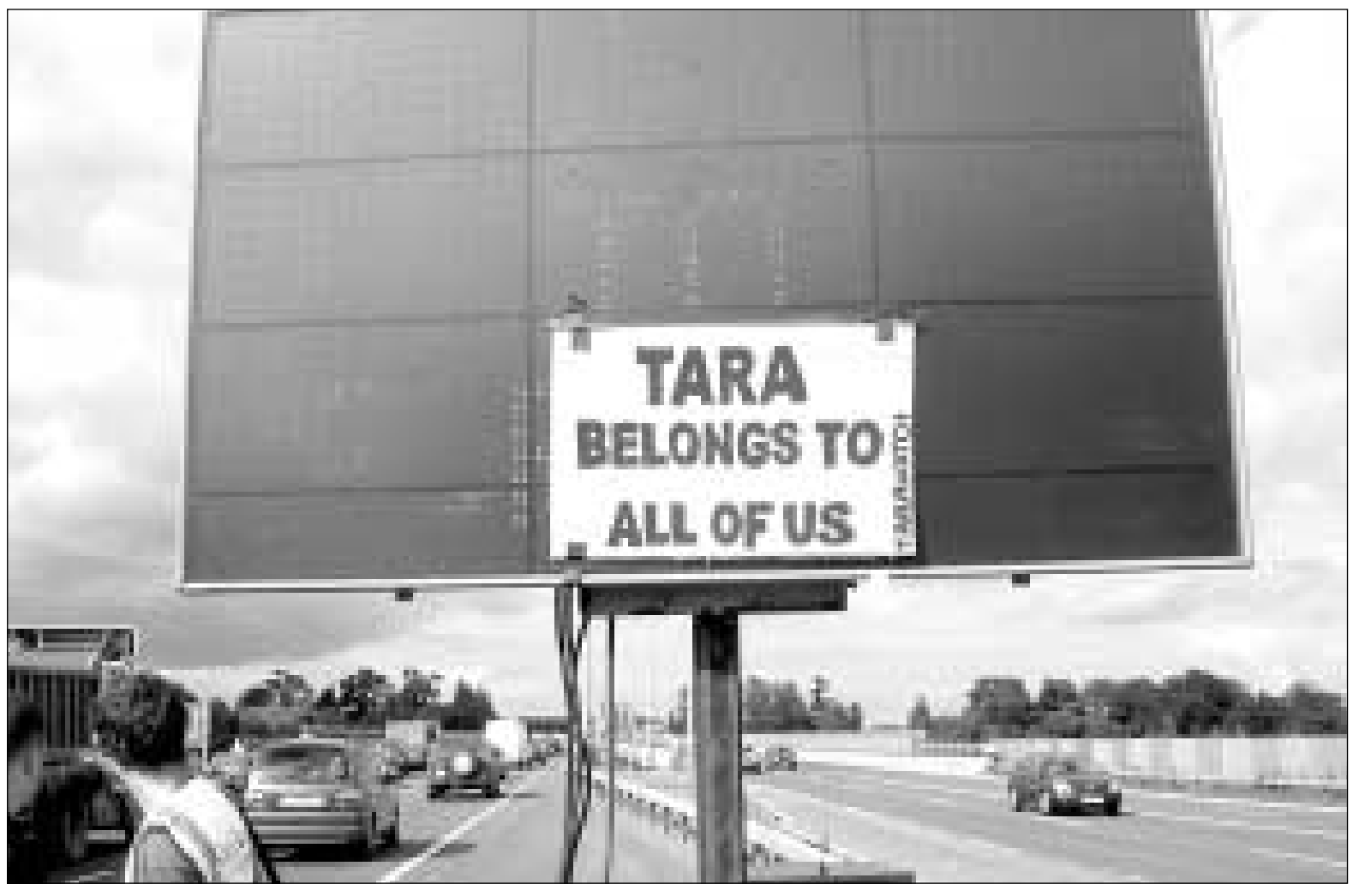
Protest on the M50

A new campaigning group, 'TaraWatch', has been formed to resist government plans to route a major motorway through the Tara Valley.