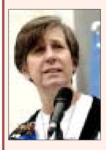
By Virginia Rodino. United for Peace and Justice, United States