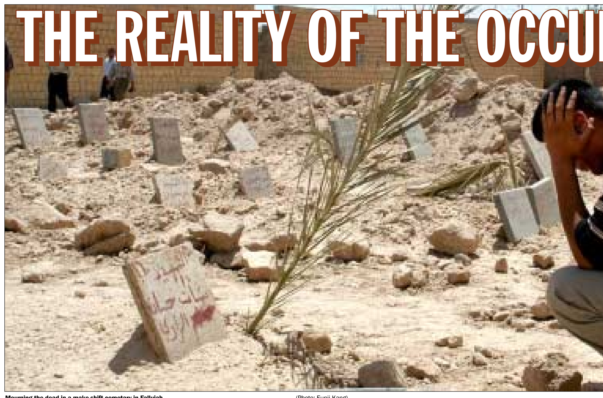
Mourning the dead in a make-shift cemetary in Fallujah