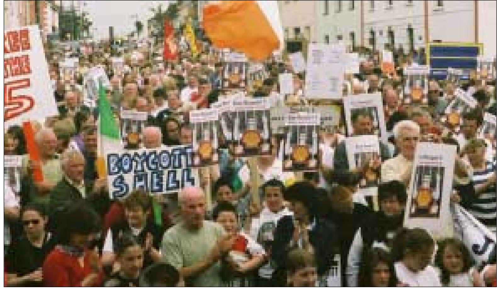
Belmullet came to a standstill as 3,000 protested in July