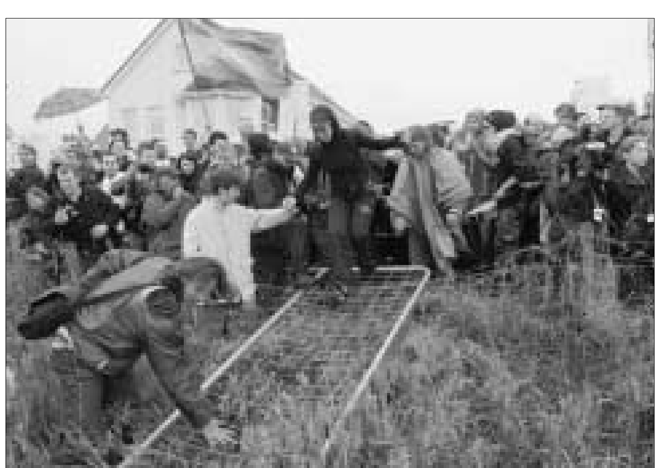
Protesters advance towards the fence that surrounded the G8 summit

No record of the experience of the G8 protests would be complete without the tale of the Niddirie campsite.