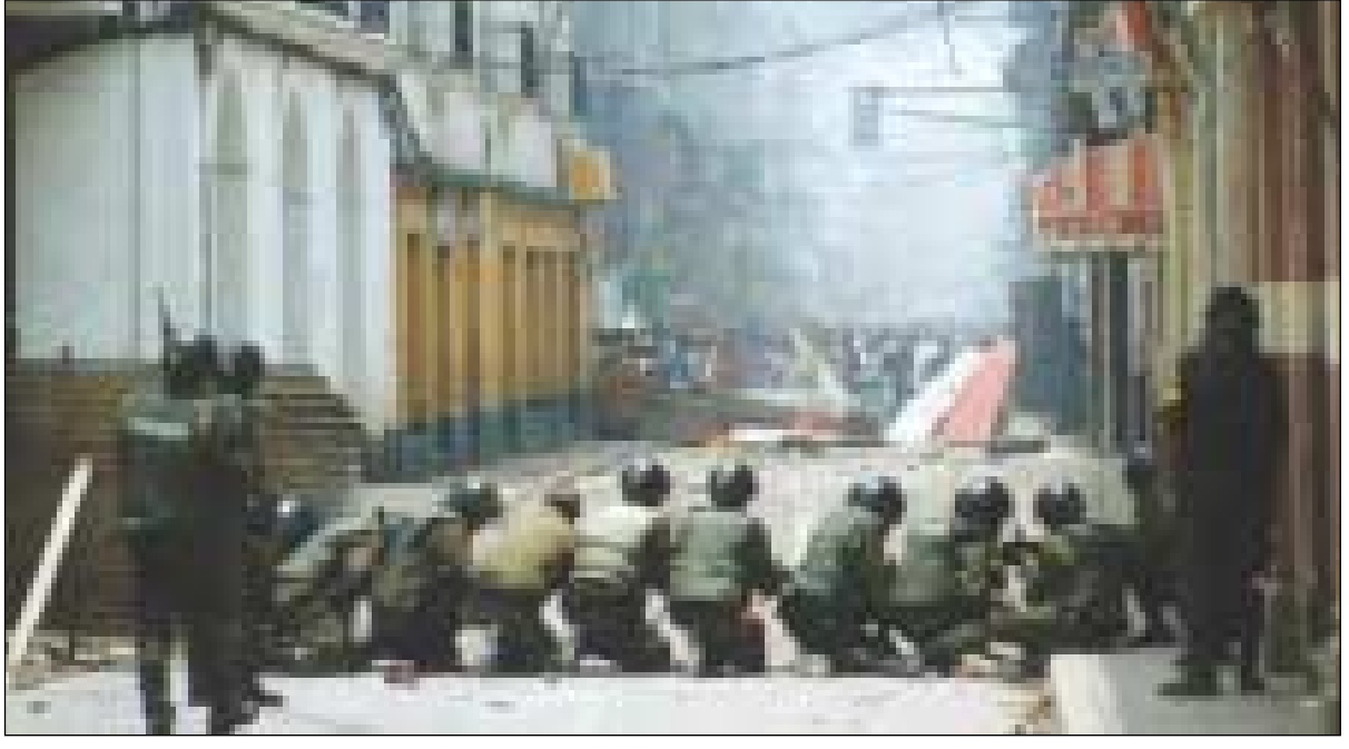
Confrontation in Conchabamba

Even the poorest and most isolated indigenous Aymara and Quechua campesinos (poor farmers) understand