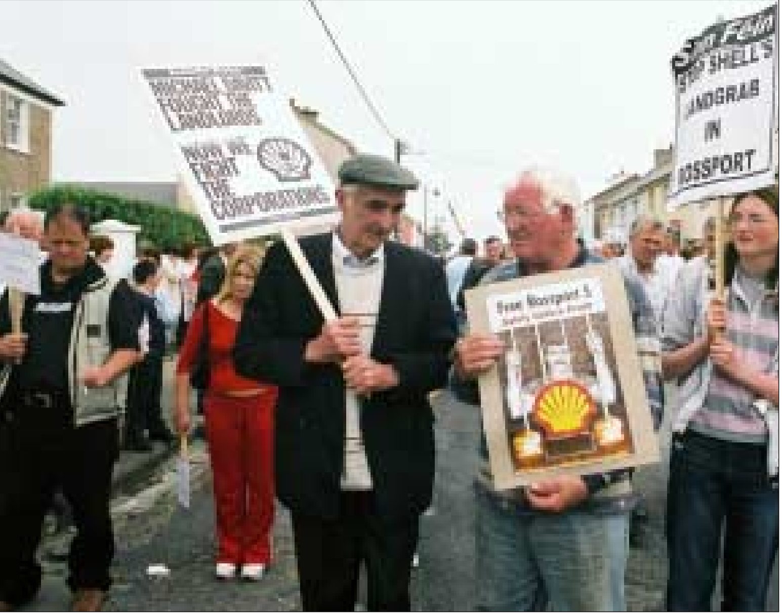
Part of a Shell To Sea protest in Belmullet in July

More generally, he abolished the requirement that the state have a 50 percent stake in any commercial project and that royalties be received. He also introduced a facility whereby exploration expenses