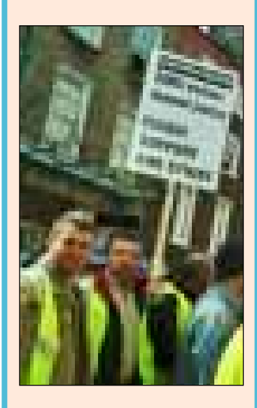
Reports on Bin Tax, Gama workers, asylum seekers protests