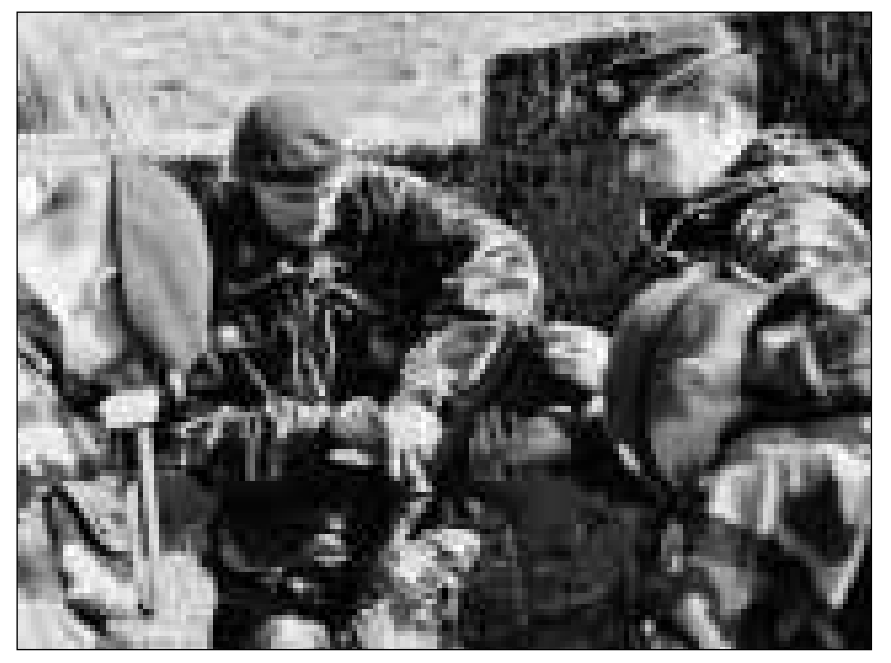
Irish troops: Sudan next posting?

The UN allowed Belgium to arm the rebels and eventually declared Lumumba's government illegitimate allowing Joseph