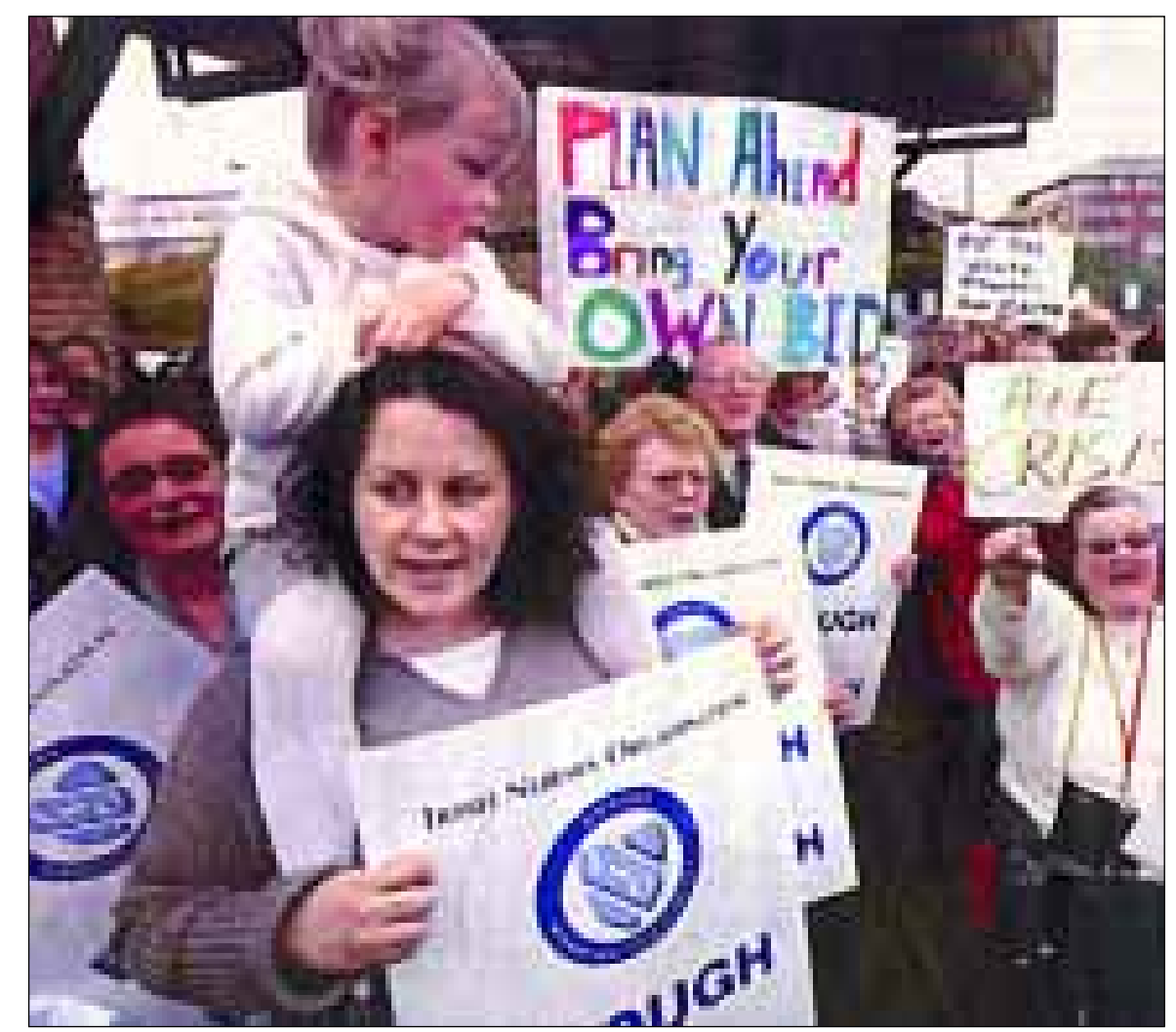
Nurses protest at the Tallaght hospital

Harney's "Ten-point-plan" for A&E is in tatters. The promised home care packages and high dependency and "step-down" nursing home beds have been slow to appear. Queue-skipping, private "Minor Injury Units" have been roundly condemned as unfair