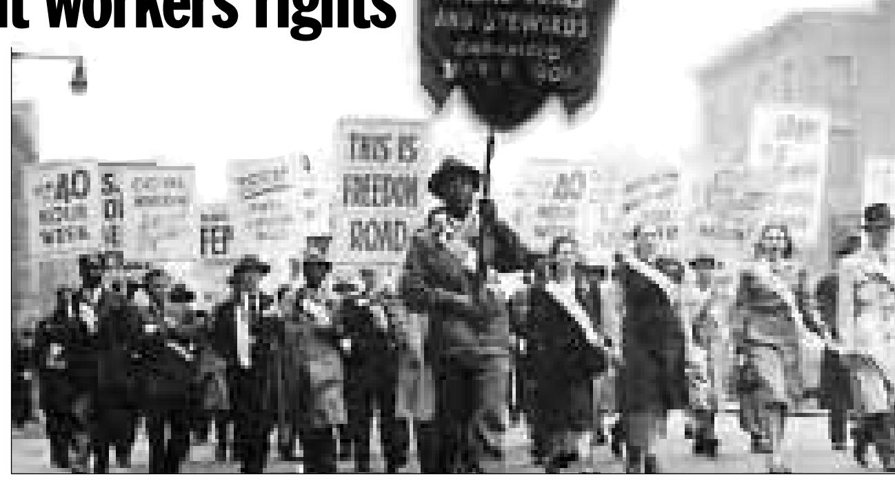
Section of 1947 New York City May Day parade.

Called by the Dublin Council of Trade Unions