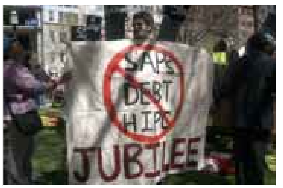
Washington, DC, April 15—Leading advocates of poor country debt cancellation gathered in a rally outside the G-7 Finance Ministers meeting to call for full debt cancellation for impoverished nations without harmful conditions. The event highlighted the message that most of the debt has already been paid. Between 1970 and 2002, Africa received about $540 billion in loans and has already paid back over $550 billion to wealthy creditors such as the G7 countries, the World Bank and the IMF. But interest charges mean Africa's debt stands at nearly $300 billion! With the G7, the IMF, and the World Bank in charge of global debt policy, there is no escape from this debt trap. Participants called for building a better world on a foundation of hope and human security. An essential first step in that process will be the cancellation of 100% of foreign debt for all countries in crisis, without harmful economic conditions.

The Irish Government recently reneged on its promise to reach the 0.7% target. That is disgraceful. Hans Zomer, director of Dochas