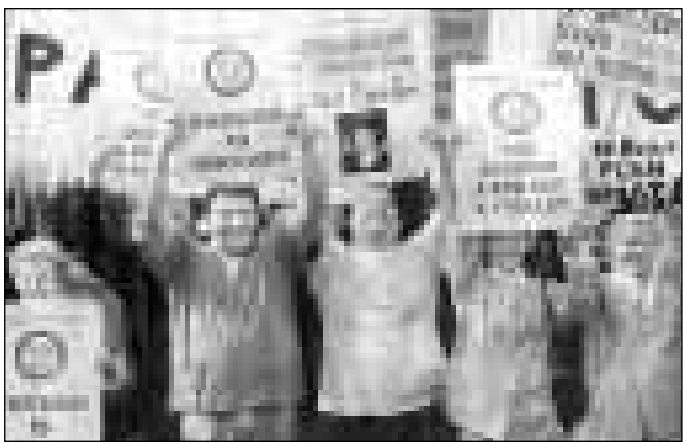
INO protests brought staff, Patients Together and other supporters at the Mater Hospital (top) and St Vincents

Socialist Worker also spoke to those at the protest at St Vincent's Hospital.