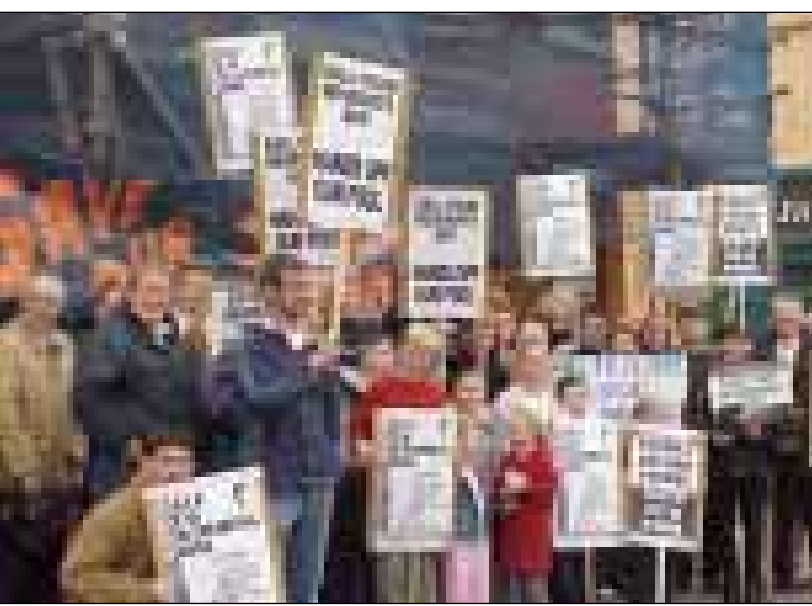
Ballymun's Save Our Swimming Pool protest

AROUND forty people from Ballymun picketed Bertie Ahern's constituency office in Drumcondra on April 23 to demand that the public swimming pool in