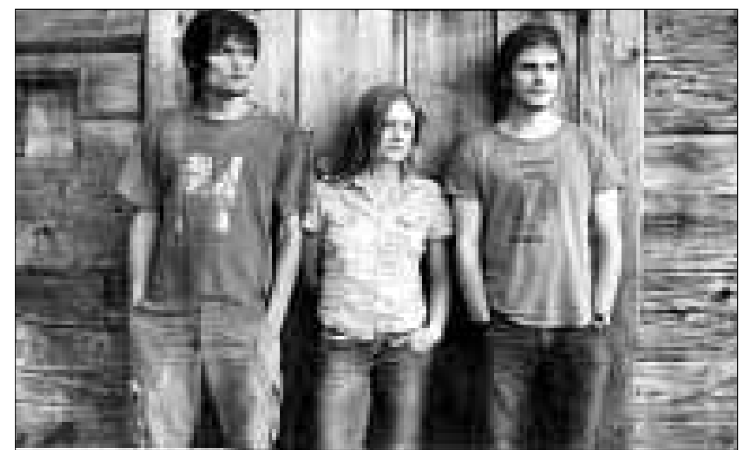
Beautiful scenery, a romantic twist and revolution all intertwine.

Beautiful scenery, a romantic twist and revolution all inter-