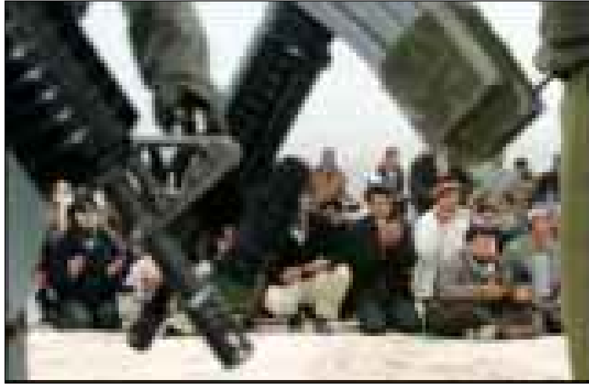
Palestinians pray under the guns of Israeli army

Nonetheless, the fact that this conference focussed on "reform" of the Palestinian Authority and took place in the face of an Israeli boycott, implied that violence in Israel/Palestine has its roots in Palestinian misgovernment rather than the illegal and brutal Israeli occupation.