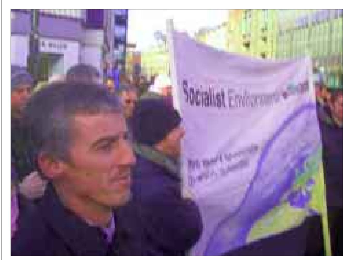
SEA opposing the privatisation of health and other public services