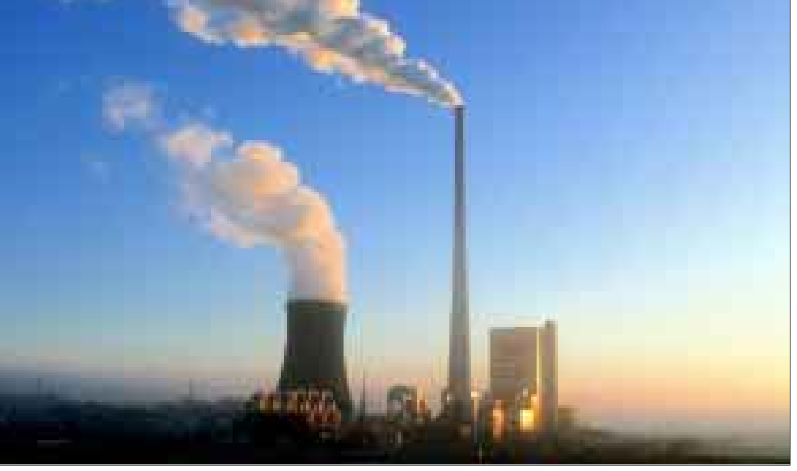
Pollution threatens the future of our planet

Such obstructionism by state-corporate power to action on climate change is not unique to the US.