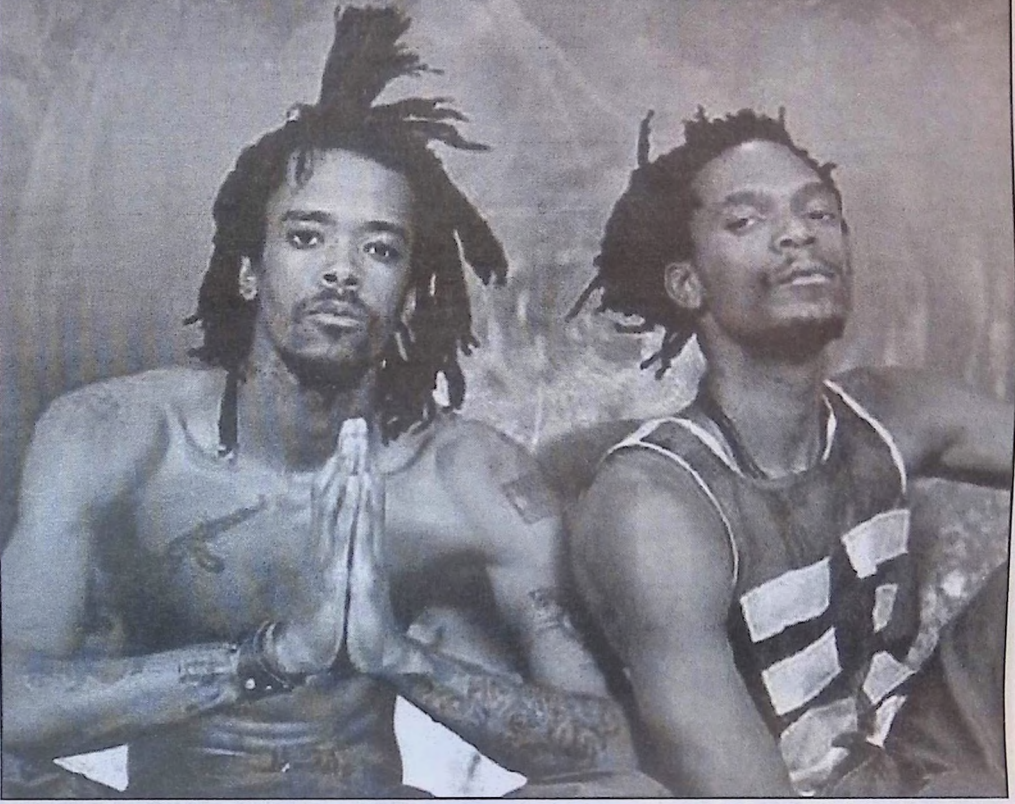
■ Dead Prez: Turning the tables on the racist police?

scope. Ghetto life still informs the lyrics but there are too many concessions to the "gangsta" style. Dead Prez paint a picture of people struggling to make ends meet. It's a life of welfare lines, food stamps and "minimum wage" jobs. It's a life where the fat gold chain image of hip-hop never meets the reality. Speaking from experience they rap about how hopelessness can lead to alcoholism and how the vio-