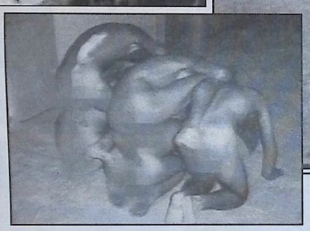
Pictures of US troops abusing and torturing Iraqi prisoners and (top left) a British soldier urinating on a hooded prisoner. But a secret report has revealed that the torture and humiliation is systematic "softening up" of detainees for interrogation by intelligence officers.

THE US television network CBS broadcast last week pictures of US soldiers committing acts of abuse against Iraqi prisoners, in the notorious Abu Ghraib prison outside Baghdad where thousands of Iraqis are imprisoned and subjected to human rights abuses