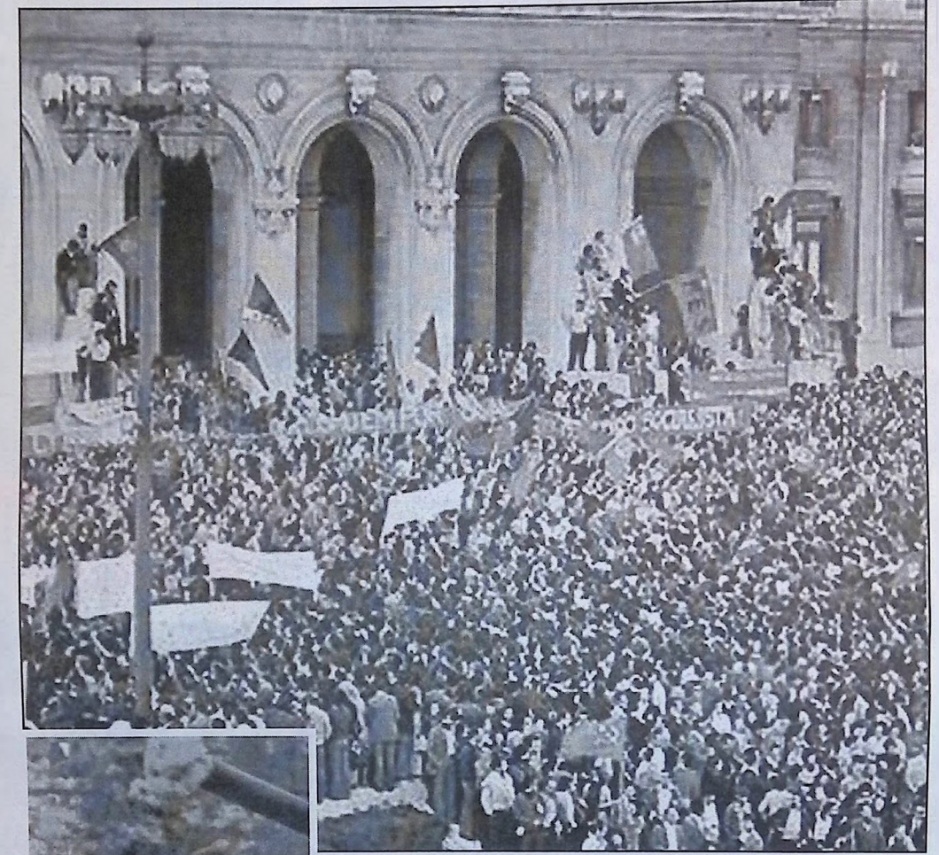
Revolution in Portugal April 1974

The second thing I did was to try to meet representatives of the PRP, which was one of the revolutionary socialist groups in Portugal and which had a number of worker militants in crucial workplaces