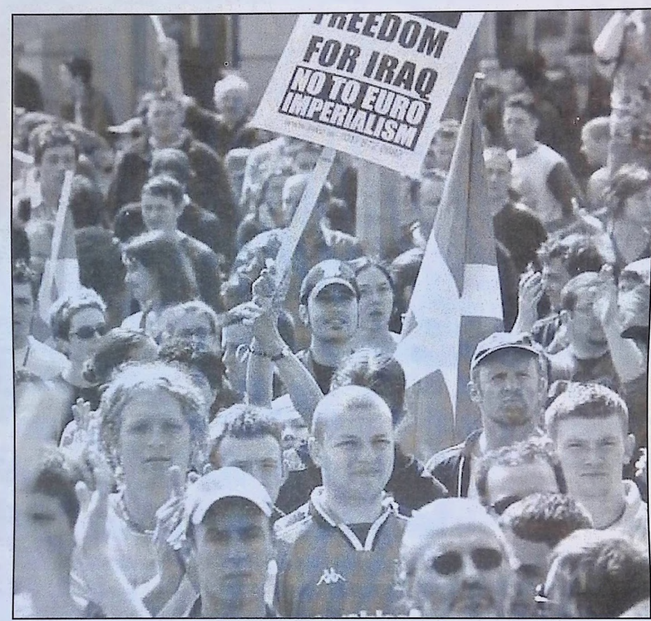
■ Another Europe is Possible May Day march and carnival

Contact the Irish Anti War Movement at irishantiwar.org, or 087-6329511.