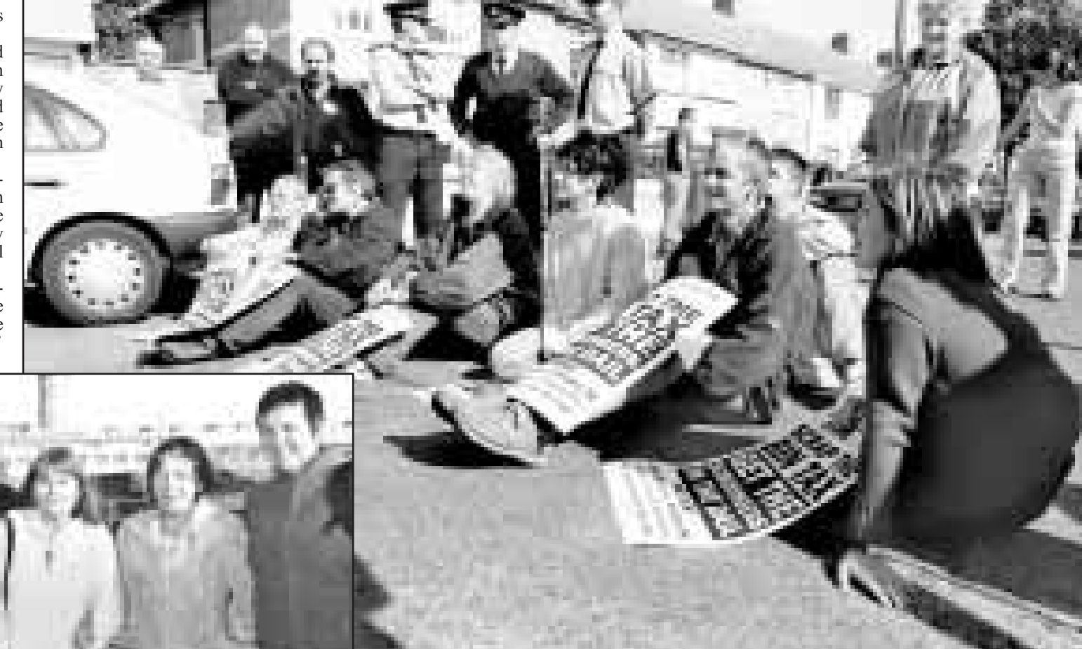
■ Protestors sit down in Mount Tallant and (inset) prisoners released from Mountjoy jail

'The council were collaborating with the Evening Herald to set me up and blacken my name.'