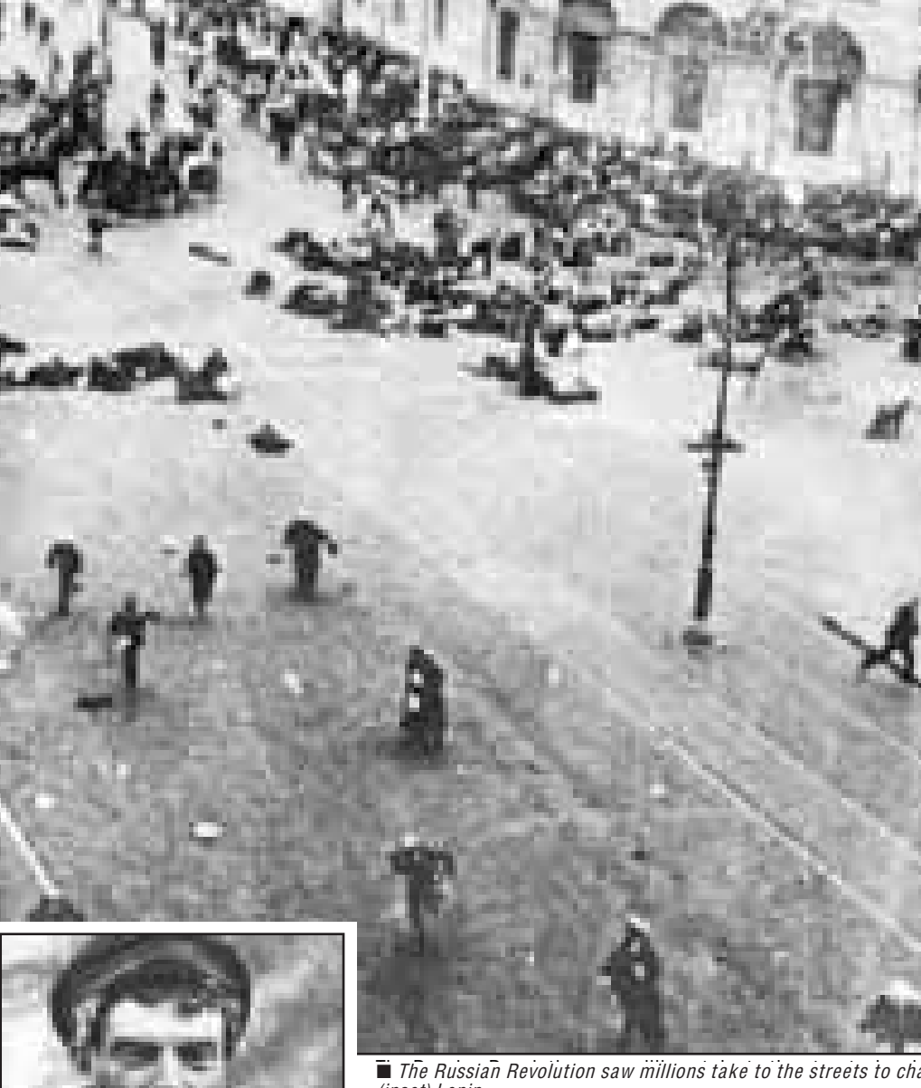
The Russian Revolution saw millions take to the streets to change the world and (inset) Lenin

Workers were trying to make sure that things didn't get worse and that they defended the gains that were made