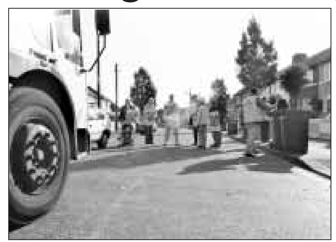
■ Bin tax protestors in Mount Tallant

The anti-bin charges campaign has become a mass movement in working class areas in Dublin where hundreds come to meetings each week.