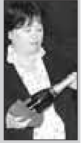
■ Time to crack open the bubbly again?

Just another example of the rotating door between the business and political