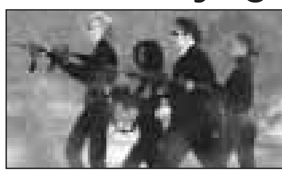
■ Carnival of violence

pend its disbelief' and think that what they see on the screen is any way real.