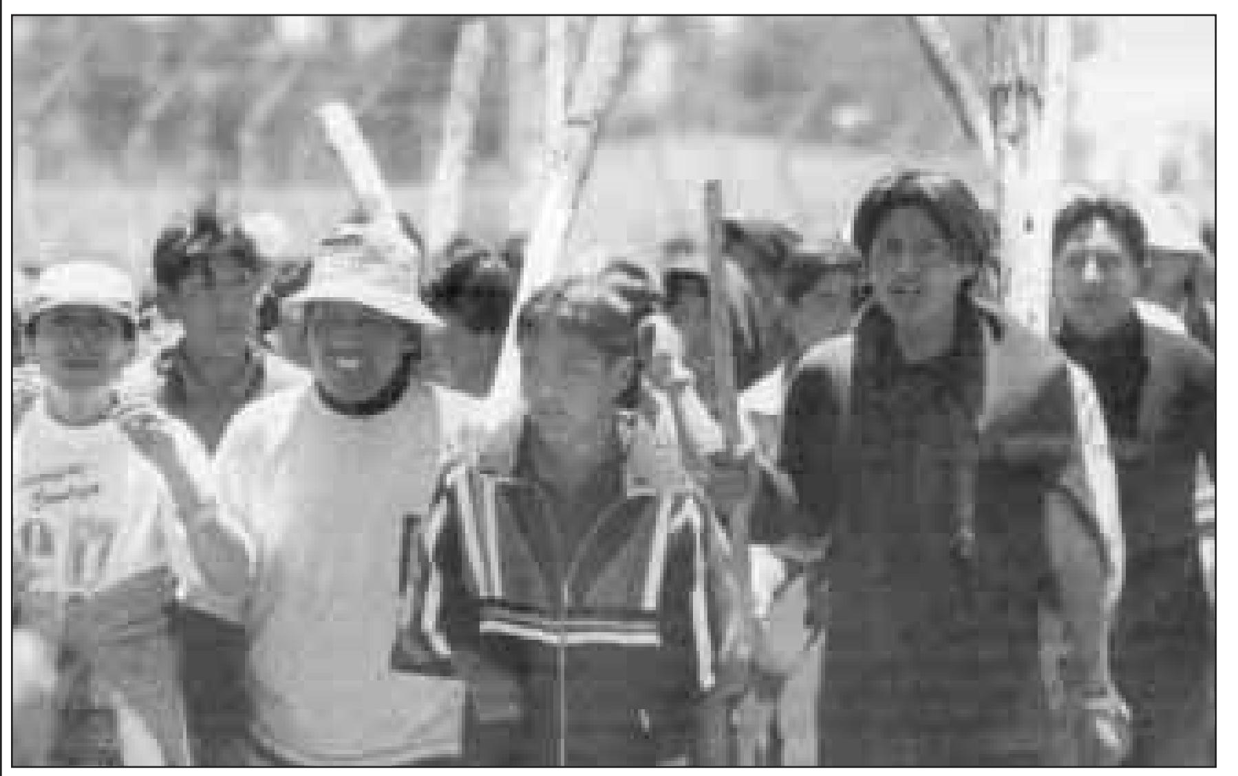
■ Miners and the poor poured into the streets of La Paz in October