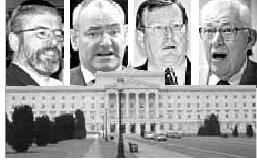
■ Can socialists pose an alternative to these at the Assembly elections?

de-rating is being raised, at every opportunity, by every establishment politician - SF, SDLP, UUP, DUP - these days.