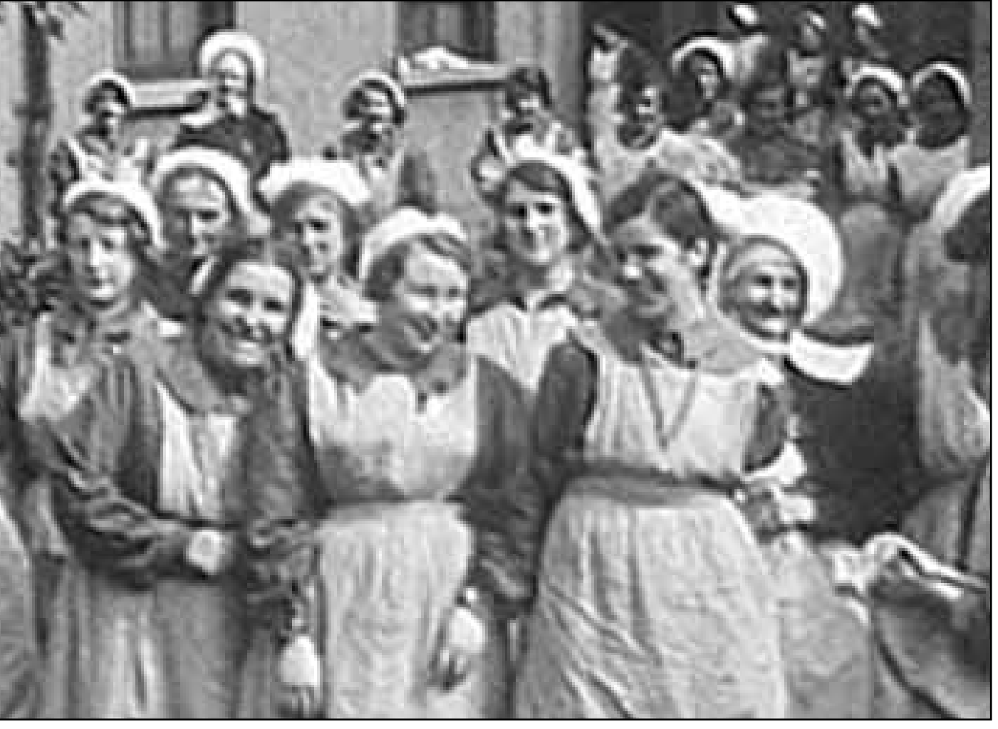
Smiles for the camera but the reality was 'an ocean of sorrow'

'The Magdalen laundries were places where women who got pregnant outside marriage were sent. Or even girls who were at risk of getting preg-nant. They might have been seen dancing at the cross roads and the parish priest would call to their house and suggest they move to a new job