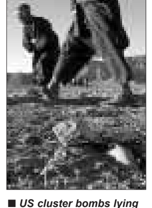
around in Afghanistan

MOAB (massive ordnance air blast) bomb, which was specifically developed by the US for use in the war on Iraq.