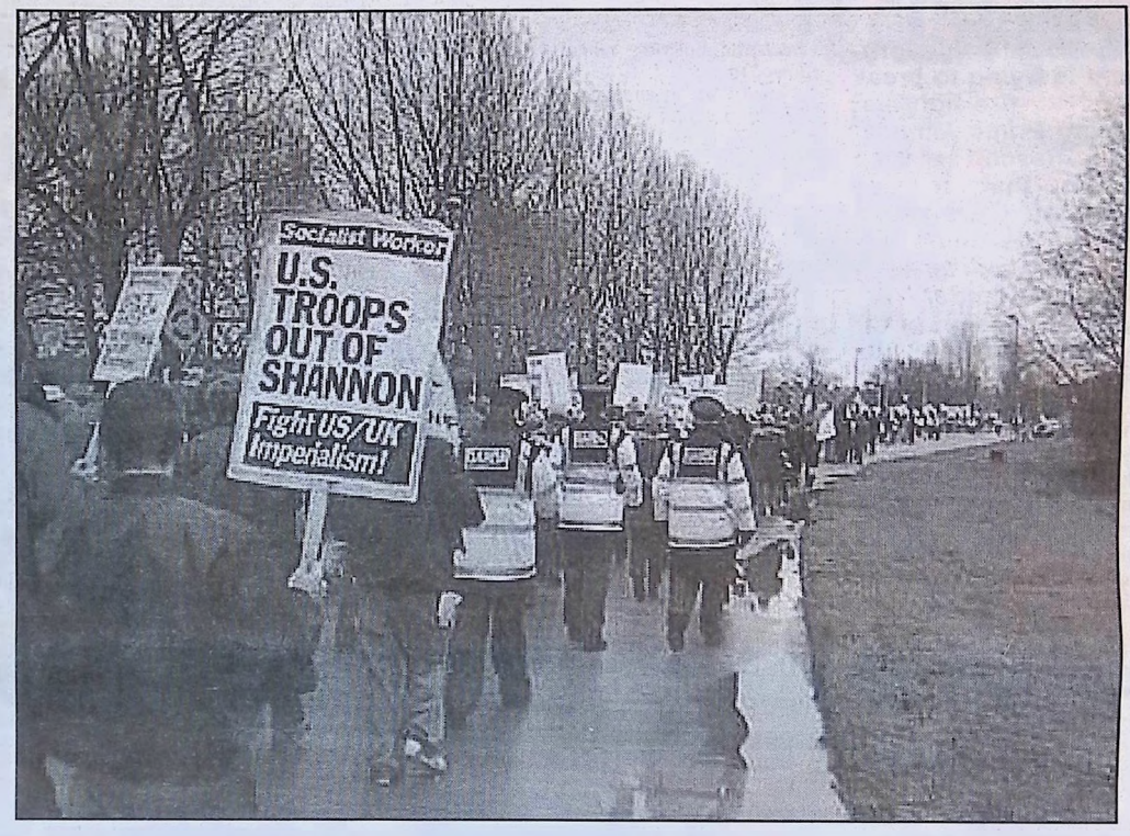
■ Recent protest demo in Shannon

It is going to take people power to stop this bloody war and to close off Shannon to US warplanes.