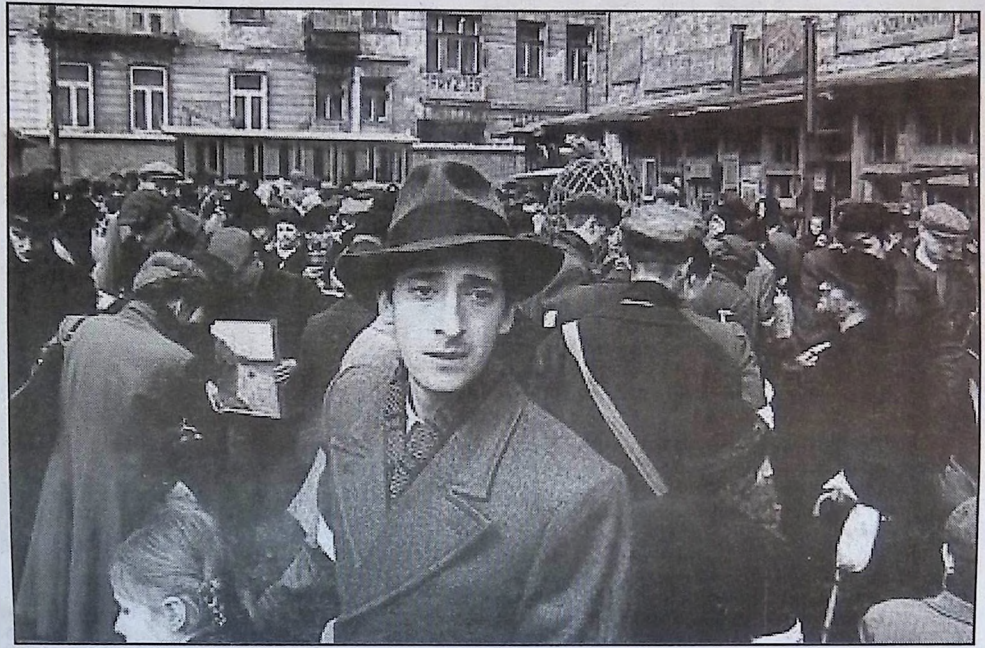
■Struggling just to survive in the Warsaw Ghetto