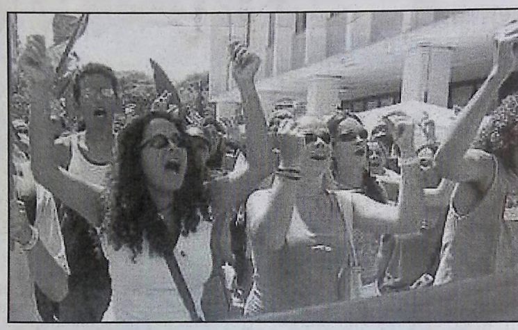
Anti war demonstration at WSF in Brazil

They also understood that Venezuela's rich had tried to overthrow Chavez with a lockout, disguised as a strike, because he had promised a few reforms for workers, peasants and the