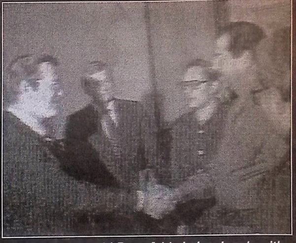
■ All pals: Donald Rumsfeld shakes hands with Saddam in 1983