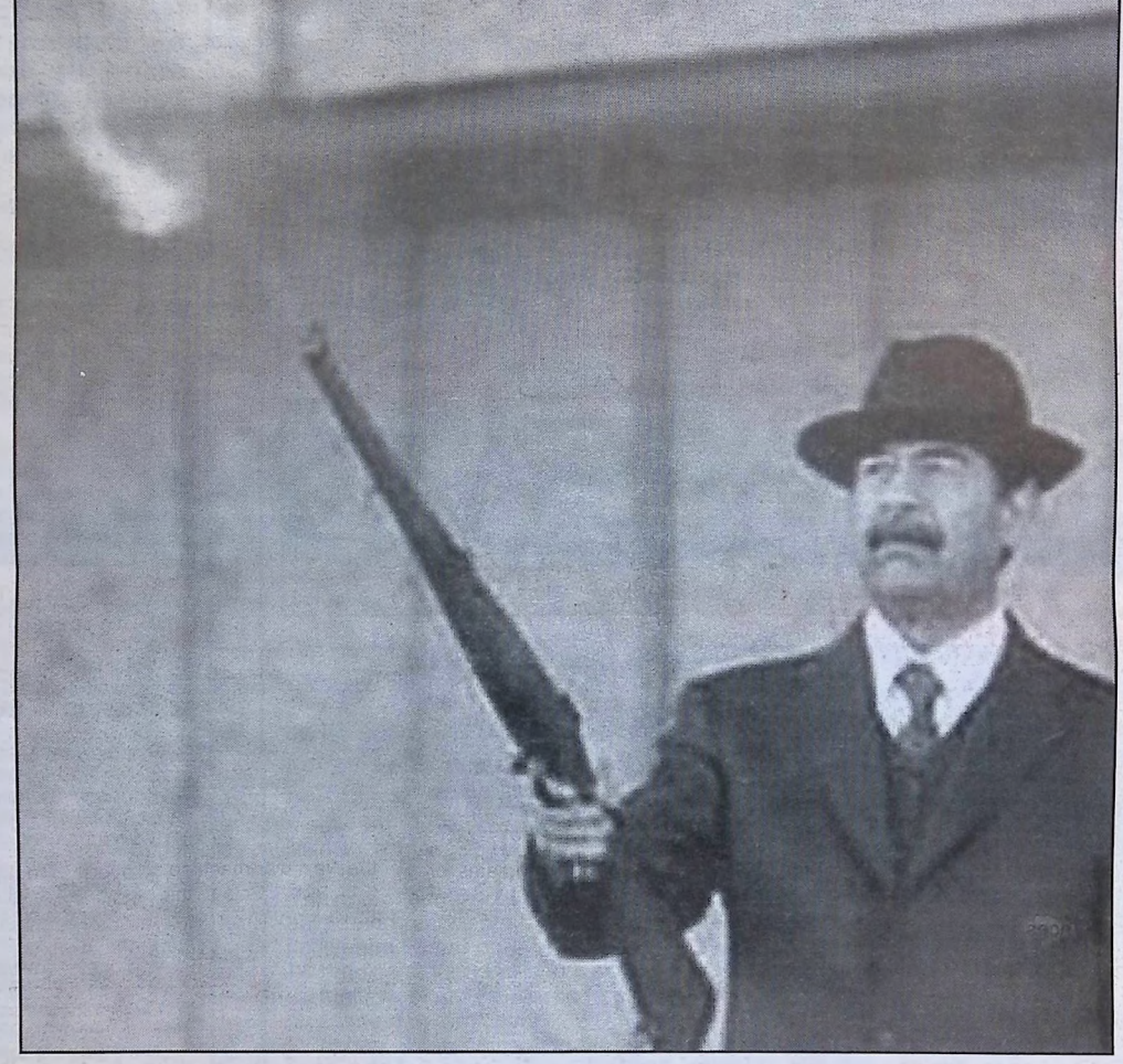
■Saddam turned one-party rule into a one-man rule

This "great victory" for the C.I.A. saw 10,000 people killed in one week and nine months of persecution, directed overwhelmingly