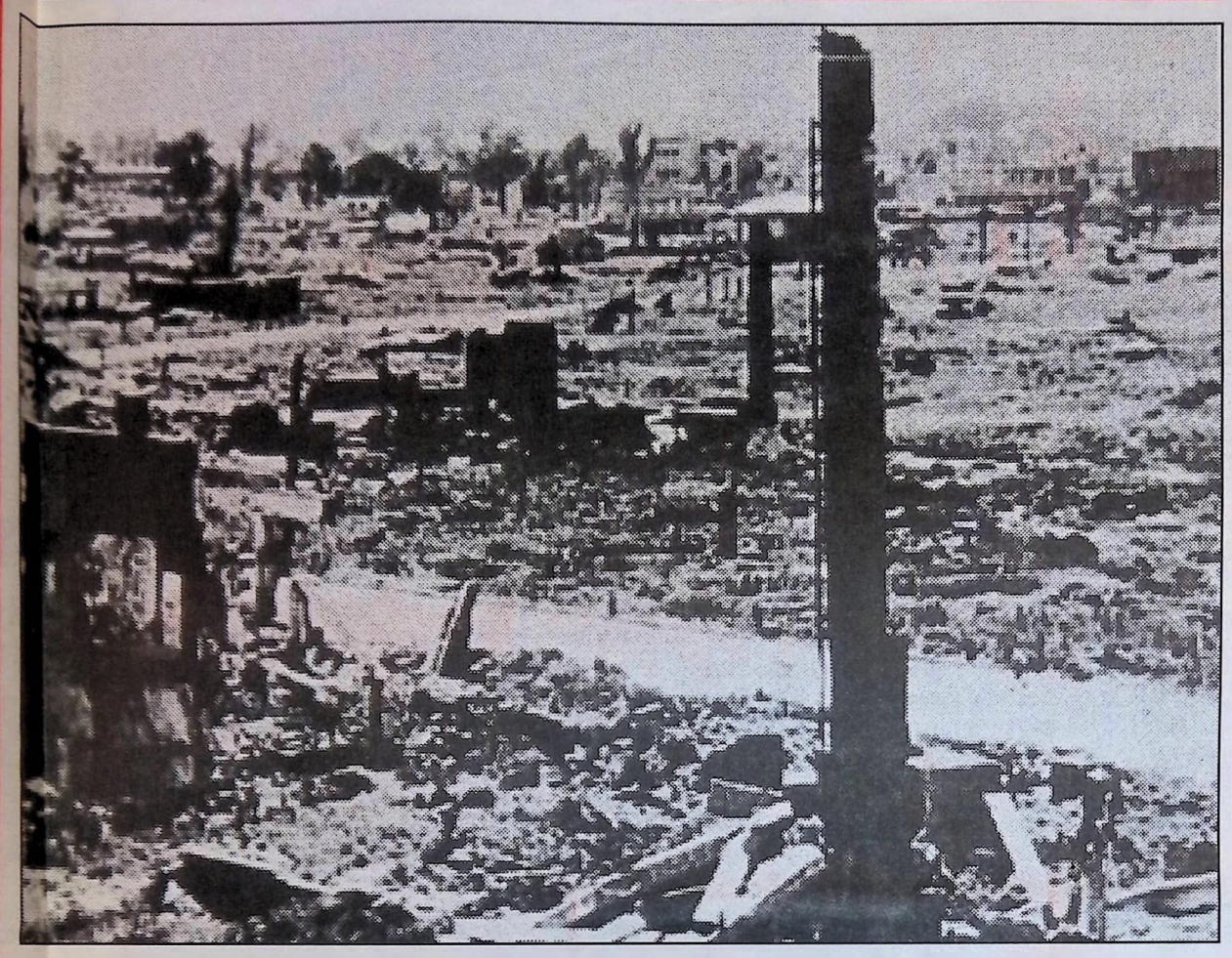
■1953, the North Korean capital Pyongyang is devastated by relentless US bombing backed by UN

ant to spread a belt rdioactive cobalt the S ea of Japan to Yellow Sea."