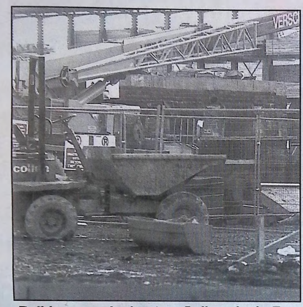
Builders marched onto a Collen site in East Wall and took this photo. Note the lack of safety rail and inadequate scaffolding. This is potentially lethal.

Sub-contracting is where the Sub-contracting is where the workers are not directly employed by the main contractor but "self employed". To qualify in law a sub-contractor would have to supply their own materials, but this seldom happens. Sub-contracting is usually just a cover for tax fiddles and the black economy. A brick layer explained the issues to Socialist Worker: "Sub-contracting can occasionally be genuine—for example there are in plumbing, electrical and mechanical trades genuine sub-