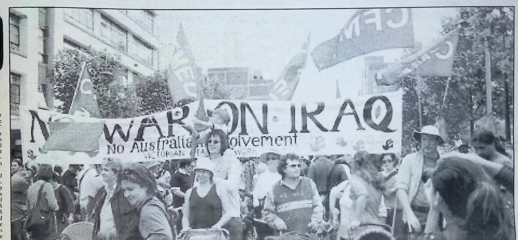
AS THE news of the bombing in Bali broke an anti-war demonstration took place in Melbourne, Australia. Around 45,000 protesters joined the march

A US Space Command report. The Long Range Plan, called for the US to build up "war fighting capabilities across the full spectrum of conflict" to "protect US conflict" to "protect US interests and investment". US defence secretary Donald Rumsfeld testified to the Senate Armed Services Committee, "The US must be able to impose tems includ-ing the occupation of an adversary's territory and change of its regime."