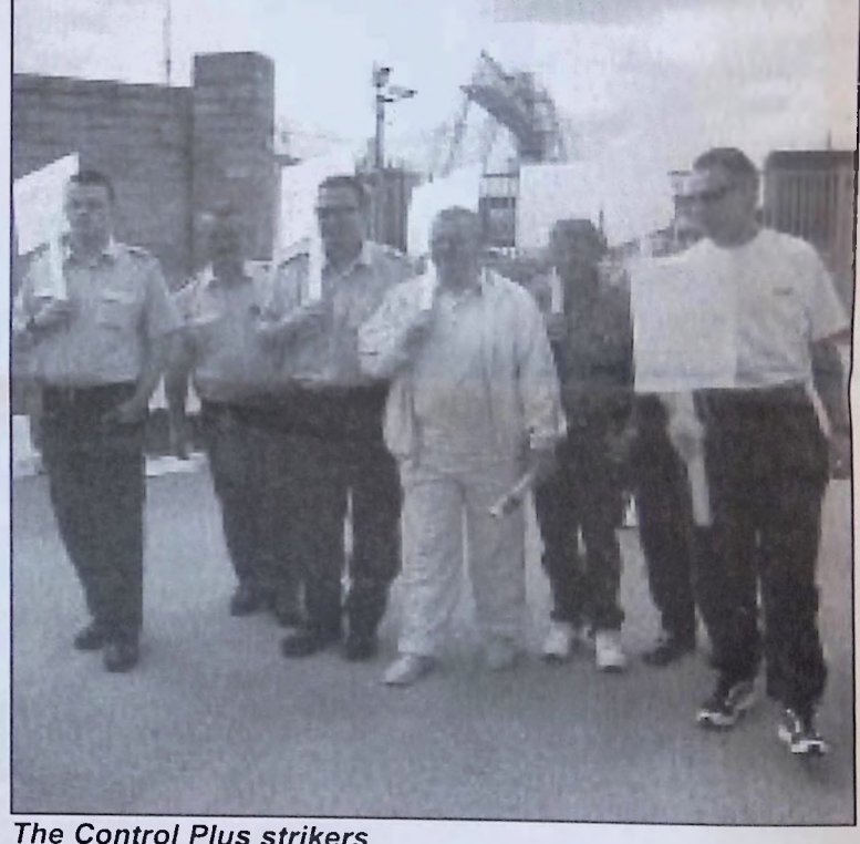
The Control Plus strikers

As soon as the strike began, the company brought in strike breakers. The police were then called—and took management's