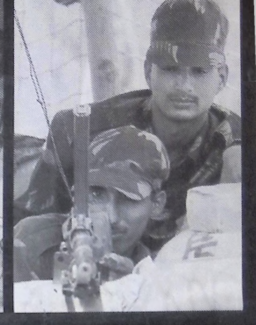
KASHMIRI civilians are the victims caught between Pakistan and India

mg for a "free and impartial plebiseite" to be carried out in Kashmir to determine its future, India has not allowed one to take place. Kashmir remains divided in