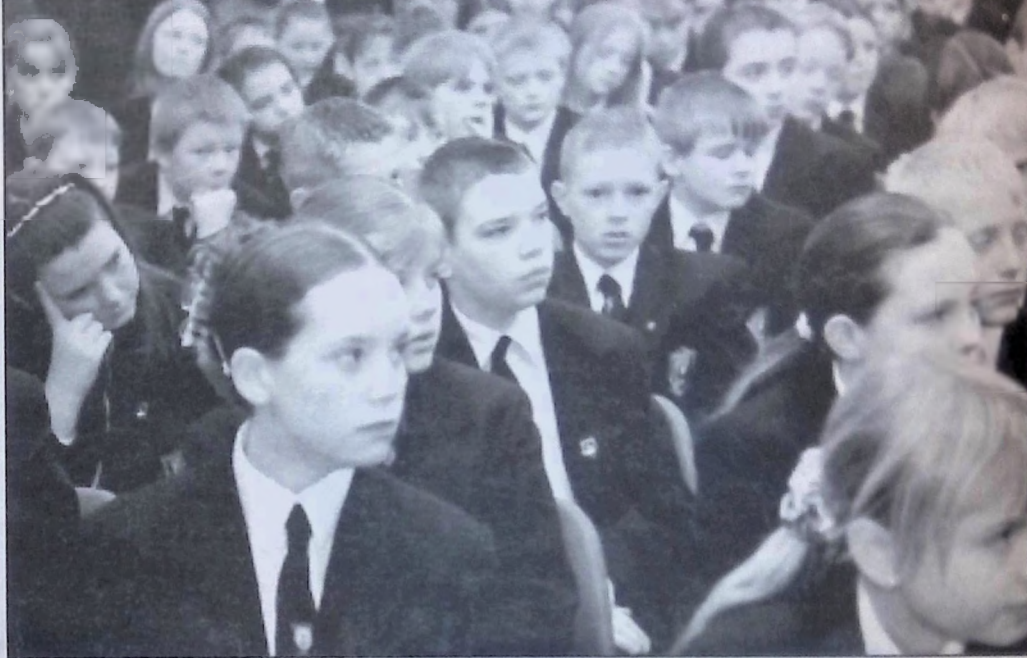
WE DON'T need no selection

They should also car paign for delegations of workers to attend the European Social Forum which is being held in