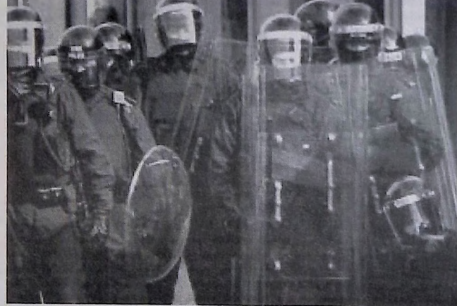
NEW POLICE? PSNI firing Plastic bullets on the Garvaghy Road last month.

The Ombudsman report attempts to distance the current type of the plastic bullet from the previous versions which were used to kill fourteen people, It says, "Injuries and deaths resulted from the use of the precursor of the