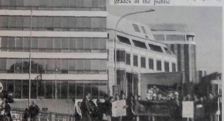
THE TWO souls of trade unionism: Liberty Hall and SIPTU

IMPACT's lead were able to get ew with this becau union activists mad Left within the wa are not well organia Union activists nonorganise now to east that the Report's f ings are not rame