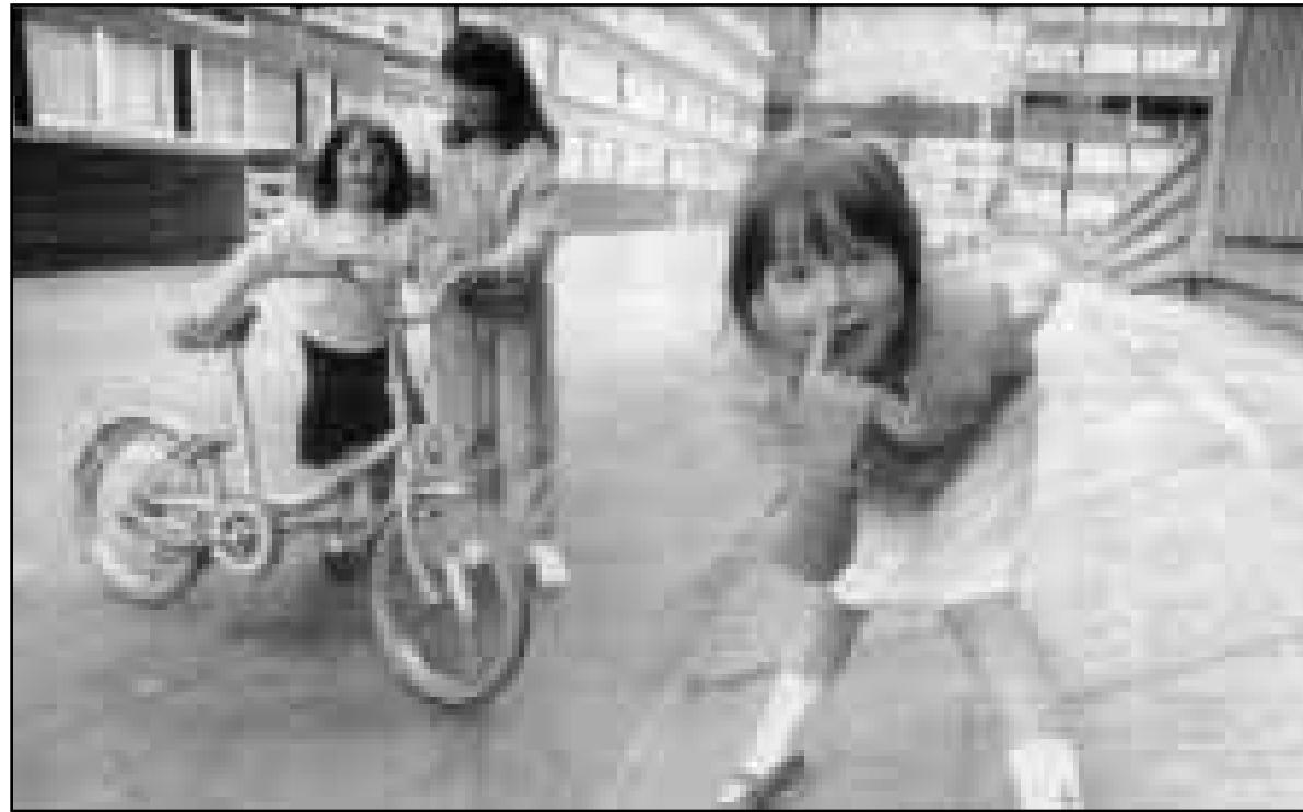
What is the future for these inner city children?

"While there are regeneration programmes in some of the worst affected estates in the country, most communities have very little faith in the government's ability to deliver the necessary supports and structures to seriously change people's lives.