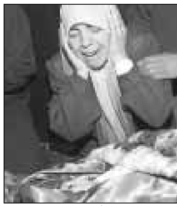
Mourning a victim of Israel