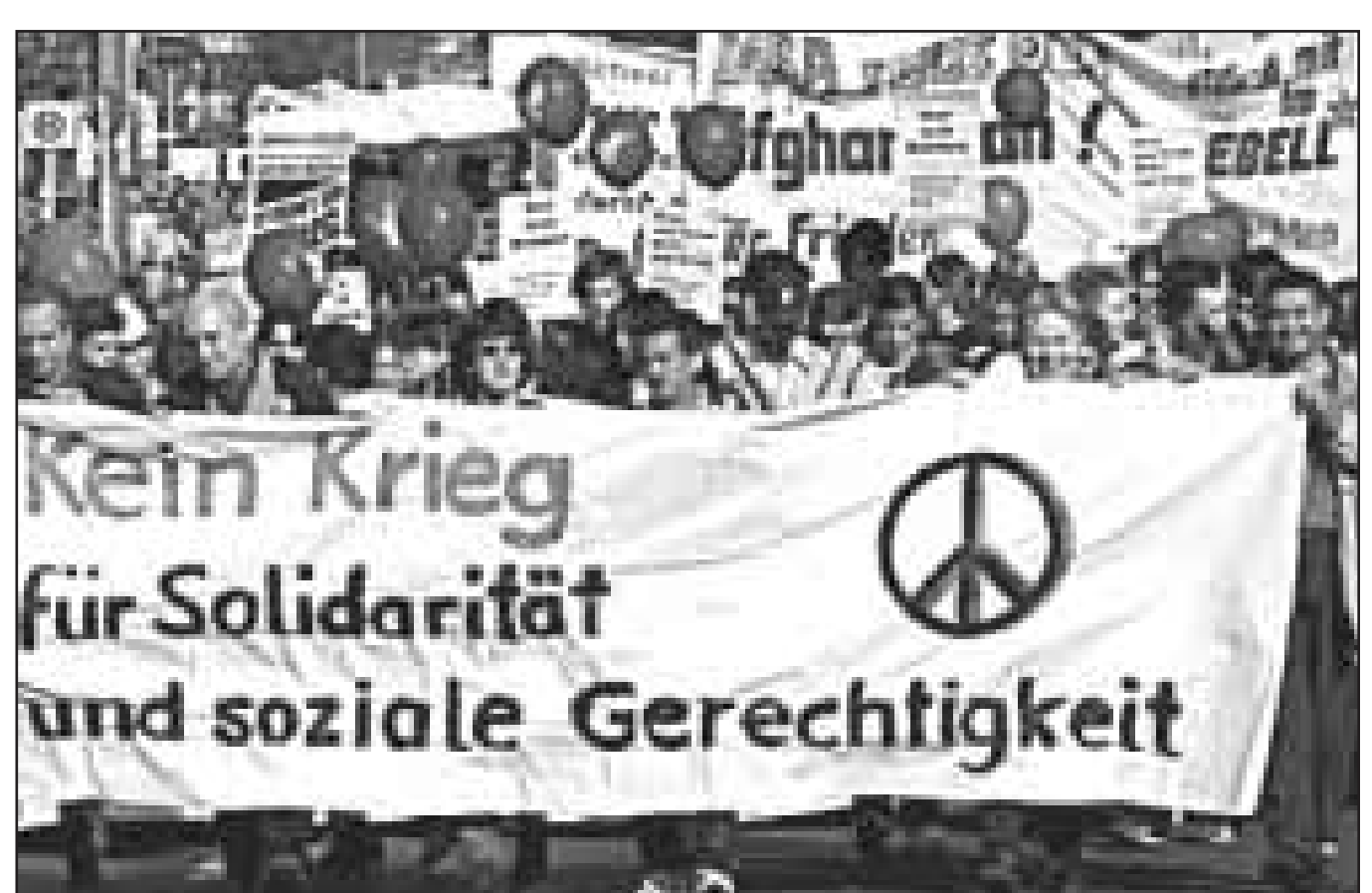
Anti war protest in Germeny For more on the anti war movement turn to page 6

This offers the best hope of stopping the horrors that Bush has in store for the world.