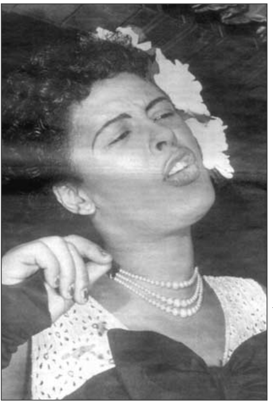
WINGFIELD Billie Holiday