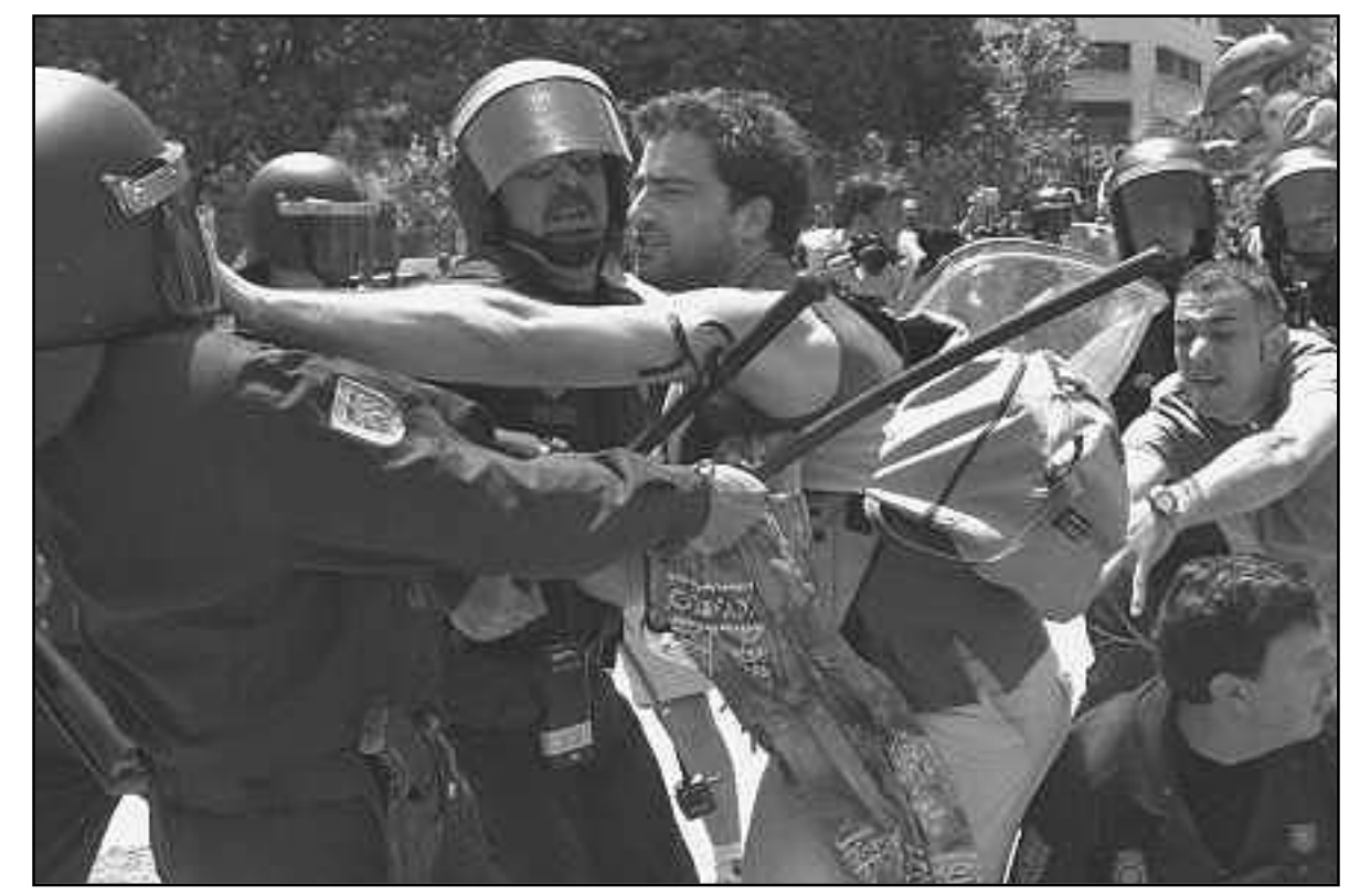
Police tried to cause trouble at the protests

If the World Bank had actually come the protests would have been twice the size."