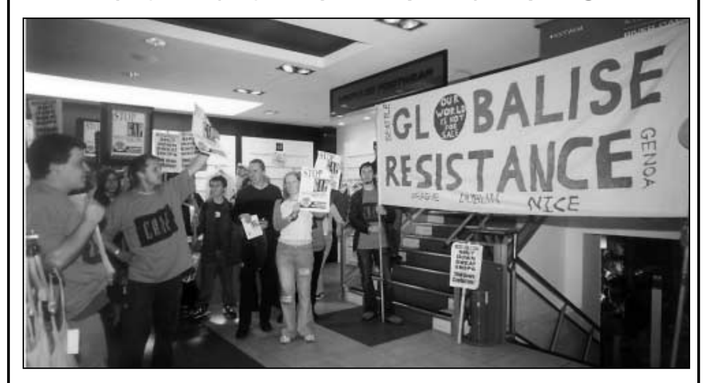
200 PEOPLE joined the protest against sweatshop labour at the new GAP store in Grafton St, Dublin on June 30th. The occupation lasted from 2pm to 4:30pm.

throughout the marching season and beyond. But we also need to offer an alternative to the politics of republicanism, which has led Sinn Fein Ministers to cut hospital services and implement