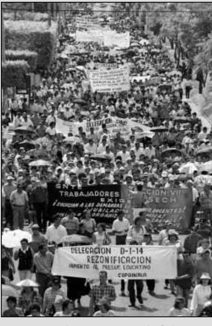
Thousands of teachers march in Chiapas as part of Mexico-wide strike for better pay.