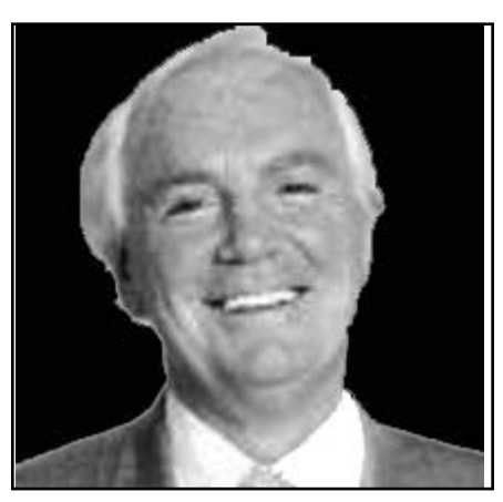
Tony O'Reilly media baron grabbed £11 million in just one year.