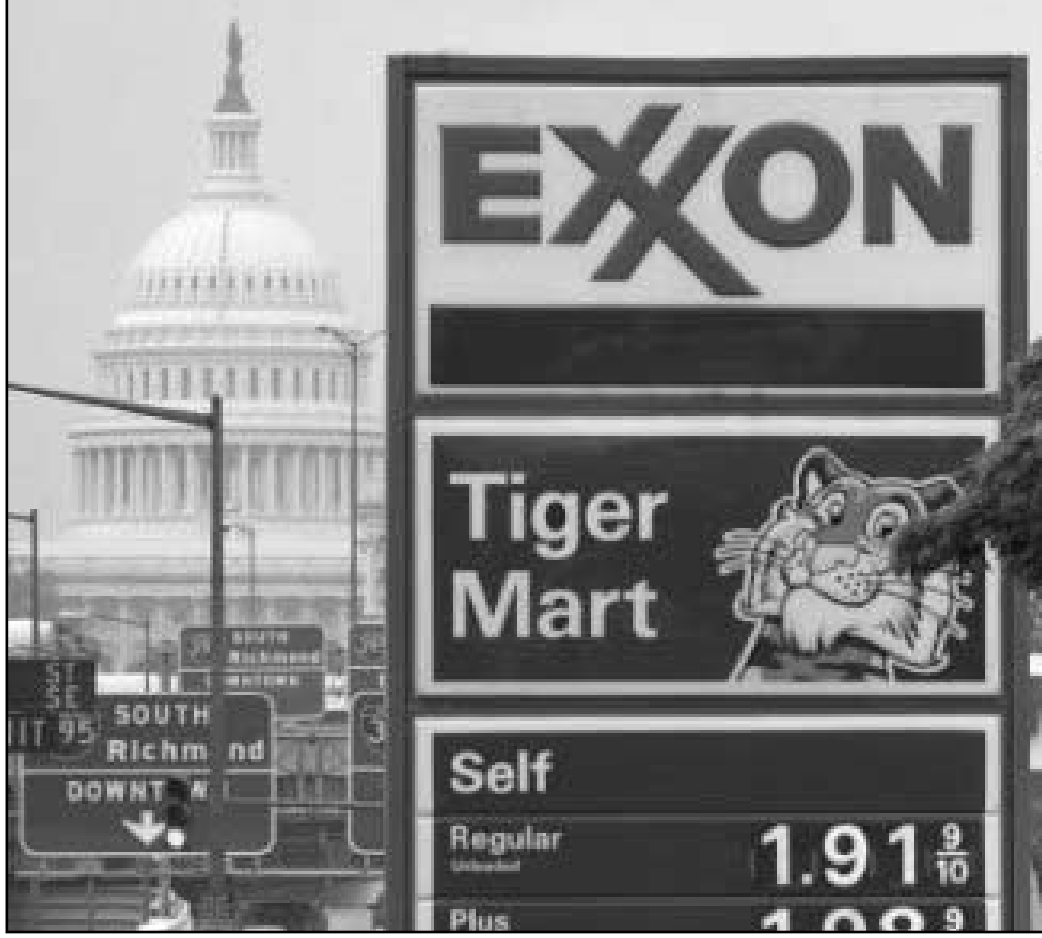
The power in front of White House