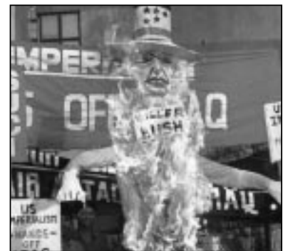
There were protests around the world like this one in India against the bombing

Tomatoes, onions, potatoes and meat for local people were drenched in uranium dust. There is a fourfold increase in cancer today in the south of Iraq, and children are dying of leukemia and lymphoma cancer.