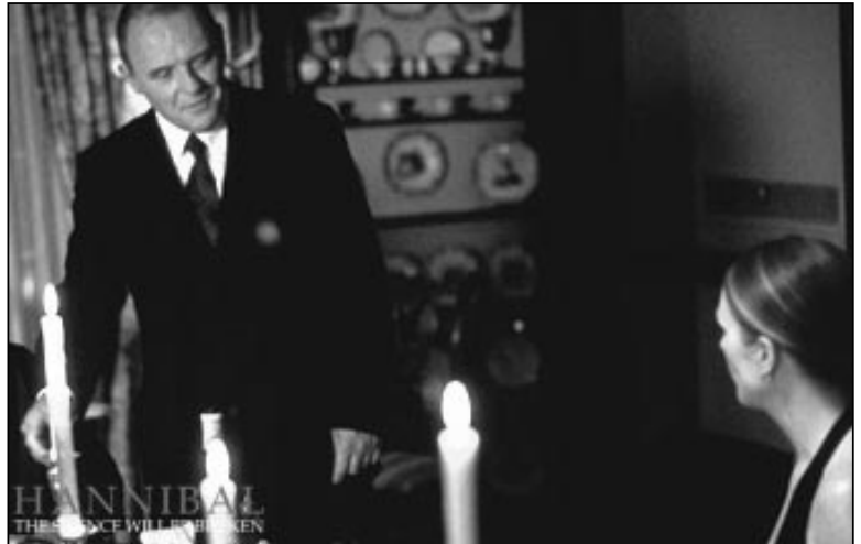
DR. LECTER, possibly worried by contamination in the food chain

In fact, psychiatrists who dealt with Dahmer and were interviewed by Channel 4 pointed to his traumatic childhood and social isolation as probable causes of his psychopathy.