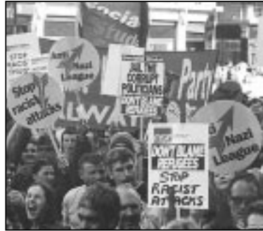
Protesting against racism in Ireland

The Campaign is producing a fact-sheet and plans a major demonstration against deportations on June 16th.