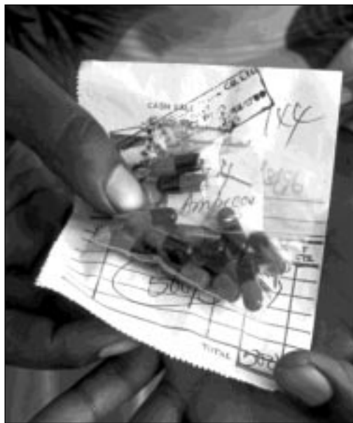
"If you don't have money today, your disease will take you to your grave."

The ability of a country to finance effective AIDS programs is measured by the amount of GNP available per-infected person.