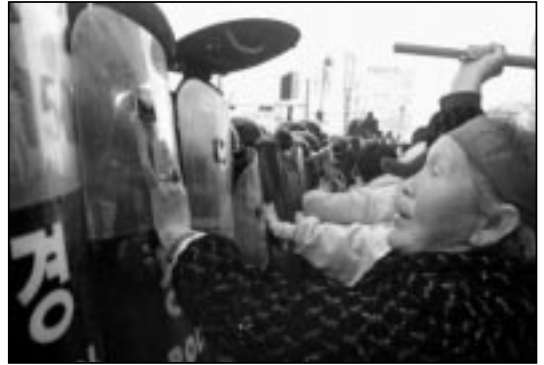
Workers and their relatives fought police repression