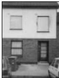
The house on Old Court Estate in Bray

But this was a tragedy that could have been prevented.