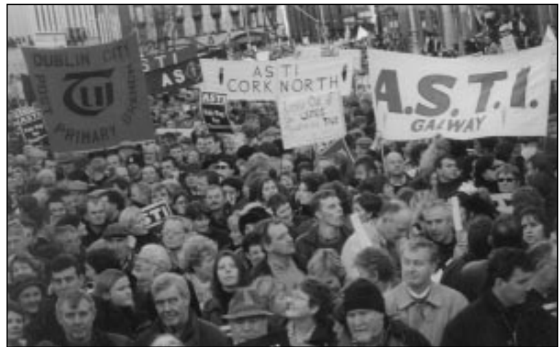
Teachers marching on the Dail