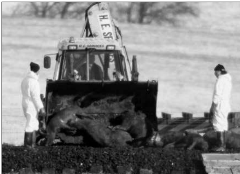
Slaughtered pigs being dumped because of the foot and mouth outbreak

And just as the symbol stinks so does the overall system. All the more reason to spread the anti-capitalist movement to every corner of Ireland.