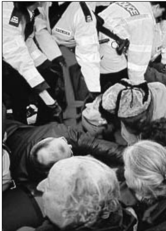
Part of the big blockade at Faslane

During manoeuvres a nuclear powered sub crashed into an undersea sand mountain in the Irish Sea. "I've never been so scared in all my life," he said.