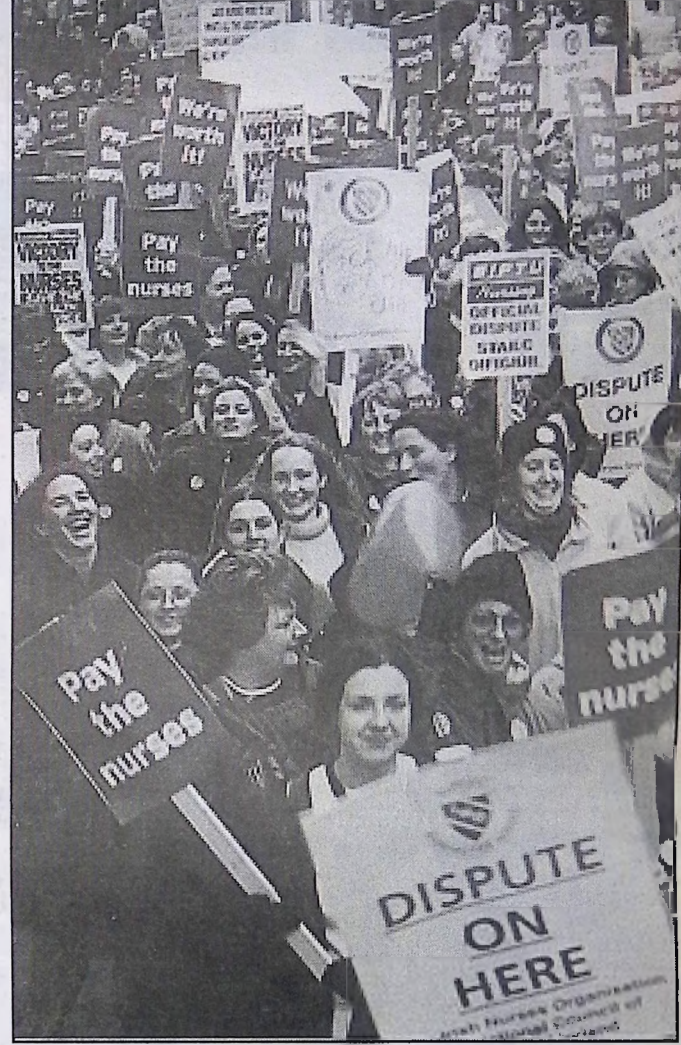
The Nurses strike was just the start of a wage revolt against the Celtic Tiger

As speculators profited the housing crises has left 150,000 people in need of adequate accommodation. The cost of a house is now beyond the reach of most workers. Mortgage payments have increased by 46 percent in the last year alone