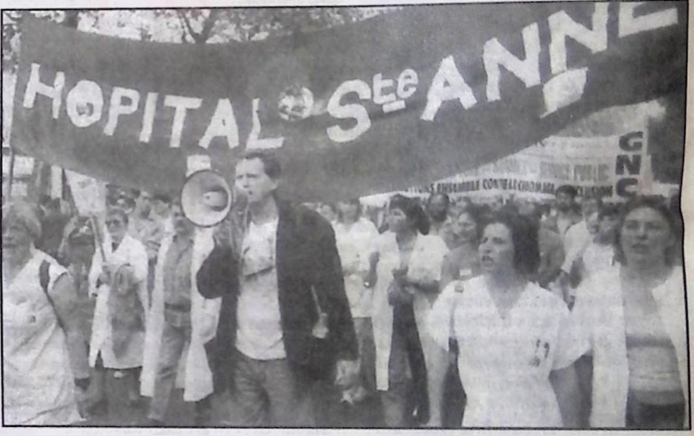
Trade unionists from across Europe will descend on Nice