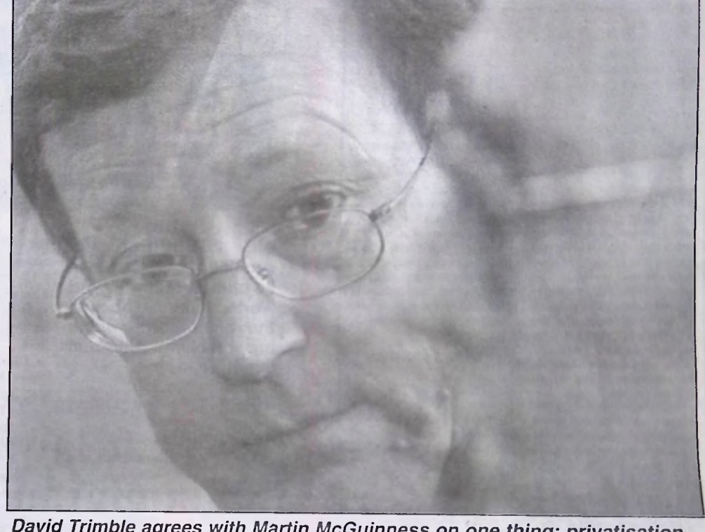
David Trimble agrees with Martin McGuinness on one thing: privatisation

But it is not only Sinn Fein that support PFI, Trimble's unionists are also big supporters. PFI is a policy of the former Tory government, which means private companies building schools and hos-pitals and then leasing them back to the public sector for periods of up to 30 years. It usually means that the private contractors are paid more than five times the origi-nal cost of the building. In Britain the Blair gov ernment has recently announced plans to extend the PFI across the NHS.