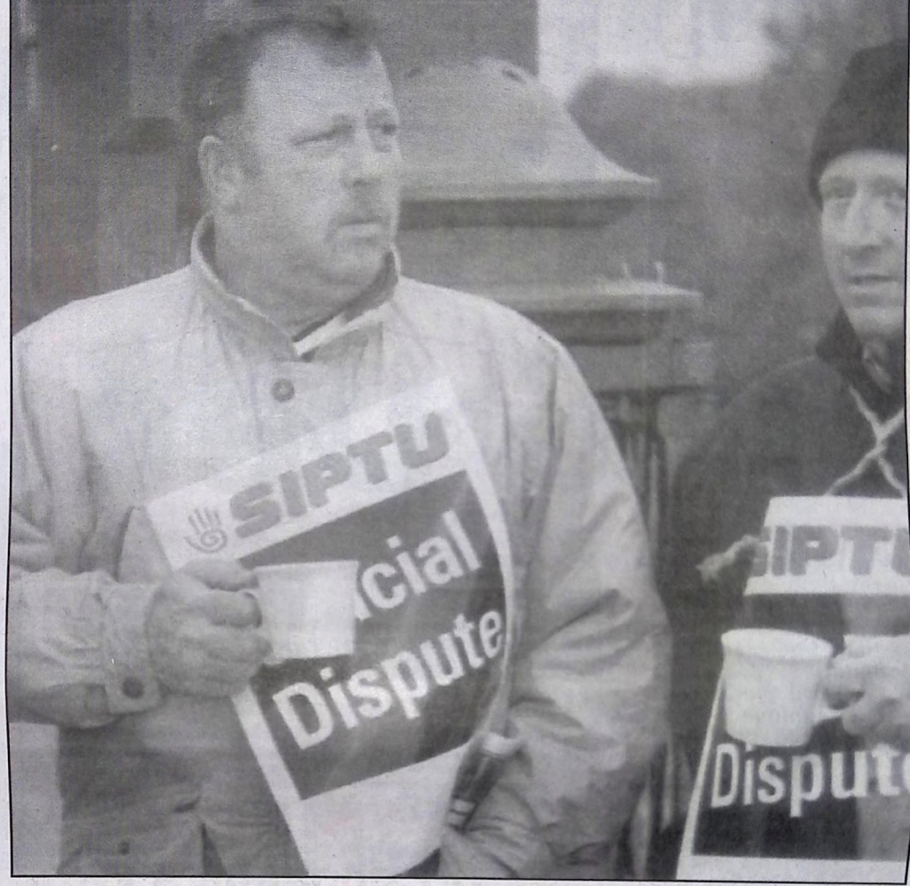
Signal workers closed down the rail network

Up until now the union leaders have been tied to a review of PPF