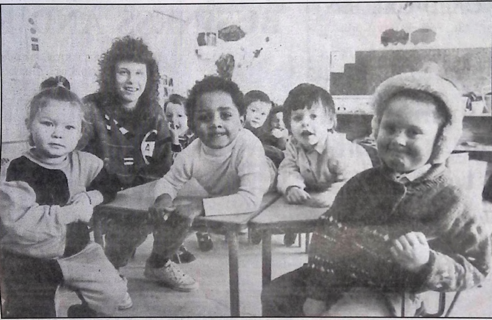
Ireland has one of the worst funded education systems in Europe

in private industry. Last year 7% of schools had to drop subjects altogether because they could find no one to teach