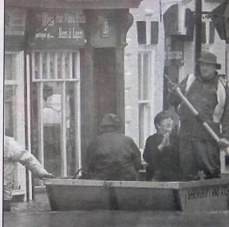
Floods the result of global warming

are the real cause of environmental destruction