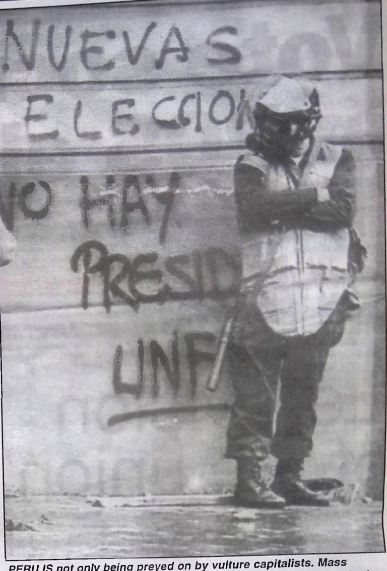
PERU IS not only being preyed on by vulture capitalists. Mass protests and riots broke out earlier this year against election rigging