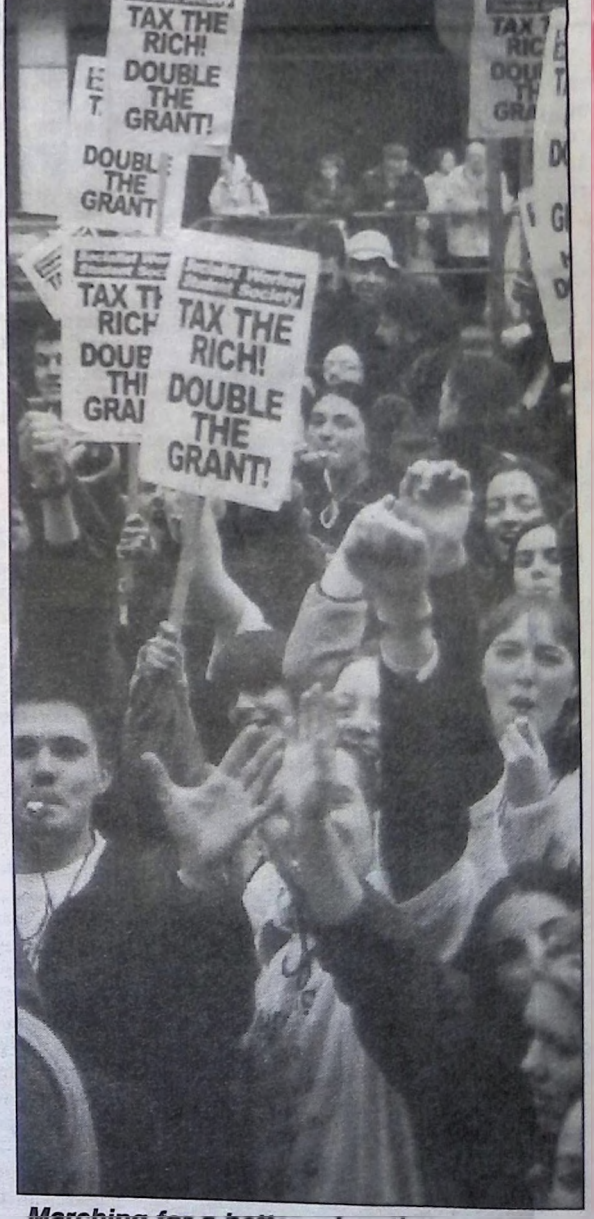
Marching for a better education