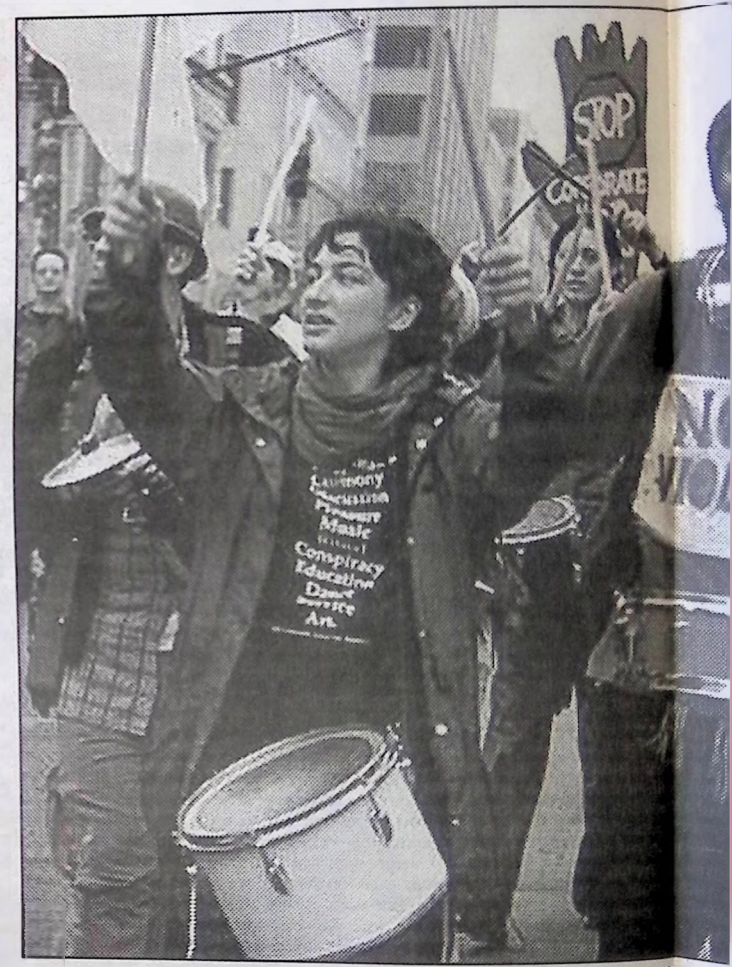
since the protests in Seattle last November th

not just because the contended mid-dle classes want to spend money. Increasingly workers are borrowing to make up for low wages. As Clinton and Gore continue to ramble on about " the best economy in a generation" anger is growing among workers. The bitterness at corporate greed that erupted at the huge demonstrations in Seattle last year, also found expression on the picket line. From the United Parcel Service to the strikes by Los Angelus janitors and Boeing engi-neers in early 2000, workers have disrupted the happy talk of "shared prosperity".