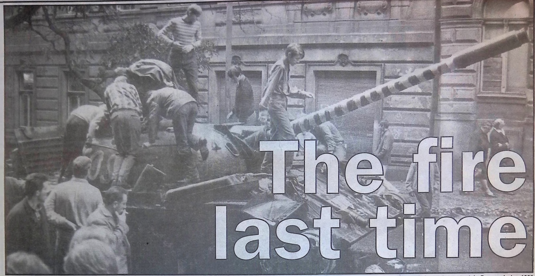
Students and workers storm a tank in Prague during 1968

are today seeing a global rebellion of the oppressed against the oppressor, the exploited against the exploiter."