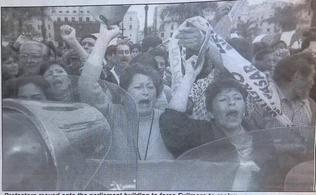
Protestors moved onto the parliament building to force Fujimora to resign

The boiling anger against the regime has continued. With a truck and public transport strike, starting the day Fullmer the day Fujimo ounced his resignation