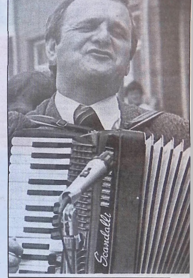
THE DUP's one man sectarian band

Their only answer is to encourage Protestant workers to compete with Catholics.