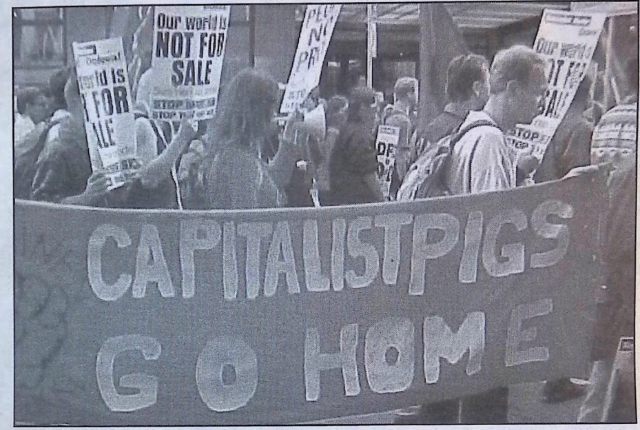
Thousands of Protestors went to Prague to close down the IMF

The task of socialists is to push this movement in a revolutionary direction so that it links up with the struggles of workers and shuts down capitalism for good.