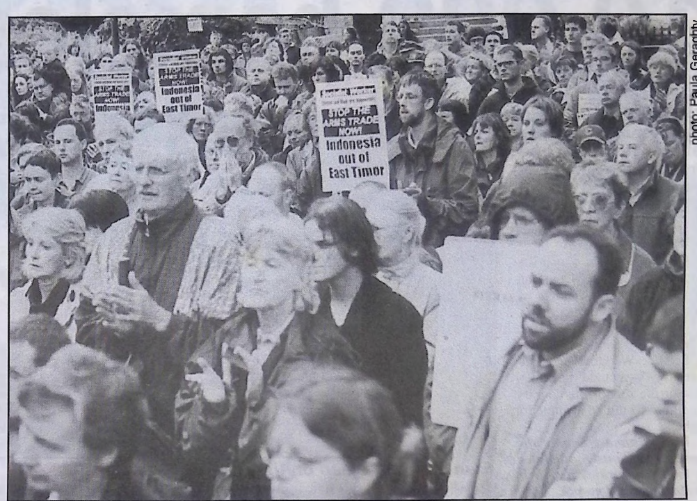
1,000's protested outside the American Embassy at the killings in East Timor

Instead of waiting in hope for sectarian political parties to end sectarianism, working class people should start to fill that gap with the politics of working class unity.