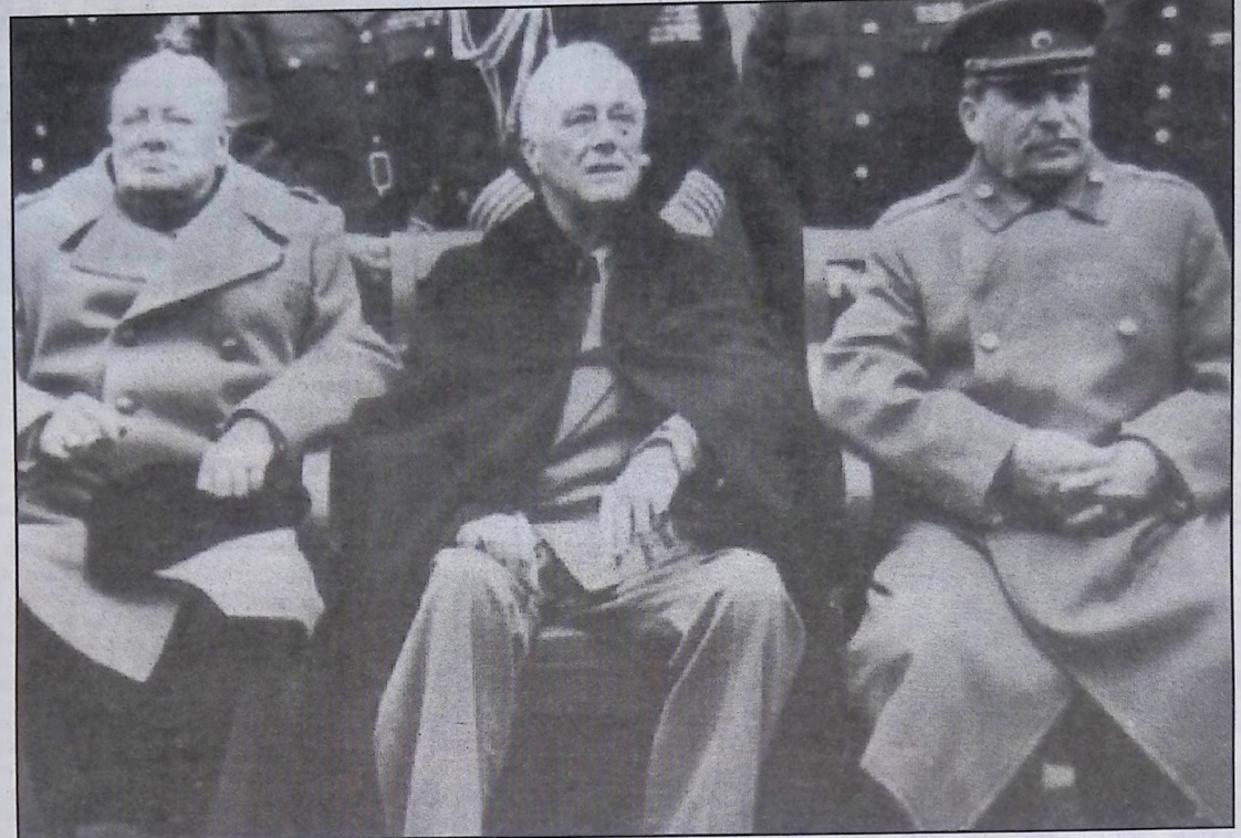
Churchill, Roosevelt and Stalin: all friends together at the Yalta carve-up

"Our bill must have been immense, for we had four magnums of champagne.