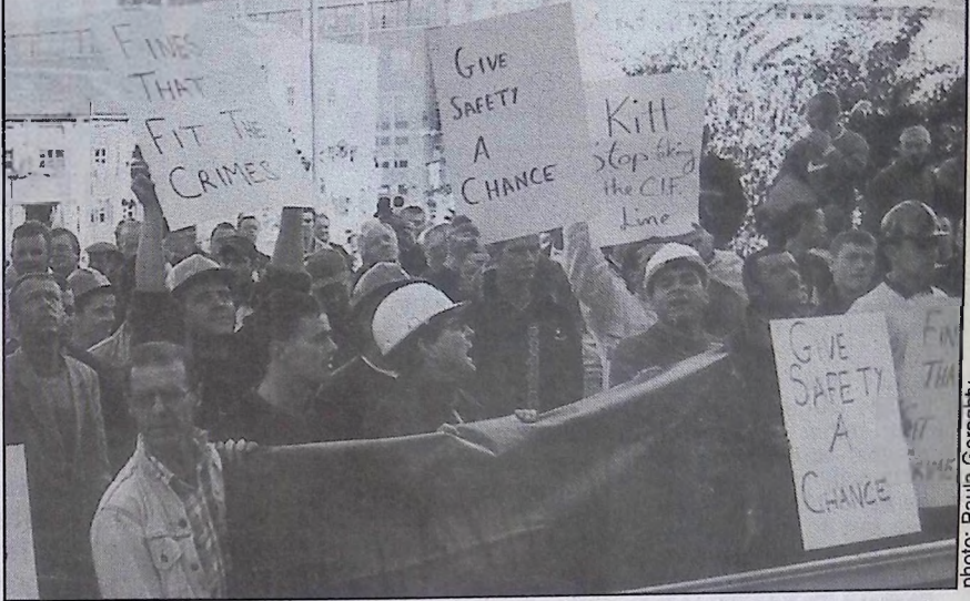
Over a thousand building workers marched in Dublin to protest at the deaths on the building sites

making the necessary changes. The response of the building workers is fantastic and it should become standard policy to call out all sites in the event of a death or injury of a colleague.