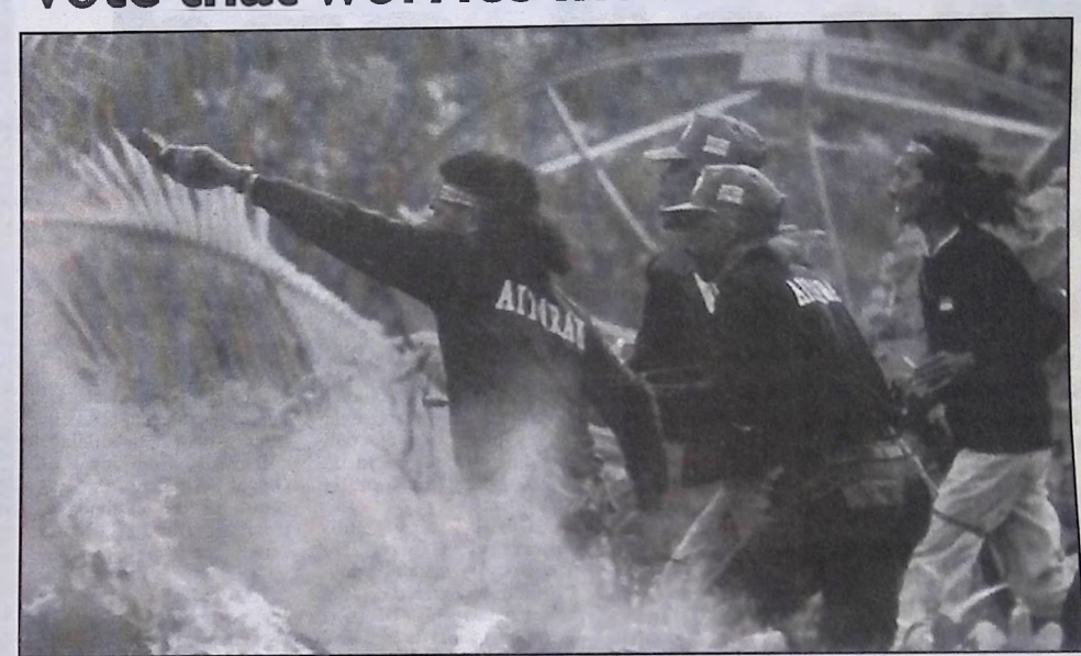
Pro-Government militia members attacker supporters of East Timorese independence

A REFERENDUM to settle the fate of East Timor, which has been occupied and annexed by the Indonesian military for a quarter of a century, is due as Socialist Worker goes to