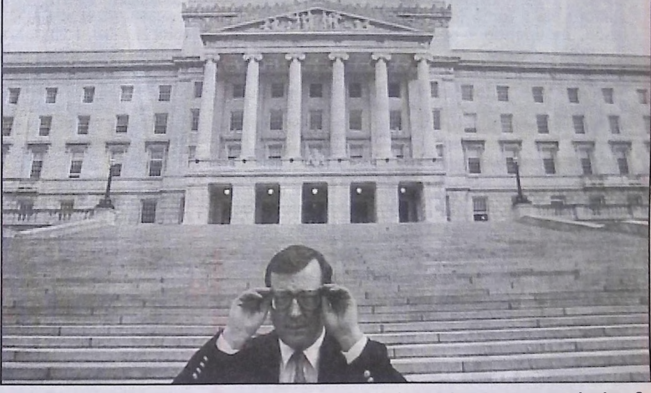
Trimble: Looking for the money for the peace prize or for more arms dealers?

licity. ASTOR is portrayed as a defensive radar system, but in reality it supports war planes on bombing missions. Raytheon itself says that ASTOR provides