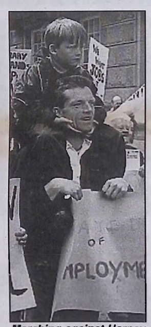
Marching against Harney

Socialist Worker spoke to a number of scheme workers on