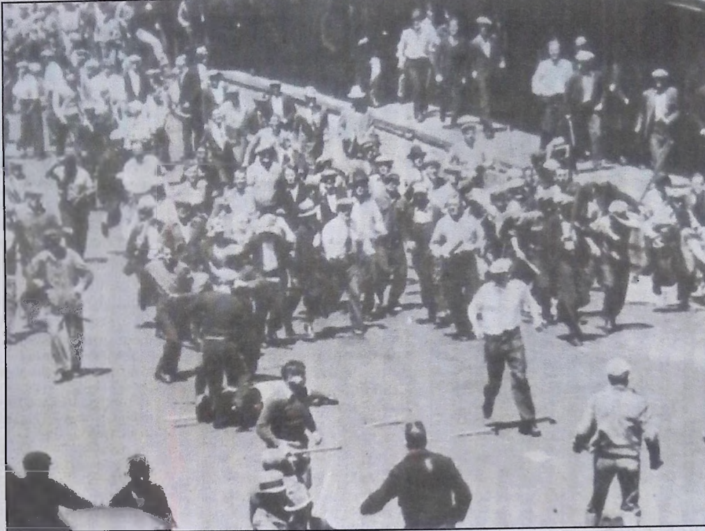
Teamsters defending the picket line

He explains how the contradictory role of the union leaders made this possible: "In their fundamental outlook they were oriented towards