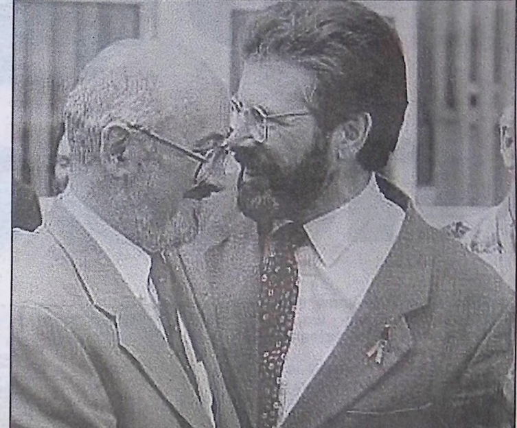
The pan-nationalist alliance has let the right set the agenda

Yet the murder of Rosemary Nelson indicates that sections of the RUC might be willing to go to extreme lengths to cover up their collusions. cover up their collusion with loyalist forces.