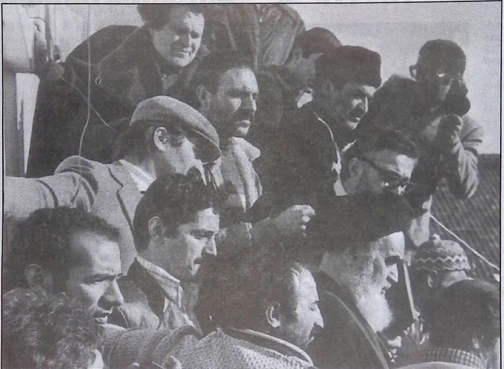
Khomeini returning to Iran.