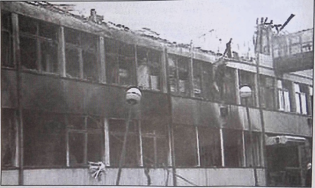
NATO bombs have devastated Pristina, the capital of Kosovo

disaster and deep divisions are already opening up within the