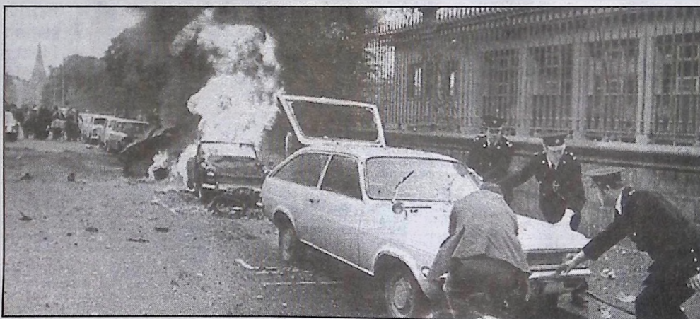
The scene of the 1974 Dublin bombing

■ The Bill also gives wide powers to the Gardai to harass non-nationals whom they "suspect" of breaking deportation orders.