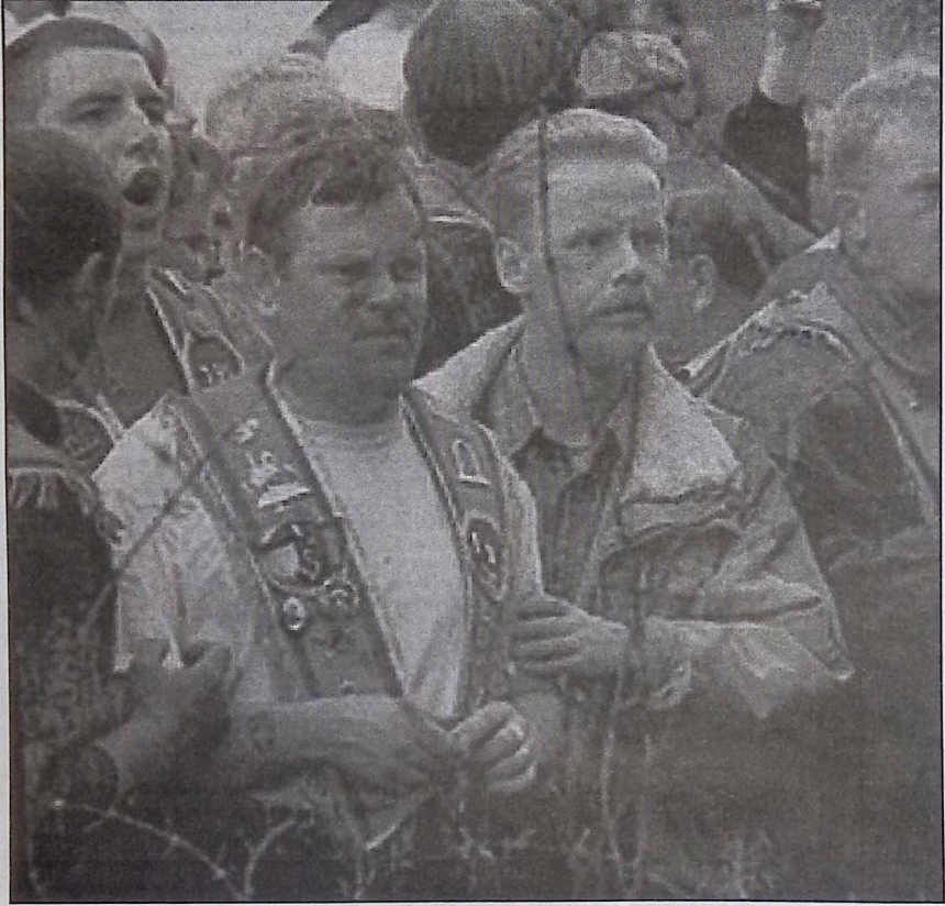
The Drumcree protests are smaller than ever

Sixteen Catholic families have been forced out of their homes in the last nine months. The most recent was after a Loyalist mob, including a