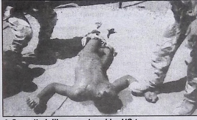
A Somali civilian murdered by US troops

As an Italian soldier said recently, "On one occasion we fired for 24 hours