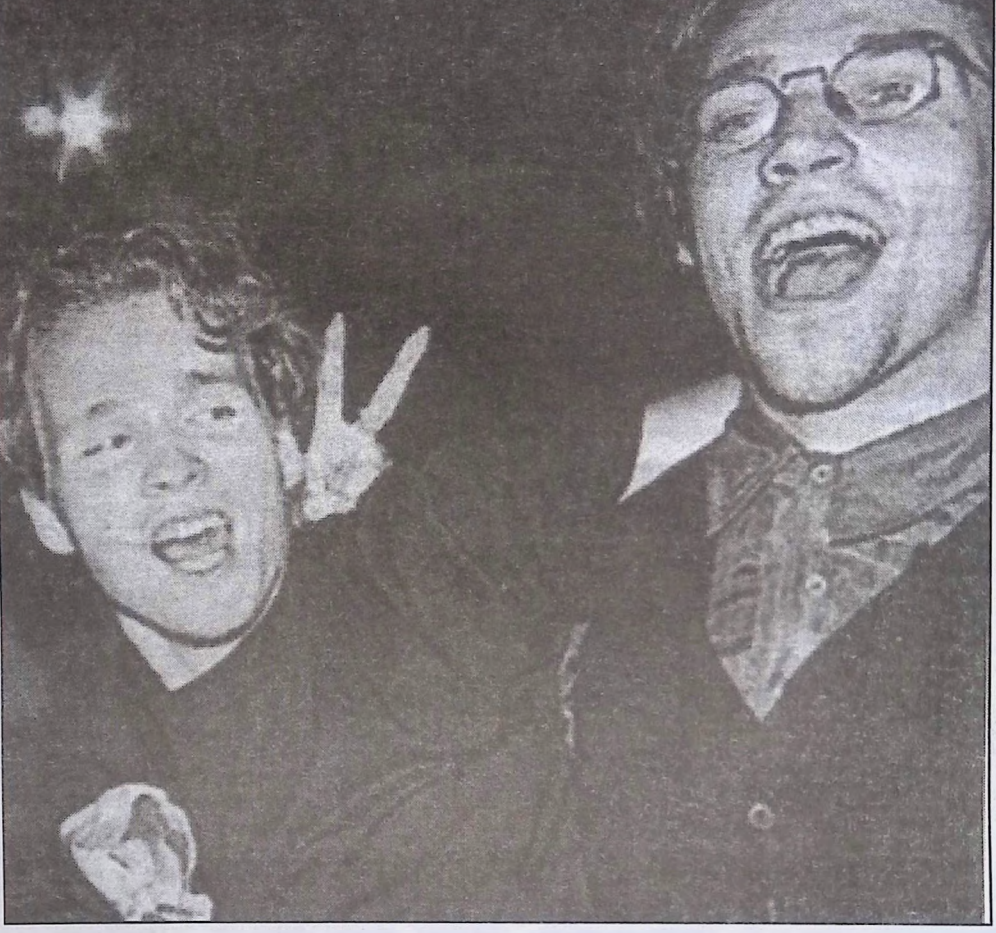
Celebrating in Bonn

concerns of workers. The two central campaign issues were unemployment and welfare.