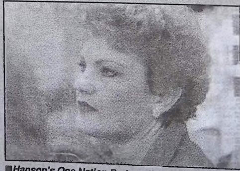
Hanson's One Nation Party suffered a severe blow

However, One Nation did get a significant "primary vote", showing that Hanson's party still has appeal, especially in the rural areas. But for now the party is out of the game.