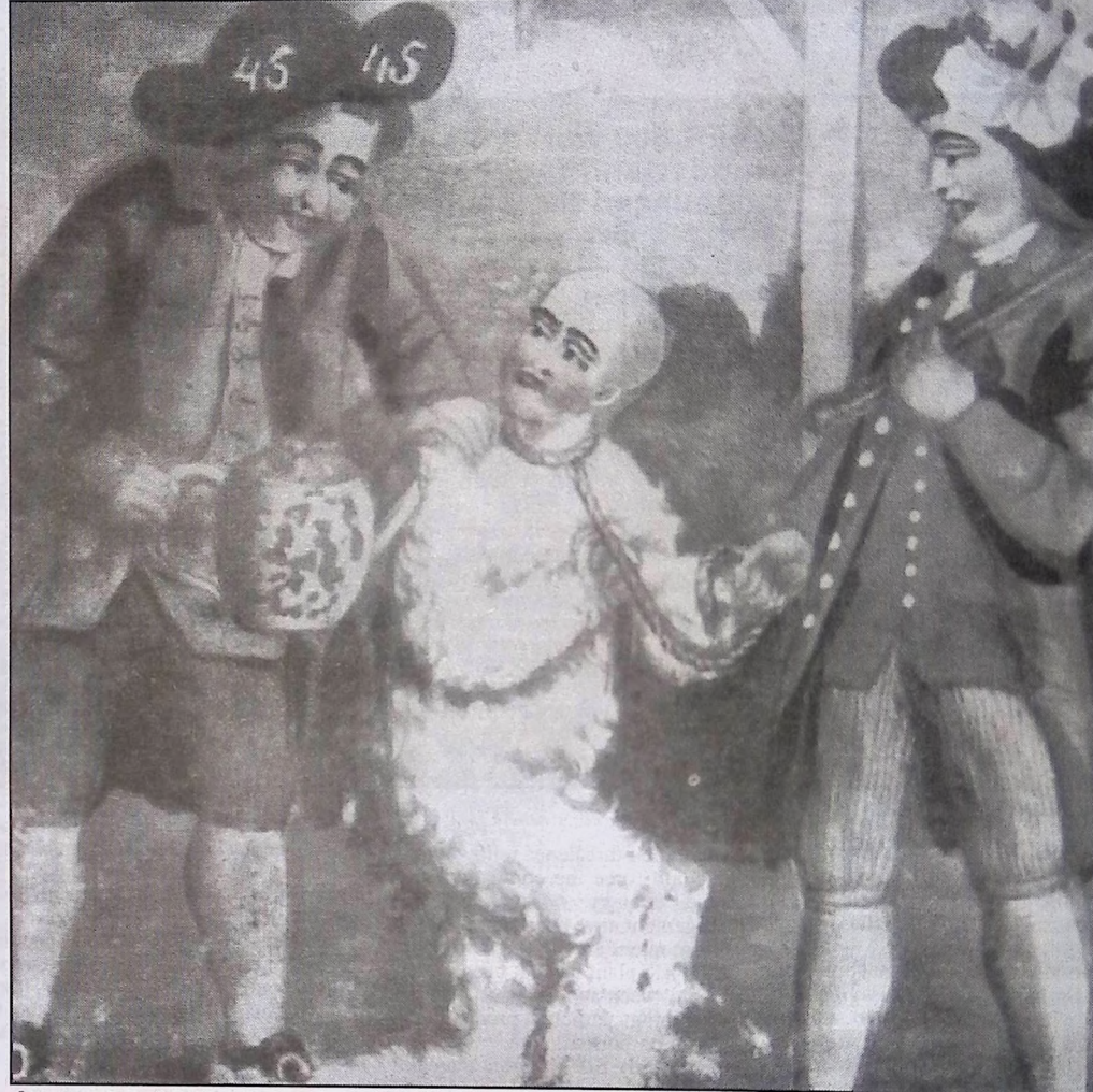
A supporter of British rule is tarred and feathered by the new revolutionaries

After the first defeat for British troops the Continental Congress itself issued a call to take up arms. It appointed a wealthy Virginian planter and former British army officer, George Washington, head of a volun-