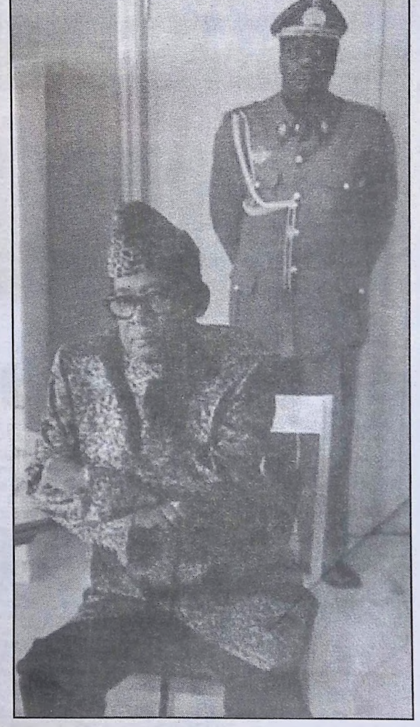
■ Mobutu—got the loans but the people of the Congo

The only realistic solution is to end the situation where the starving keep funds flowing to the bankers.