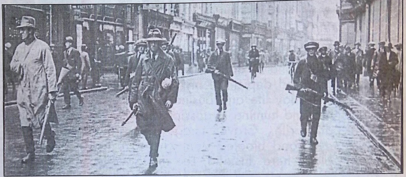
■Revolutionary Dublin, 1921

Every town experienced at least one general strike in this period; Charleville experienced five general strikes between August 1918 and 1923, while Youghal and Dungarvan saw eleven general strikes between them over the same period. In many of the strikes the workers