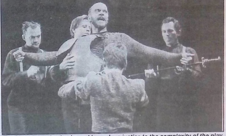
The Abbey's production by and large does justice to the complexity of the play

But the plays of the day still reflect the new conflict of ideas. Machiavellian characters and ideas figured highly in the drama of the time. To get around censor-