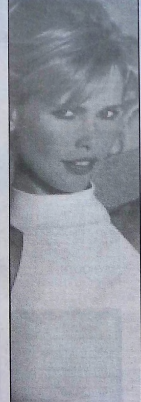
Idealised and objectified

AT THE beginning of the month the Point Theatre in Dublin played host to the Brown Thomas showcase of Irish fashion design. It was hyped as the biggest fashion show ever held in Ireland. The main attraction was the appearance of the supermodels at the event. These women, through exposure on MTV and in magazines like Vogue and Cosmopolitan, are known to millions right across the globe. In recent years the supermodel has replaced the Hollywood star as the icon of the age. These models make huge sums of money—they joke about how they won't get out of bed for less than $10,000. The clothes they model are almost as expensive as the women's time. The vast majority of the women who watch them and read about them will never get their hands on these top designs.