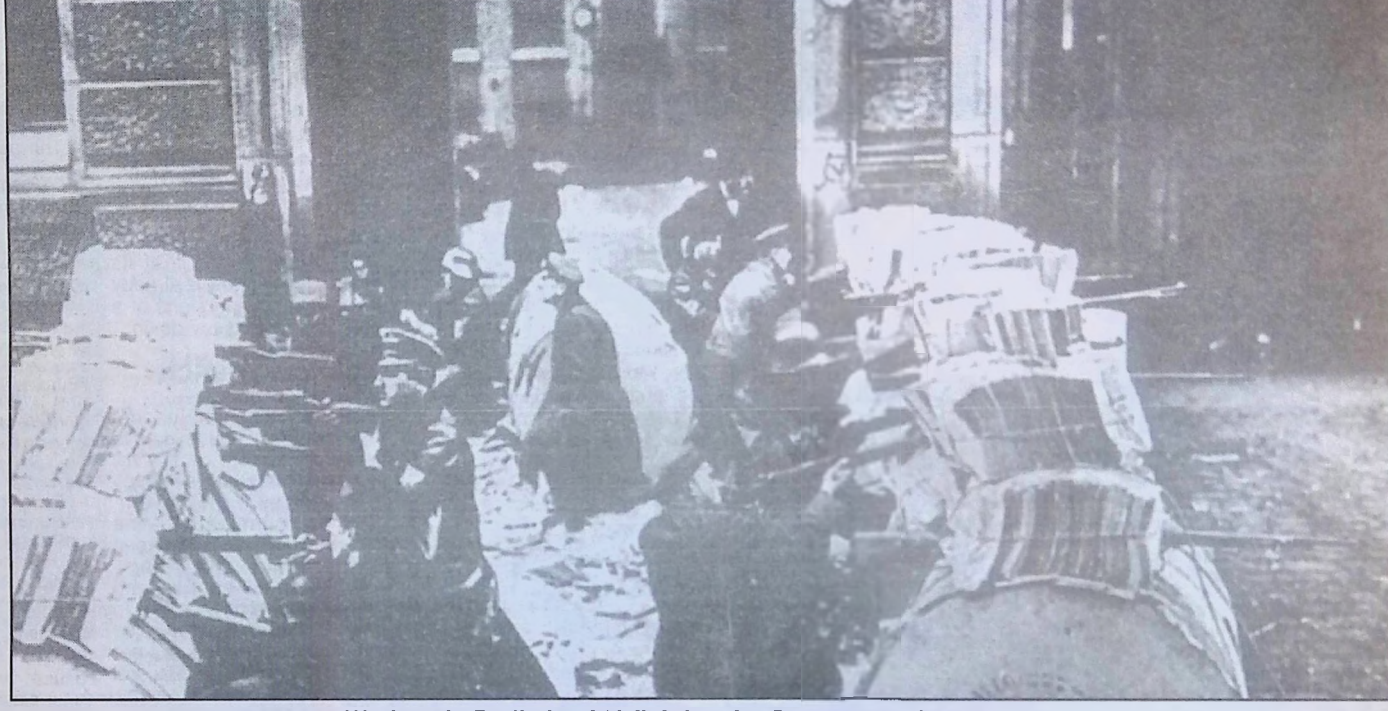
REVOLUTION on the streets. Workers in Berlin in 1919 fighting the Government forces.

The Spartacus group called an antiwar demonstration for May Day