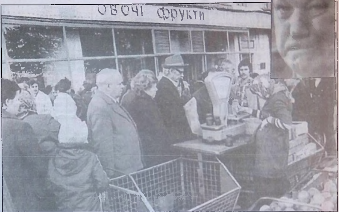
"Market reforms" have done nothing to halt the accelerating collapse in living standards. wages. This is the only way left plants, armaments workers and to us."

The miners' action coincided with a three day strike by 200,000 teachers demanding back pay. One Moscow teacher said, "It is no longer enough to go to work to get paid. Now you have to stop work to get your