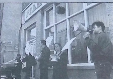
Socialist Worker organised a support picket on the company's Dublin head office

ficials argue that nothing can be done about it, that workers have no choice but to accept it and hope that their 'in-house' bid will be the cheapest option.