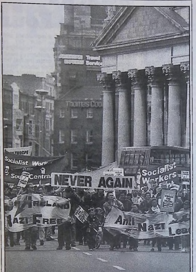
400 people joined an Anti Nazi League march in Dublin against fascism on April 22

THE GOVERNMENT has banned a ship carrying nu-clear waste from entering Dublin port. They say that it is a protest against THORP.