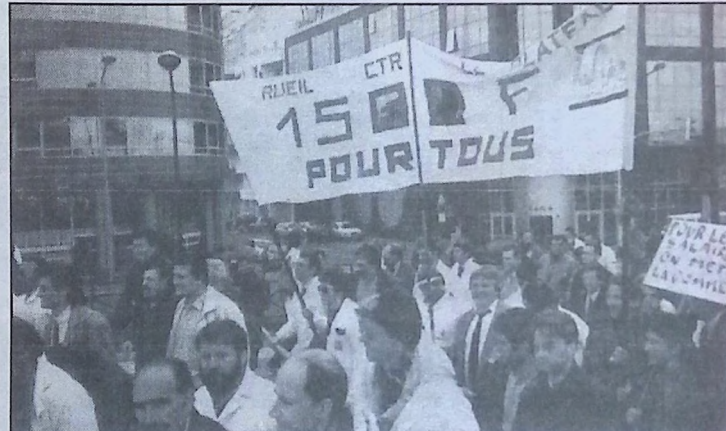
(Above) Chirac and (below) supporters of Arlette Laguiller who is running on a platform of £150 minimum wage

THE VOTE surprised everyone, but it is no great